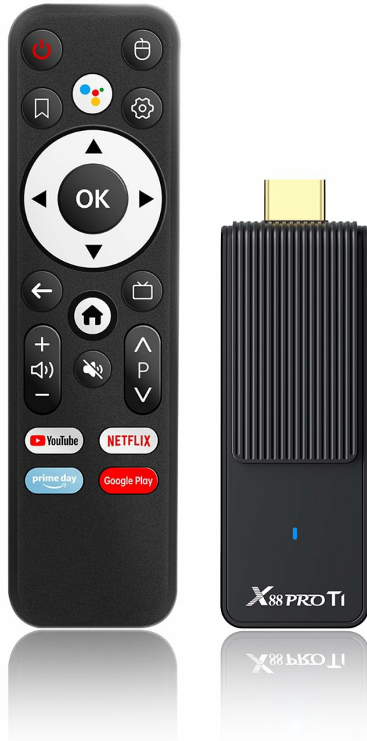
Image: The IDEALROYAL X88 PRO T1 Android TV Stick, its remote control, and a television displaying the Android TV interface with various streaming app icons.