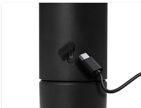
Image: The TIMEMORE Whirly 01S grinder with dimensions (7.48 in height, 2.83 in diameter) and capacity details (up to 35 portions per charge, up to 45g beans capacity).