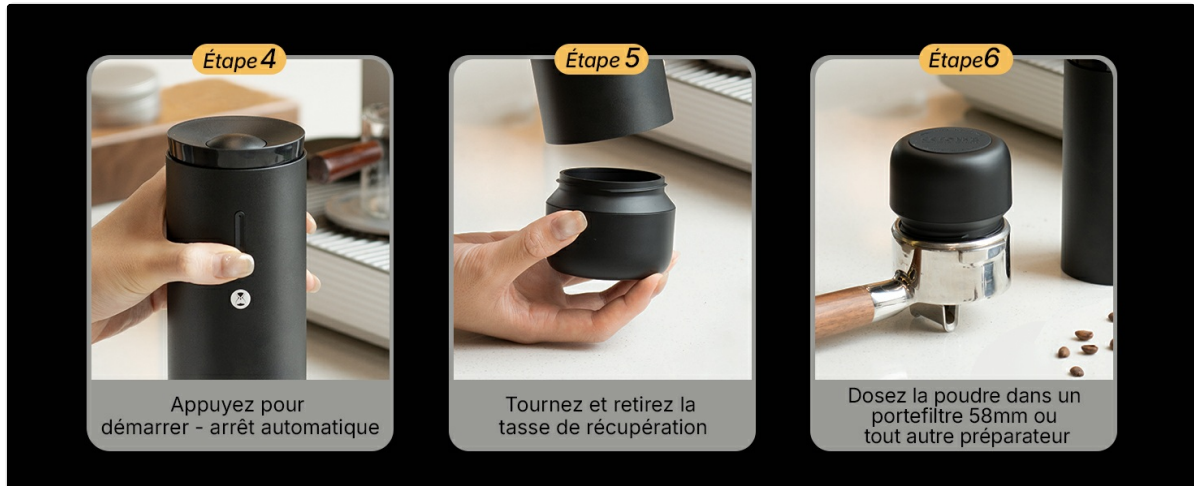
Image: Steps 4-6 of the grinding process. Step 4 shows pressing the button to start, Step 5 shows twisting and removing the catch cup, and Step 6 shows dosing the ground coffee into a portafilter.