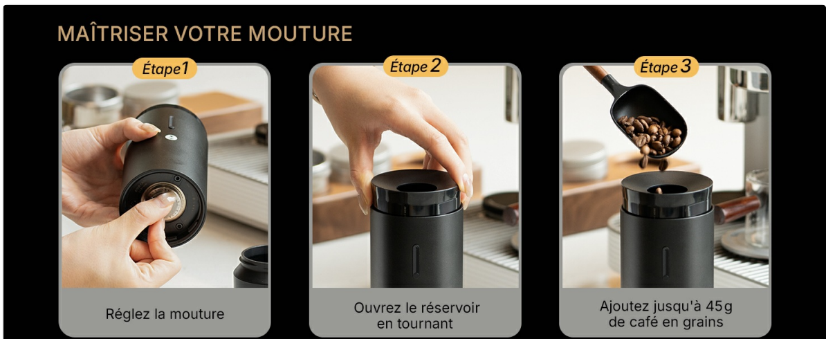
Image: Steps 1-3 of the grinding process. Step 1 shows adjusting the grind, Step 2 shows twisting to open the reservoir, and Step 3 shows adding up to 45g of coffee beans.