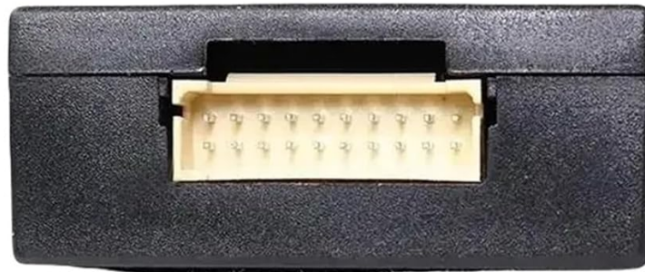
Image: The EKBMELLJ Canbus Box FT-RZ-01, showing its primary connector port where it interfaces with the wiring harness.