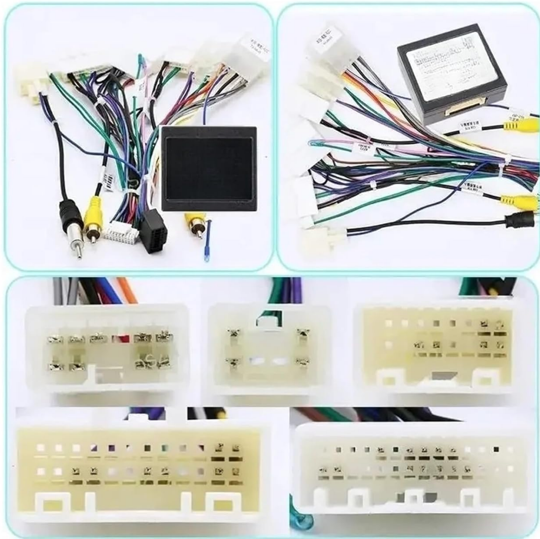
Image: The EKBMELLJ Canbus Box FT-RZ-01 shown alongside its accompanying wiring harness, illustrating the main components included in the package.