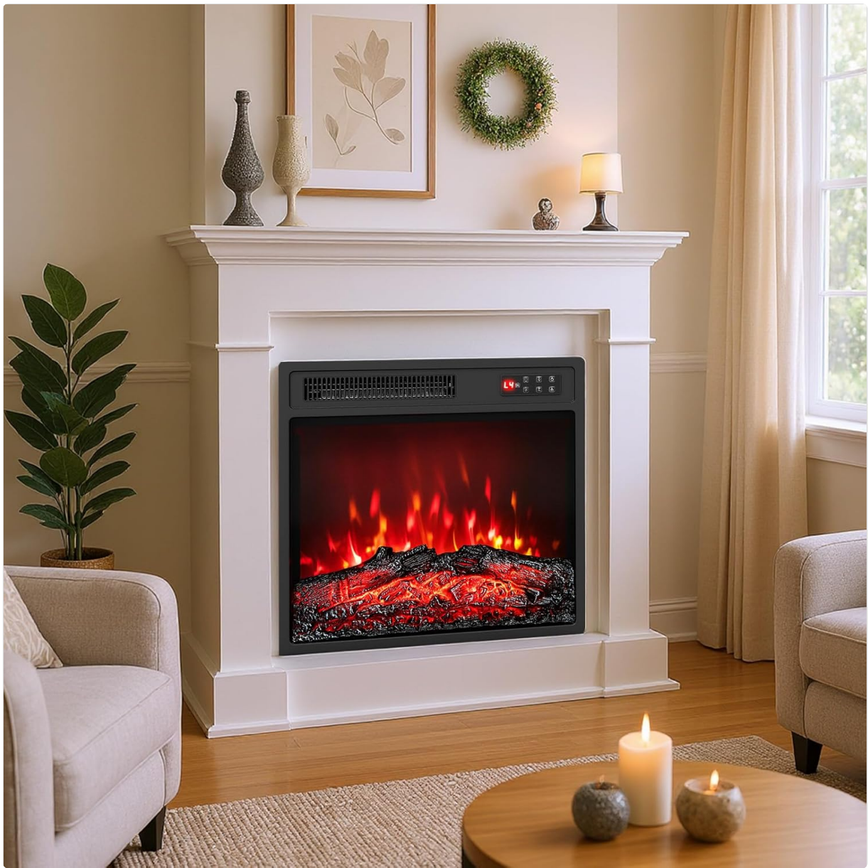
Figure 2: Adjustable Flame Effect with 7 Colors and 5 Brightness Levels.