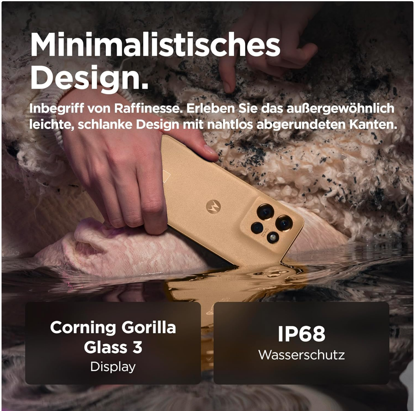
Image: The Motorola Edge 50 Neo showcasing its minimalist design, featuring Corning Gorilla Glass 3 for display protection and an IP68 rating for water resistance.

The display is protected by Corning Gorilla Glass 3, offering enhanced durability against scratches and drops. For additional protection, consider a screen protector.