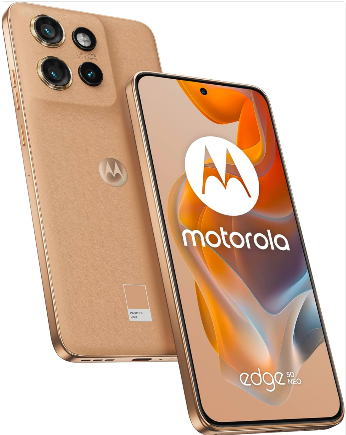
Image: Motorola Edge 50 Neo smartphone, displaying its front screen and rear camera design. The device features a sleek profile and a distinctive camera array.