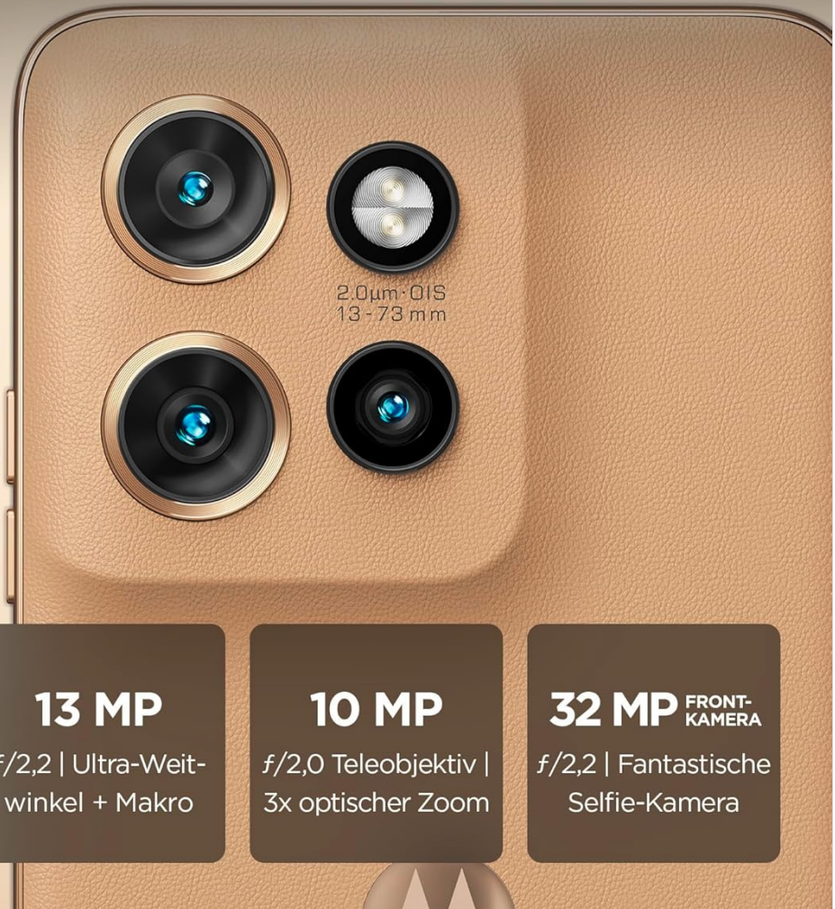
Image: A detailed view of the Motorola Edge 50 Neo's camera lenses, highlighting the 50 MP main camera, 13 MP ultra-wide/macro lens, and the 32 MP front camera capabilities.

Erzählen Sie unvergessliche Geschichten mit brillanten Kameras und Moto KI-Features.