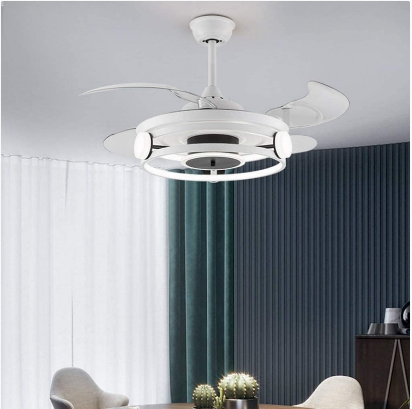
Figure 6.1: The OUZVI ceiling fan providing illumination and air circulation in a dining room setting.