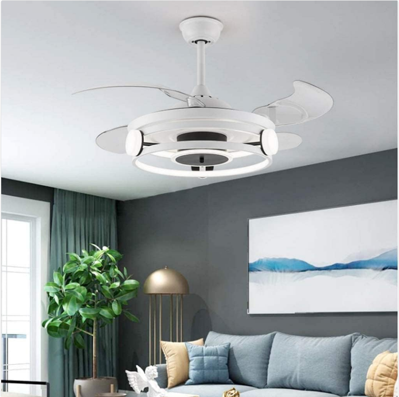
Figure 5.1: The OUZVI ceiling fan seamlessly integrated into a modern living room setting, demonstrating its aesthetic appeal.