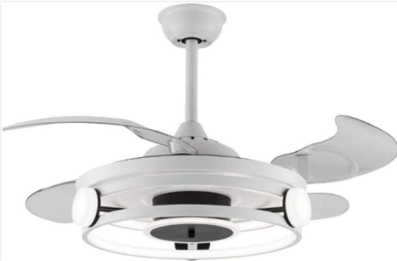
Figure 3.1: Main view of the OUZVI 42-inch Invisible LED Ceiling Fan, showcasing its white finish and integrated light fixture.