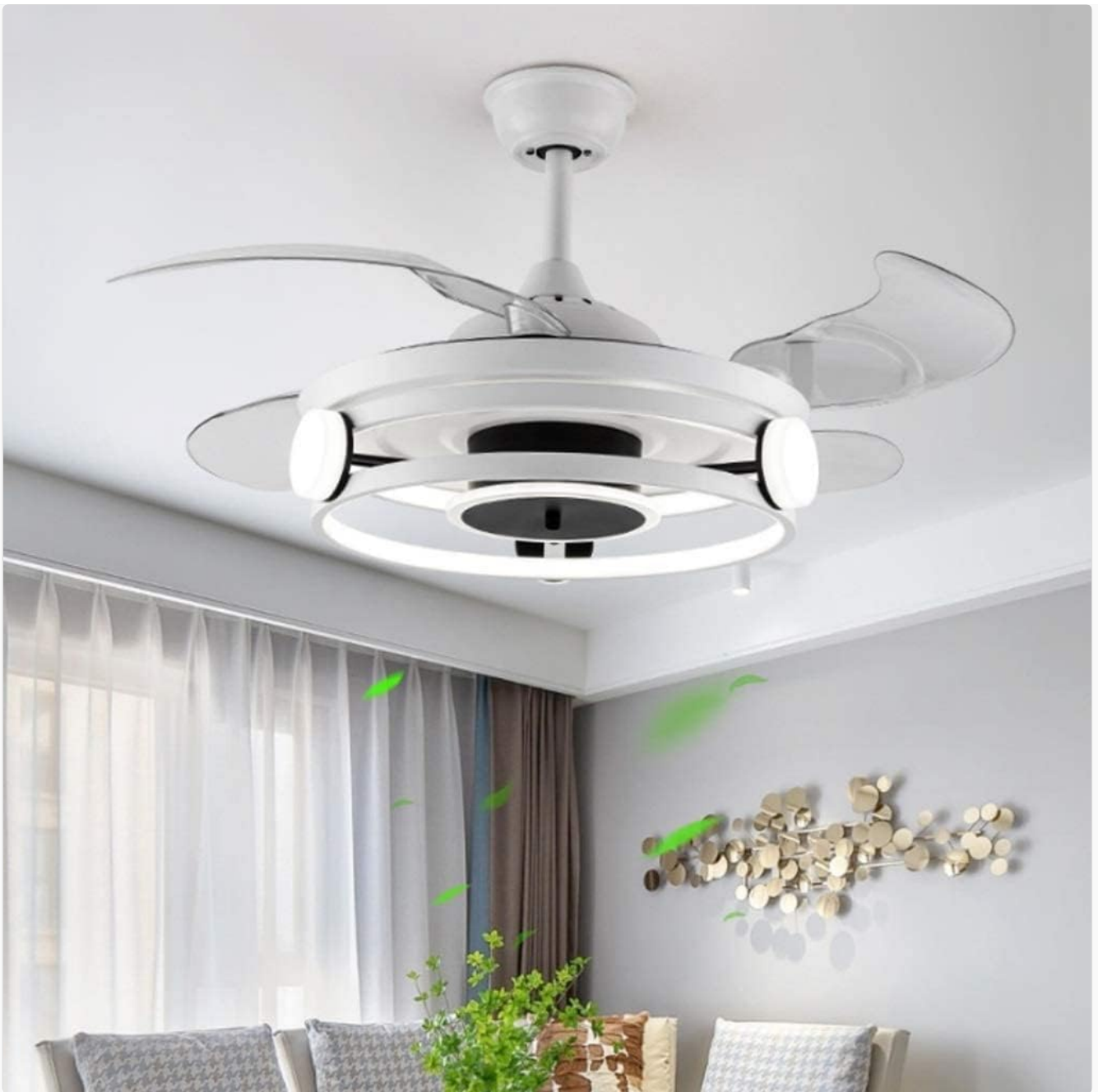
Figure 6.3: The OUZVI ceiling fan in operation, illustrating the airflow generated by its extended blades, providing a comfortable breeze in the room.