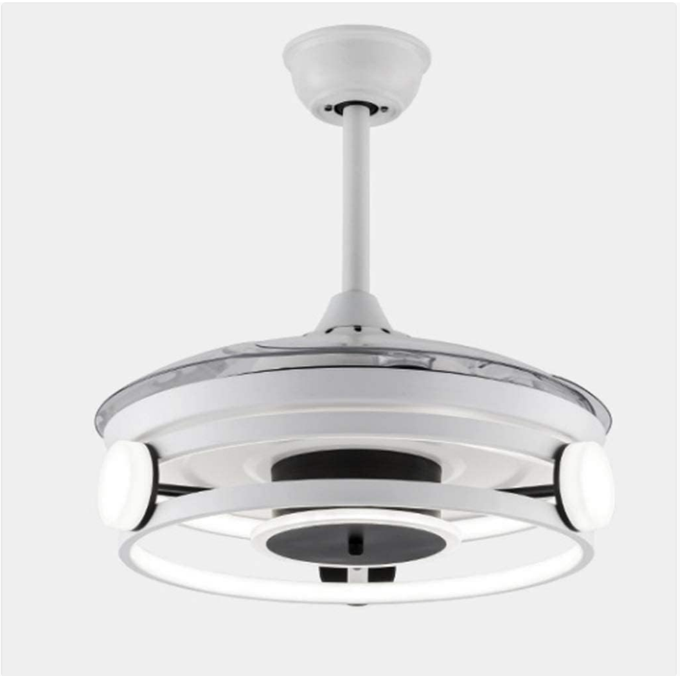
Figure 6.2: Side view of the OUZVI ceiling fan with its transparent acrylic blades fully retracted, showcasing its compact and discreet design when not in use as a fan.