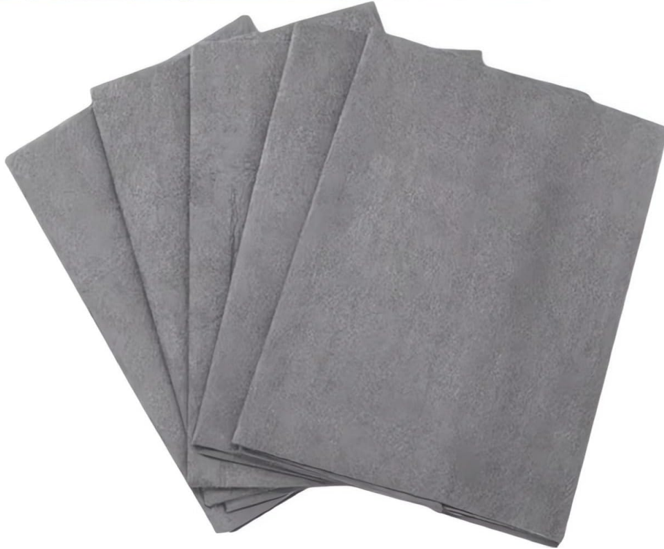
Image: A set of Thickened Magic Cleaning Cloths, demonstrating their multi-surface cleaning capabilities.