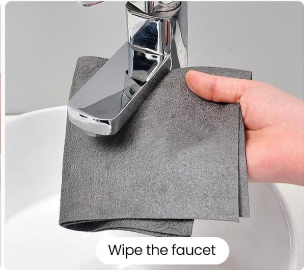
Image: Versatile applications of the cleaning cloth across multiple environments.