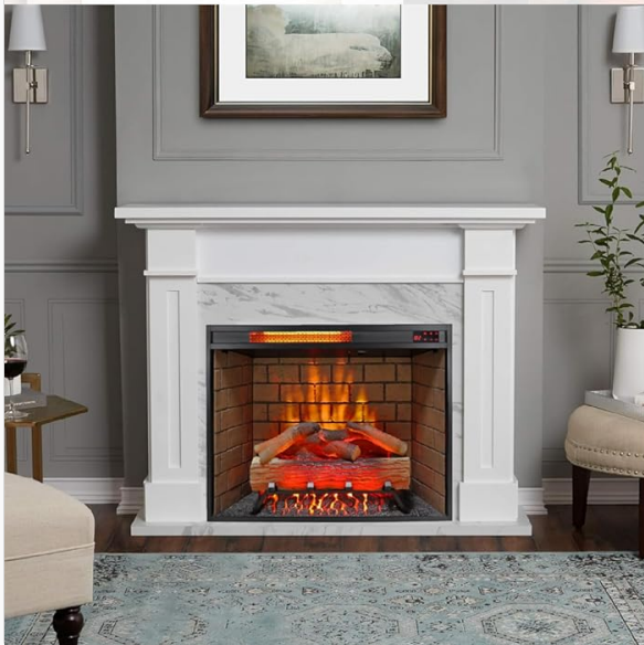
Method 3: Insert to mantel.

Image 3: Visual representation of the three installation methods: built-in with U-shape trims, built-in with surround trims, and insertion into a mantel.