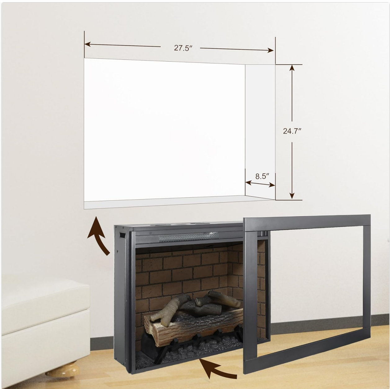
Image 4: Recommended wall opening dimensions for built-in installation: 27.5" Width x 24.7" Height x 8.5" Depth.