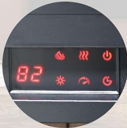
3D flame effect.