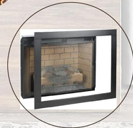
Removable trim kit.