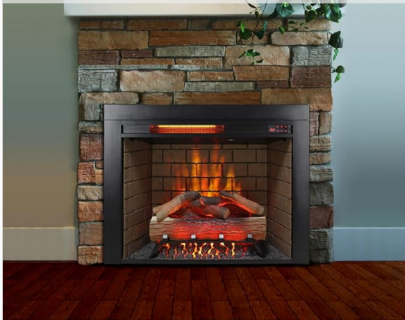
Method 1: Built in wall with U shape trims.