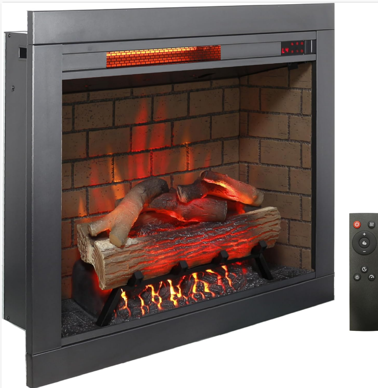
Image 1: Front view of the Zateety 28-inch Electric Fireplace Insert, showcasing the realistic log and flame effects, alongside the included remote control.

The Zateety 28-inch Electric Fireplace Insert provides a realistic flame effect and supplemental heating for your home. It features a digital display touch control panel and an infrared remote control for convenient operation. This insert is designed for various installation methods, including built-in wall applications with or without trim kits, or insertion into a mantel.