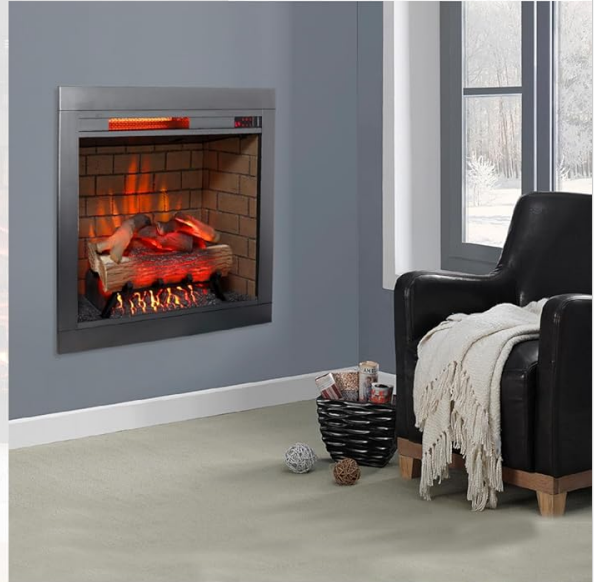
Method 2: Built in wall with surround trims.