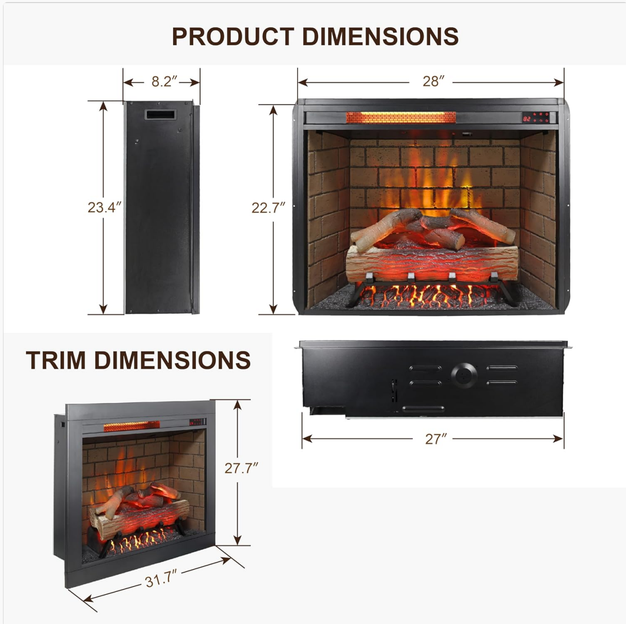
Image 2: Detailed diagram illustrating the dimensions of the fireplace insert (28" W x 22.7" H x 8.2" D) and the trim kit (31.7" W x 27.7" H).