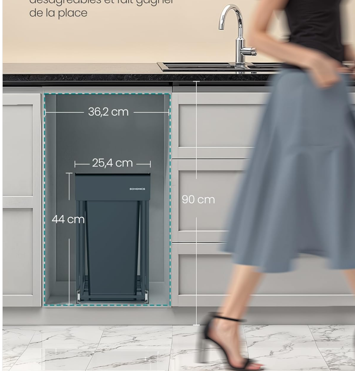
Image 1.1: The SONGMICS pull-out recycling bin discreetly installed under a kitchen counter, illustrating its space-saving design and general dimensions.

Elle cache les déchets, retient les odeurs désagréables et fait gagner de la place