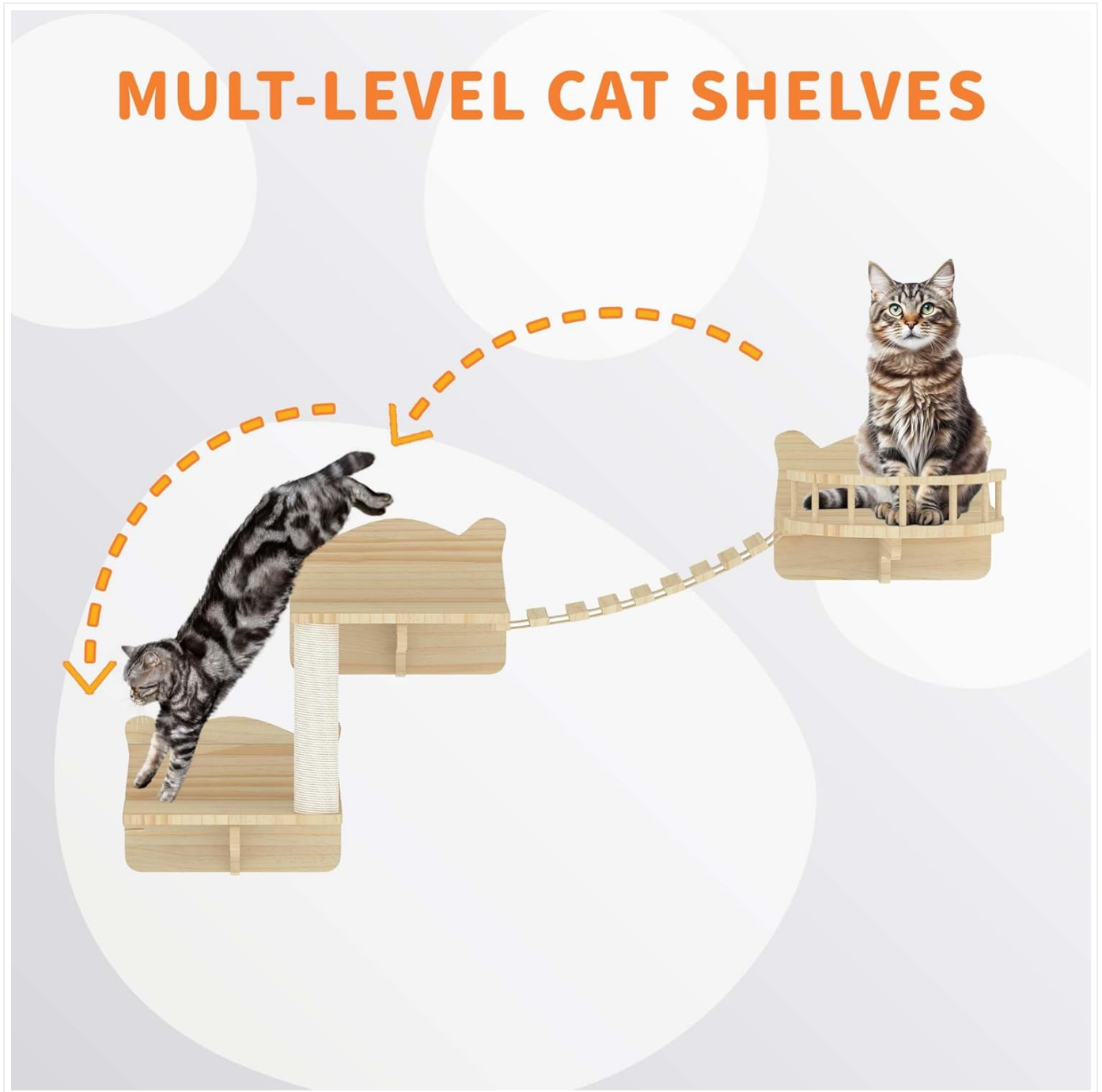
Figure 3: Multi-Level Interaction. This image depicts a cat actively using the multi-level design of the shelves, illustrating how cats can jump and navigate between different platforms.