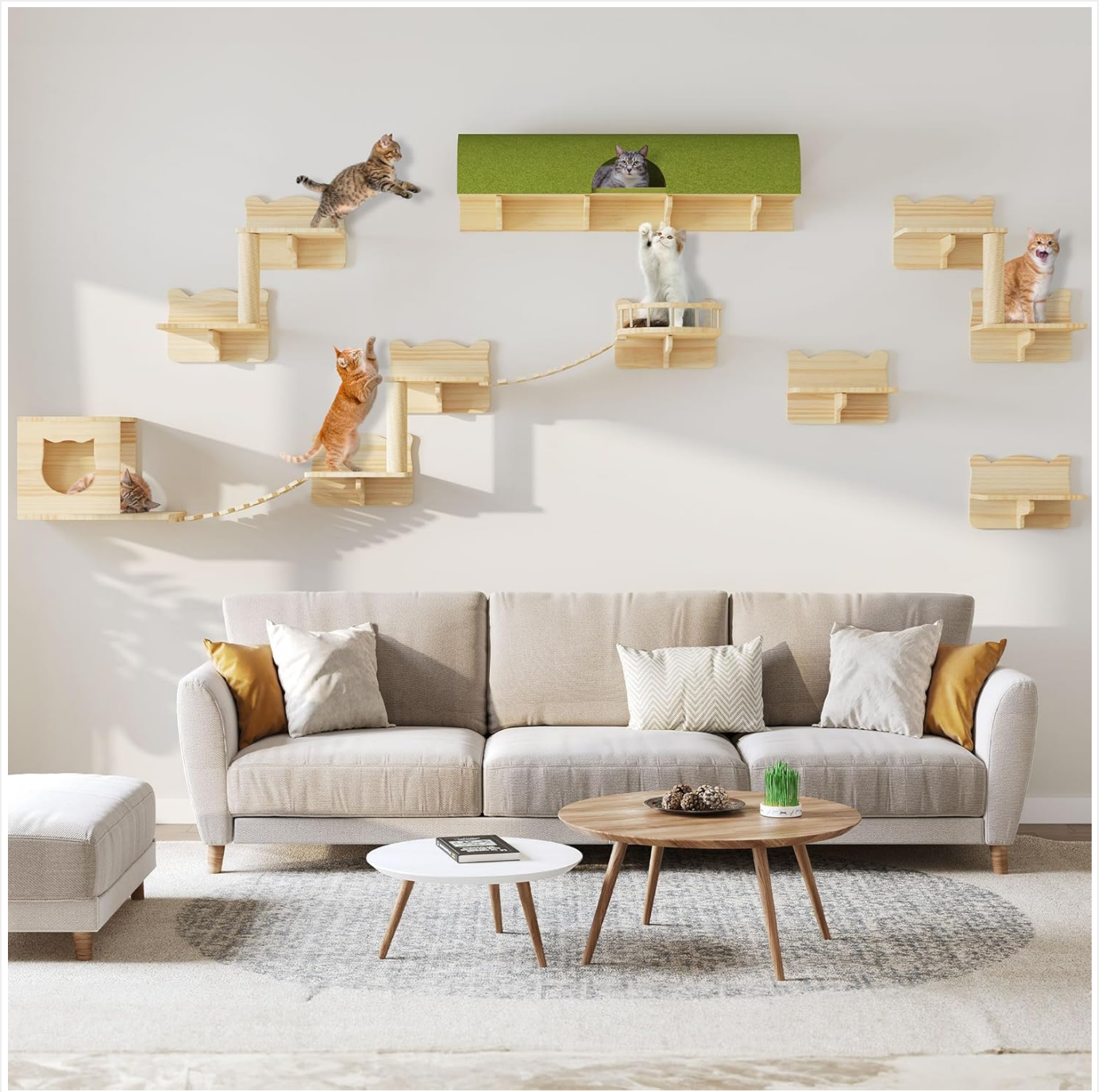
Figure 2: Example Installation. This image displays a fully assembled Homiflex Cat Wall Shelves system in a home environment, showcasing how various components can be arranged to create an engaging vertical space for cats.