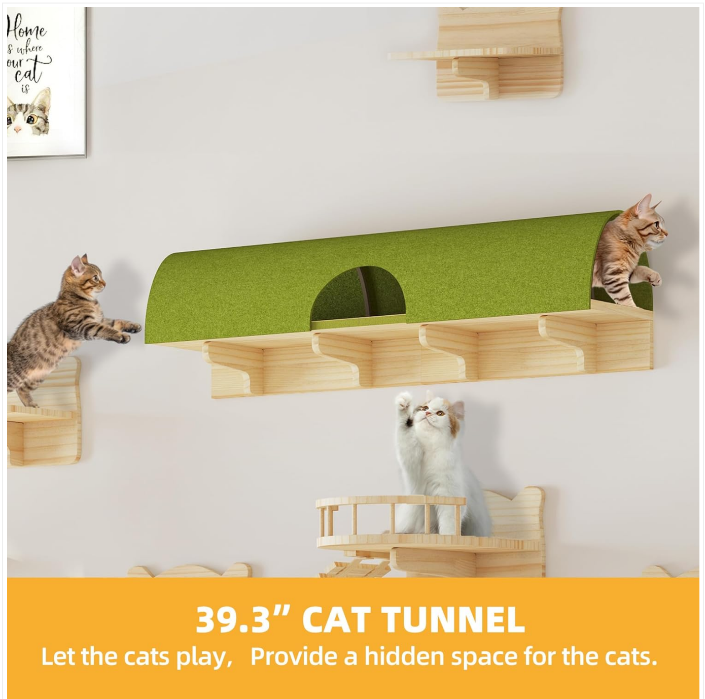
Figure 4: Cat Tunnel Use. This image shows two cats utilizing the 39.3-inch cat tunnel component, demonstrating its function as a secure and engaging space for feline activity.