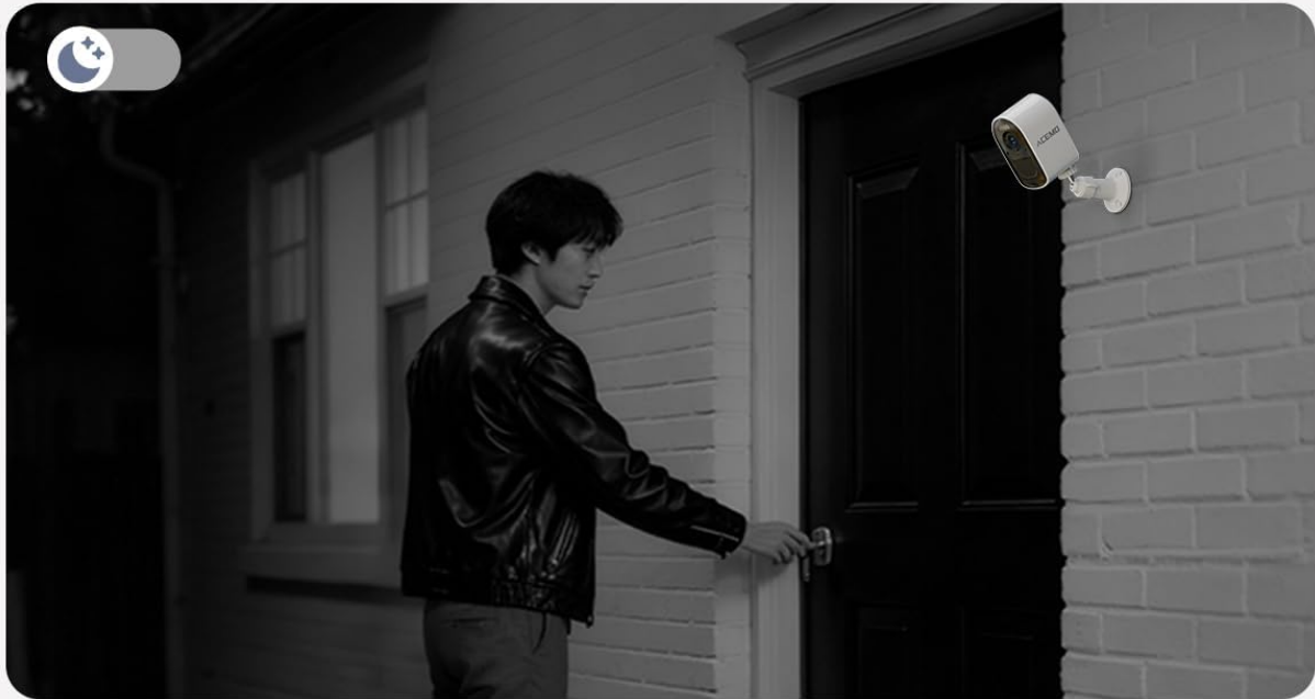
Image: Demonstrates the difference between infrared and full-color night vision capabilities.