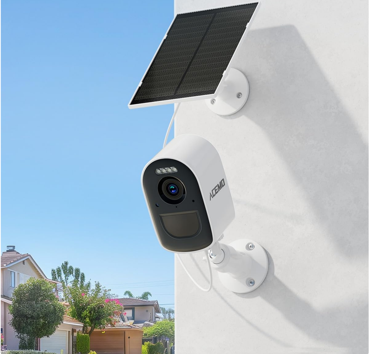
Image: A solar-powered camera installed outdoors, highlighting its easy setup.