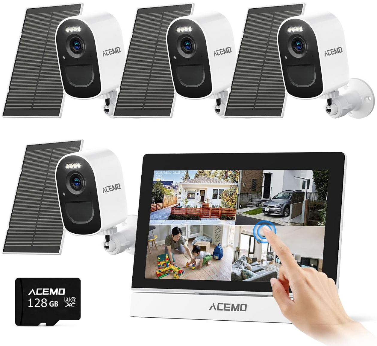
Image: Overview of the ACEMO Wireless Security Camera System components.