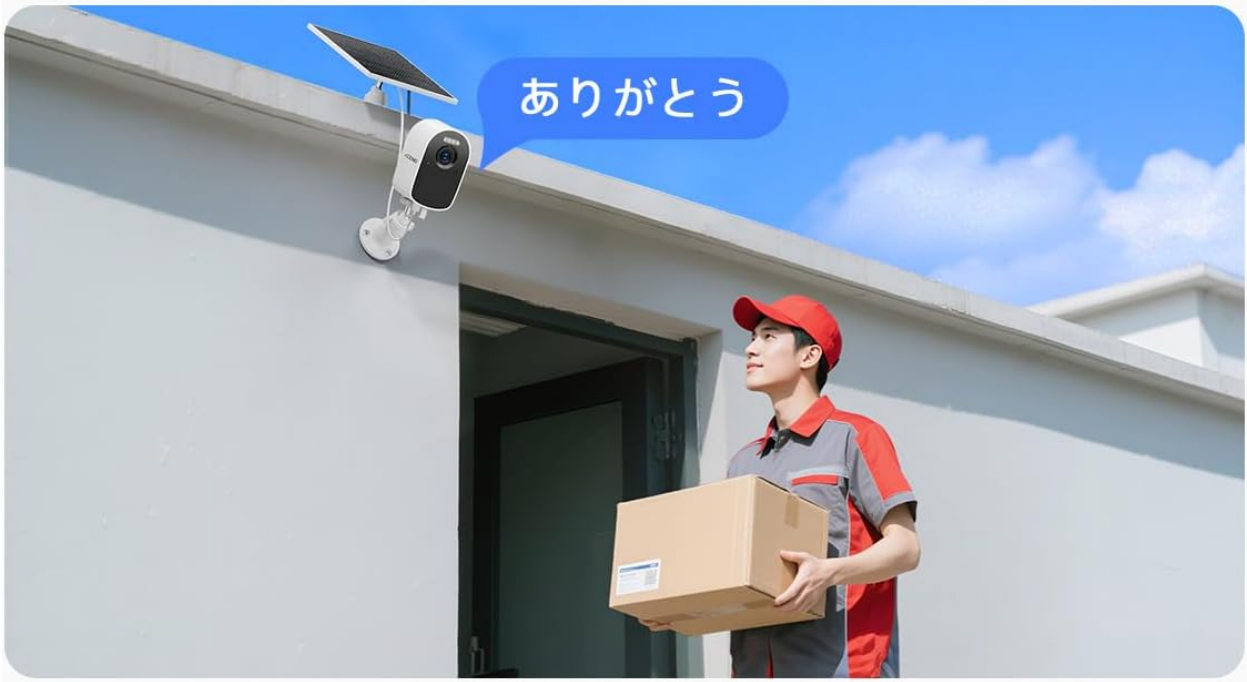
Image: Demonstrates two-way audio communication between a user on a smartphone and a person at the camera's location.