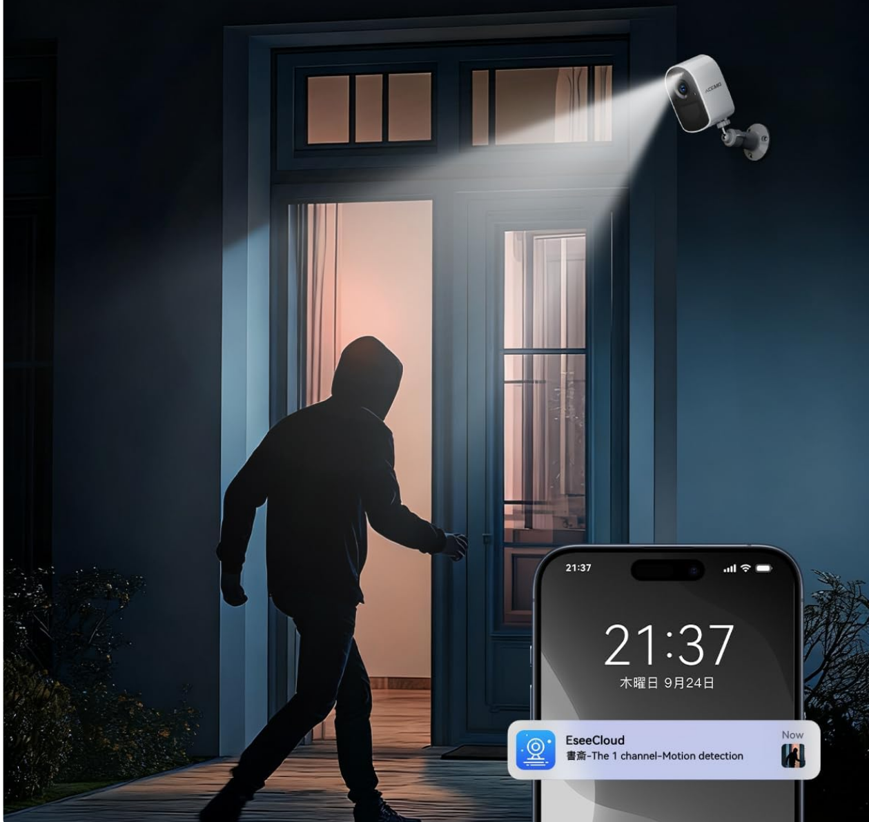
Image: Various alarm modes including LED light, siren, and motion detection push notifications.