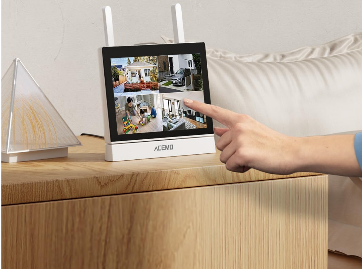
Image: The 7-inch touchscreen monitor showing multiple camera views, with a 128GB SD card for recording.