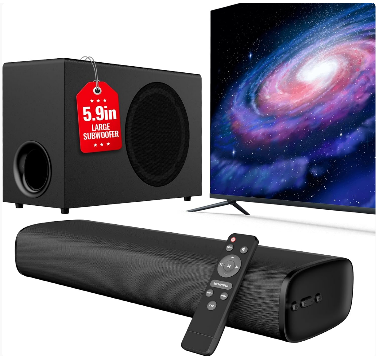
Figure 1: vibeadio Sound Bar and Subwoofer system.