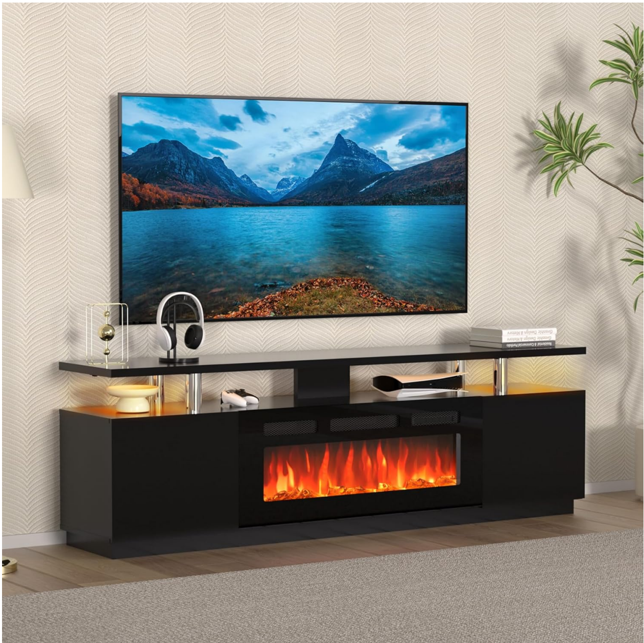
Image: The KOKEBREN 70-inch Fireplace TV Stand, showcasing its sleek black design and integrated electric fireplace, positioned in a modern living room setting.