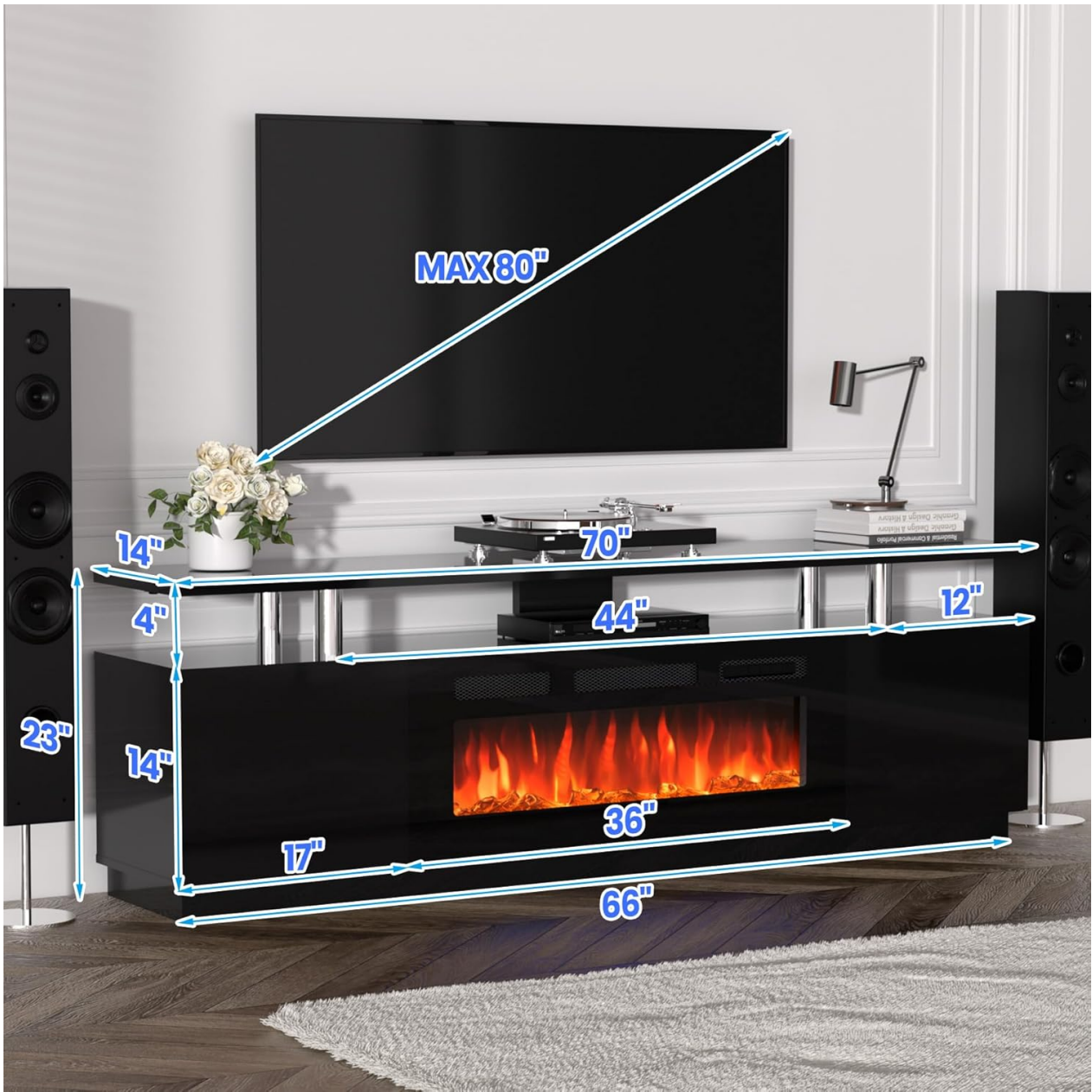
Image: A diagram illustrating the overall dimensions of the TV stand (70" wide, 22.8" high, 13.8" deep) and the 36" fireplace insert, along with maximum TV size (80").