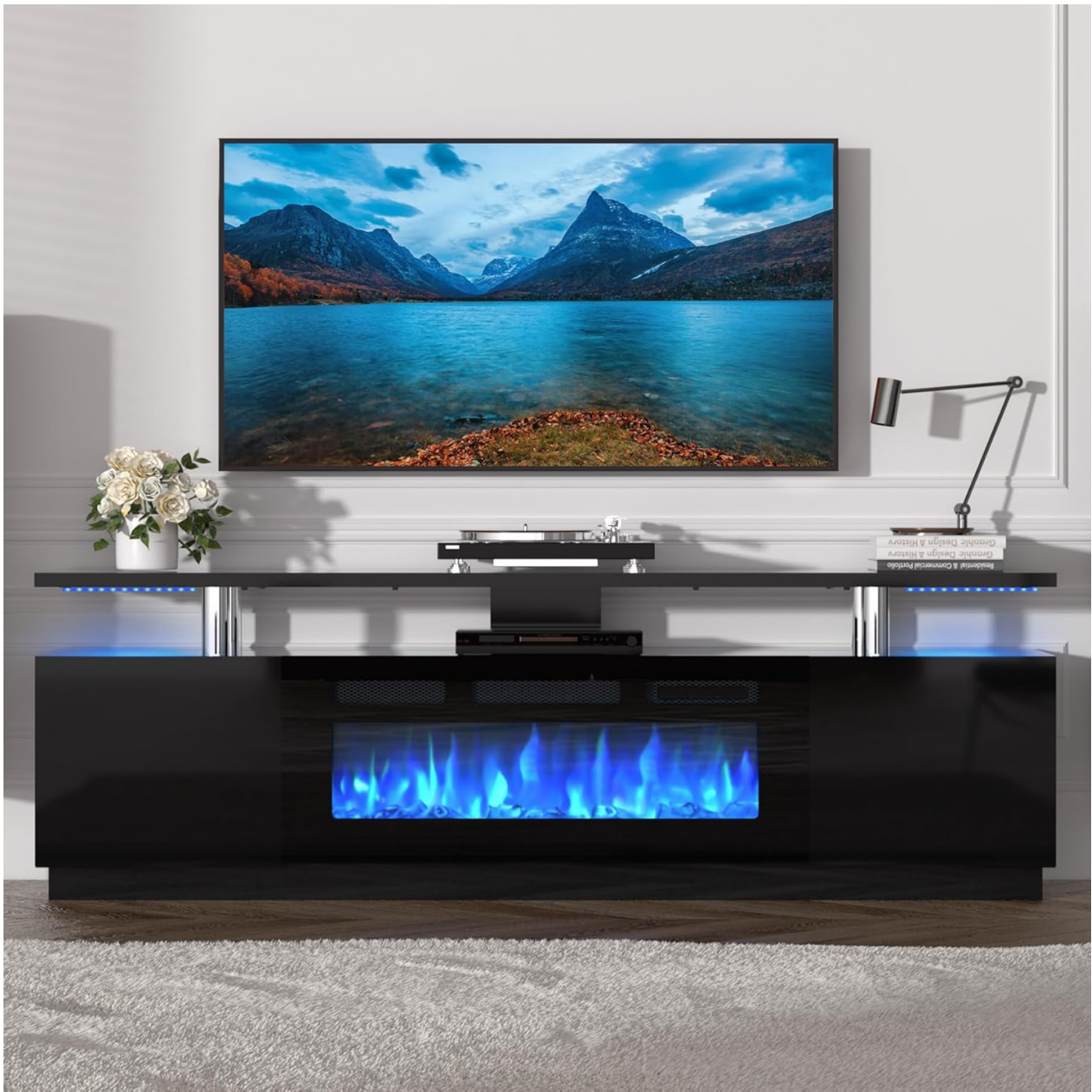
Image: The KOKEBREN Fireplace TV Stand displaying a vibrant blue flame effect, demonstrating one of the 12 available flame colors.