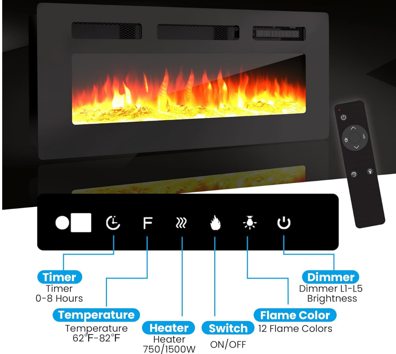
Image: This graphic displays 12 realistic flame colors, along with icons indicating key features such as temperature control, timer setting, overheat protection, and ETL certification.