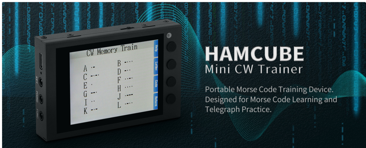
Image 1.1: The HAMCUBE Mini CW Trainer, a portable Morse code training device.

The HAMCUBE Mini CW Trainer is a portable device designed for learning and practicing Morse code (CW). It features a compact design, a built-in speaker for standalone practice, and various interfaces for external connections. This manual provides essential information for setting up, operating, and maintaining your CW trainer.