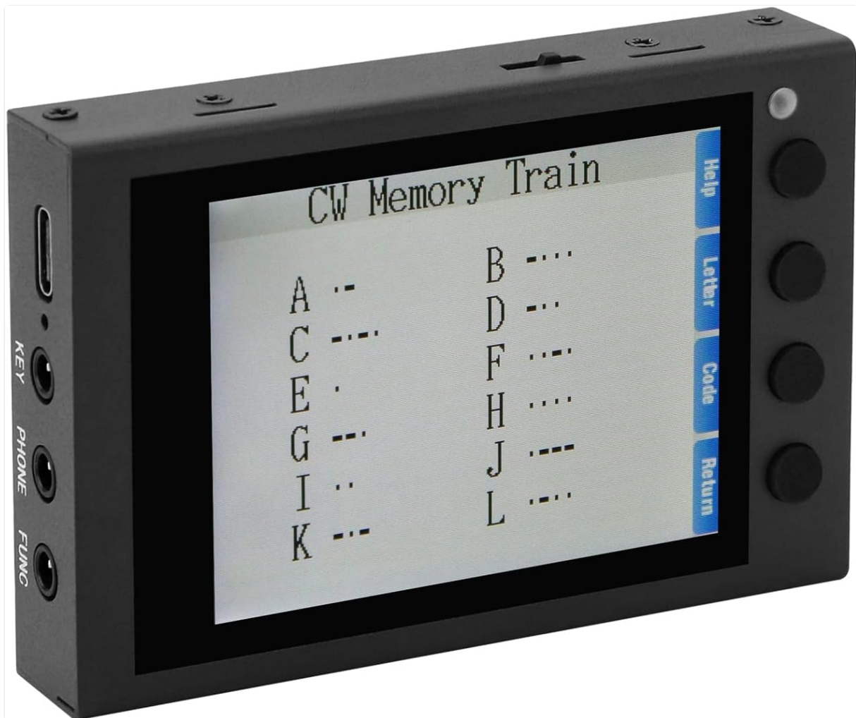
Image 5.1: Device screen showing the main menu and Morse code characters.