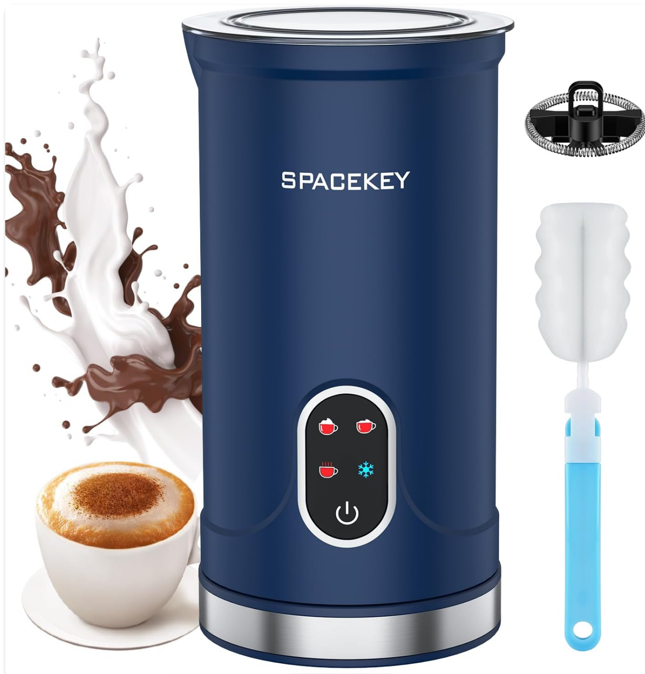
Image: The Spacekey Milk Frother JY-MF01 in blue, showcasing its compact design and control panel.