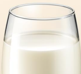
Milk Warm up