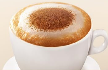
Hot Dense Foam