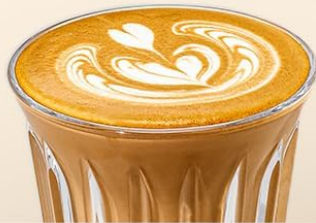
Hot Airy Foam