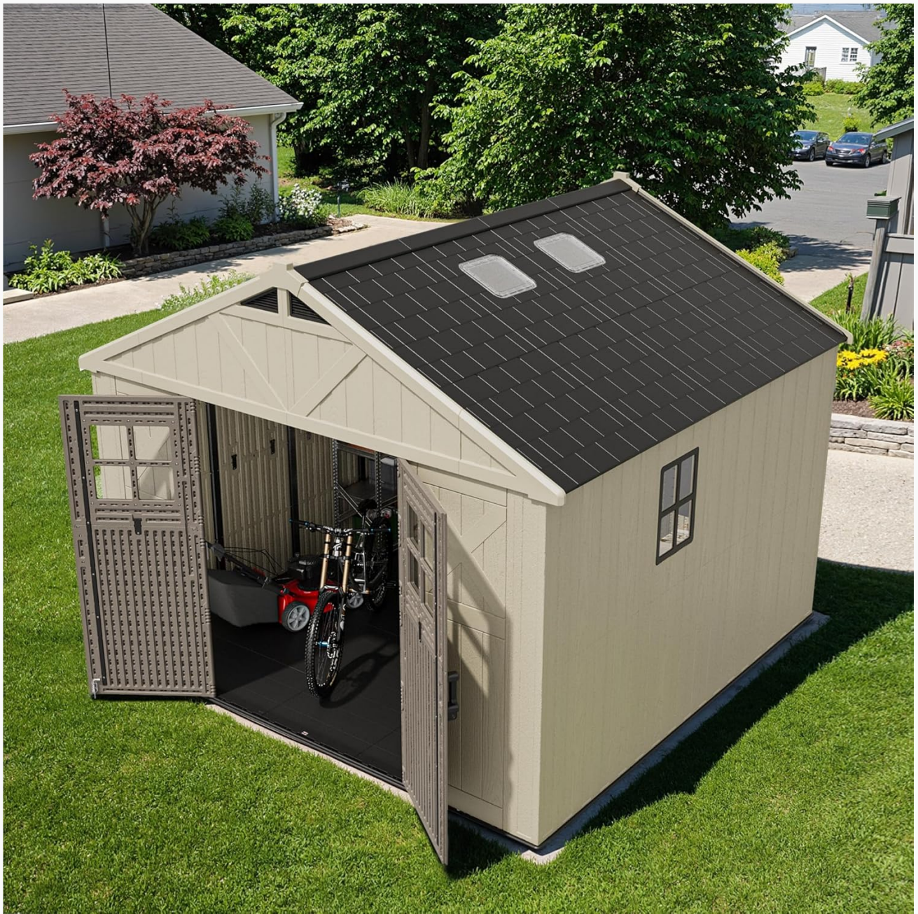
Image: The Devoko 10x10 FT storage shed with its double doors fully open, revealing a spacious interior capable of storing a bicycle, lawnmower, and various garden tools.