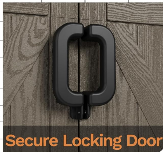
Image: A composite image highlighting key features: a close-up of the waterproof roof, a detail of the heavy-duty structural build, and the secure locking door handle.