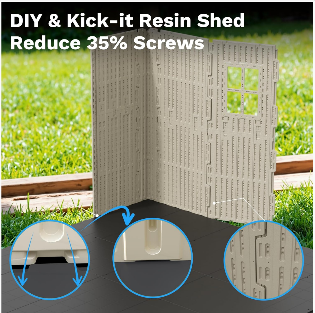
Image: Detailed view of the shed's resin panels demonstrating the 'DIY & Kick-it' assembly method, which is designed to reduce the number of screws required for construction.