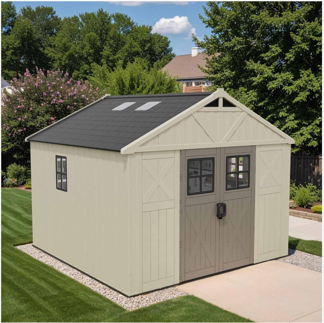
Image: The Devoko 10x10 FT Plastic Outdoor Storage Shed, shown with its doors closed, situated in a well-maintained backyard environment.