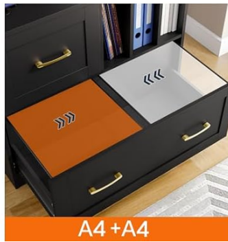
A4 + A4