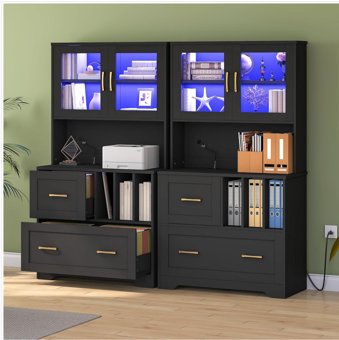
Figure 2: Assembled HOOBRO 2-Drawer File Cabinets with integrated LED lighting, showcasing their use in an office environment.