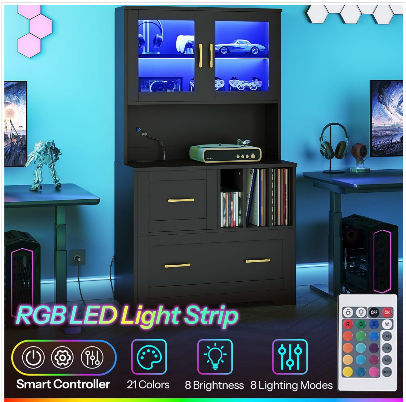
Figure 4: The cabinet showcasing its RGB LED light strip and the remote control for various lighting options.