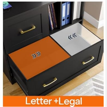
Letter + Legal