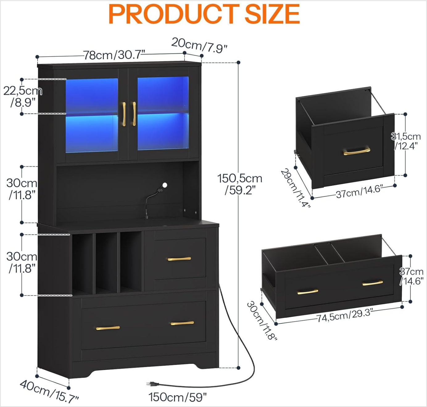
Figure 1: Detailed product dimensions including height, width, and depth for various sections of the HOOBRO file cabinet.