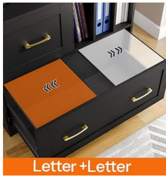
Letter + Letter