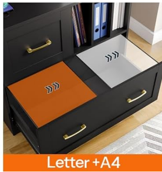
Letter + A4