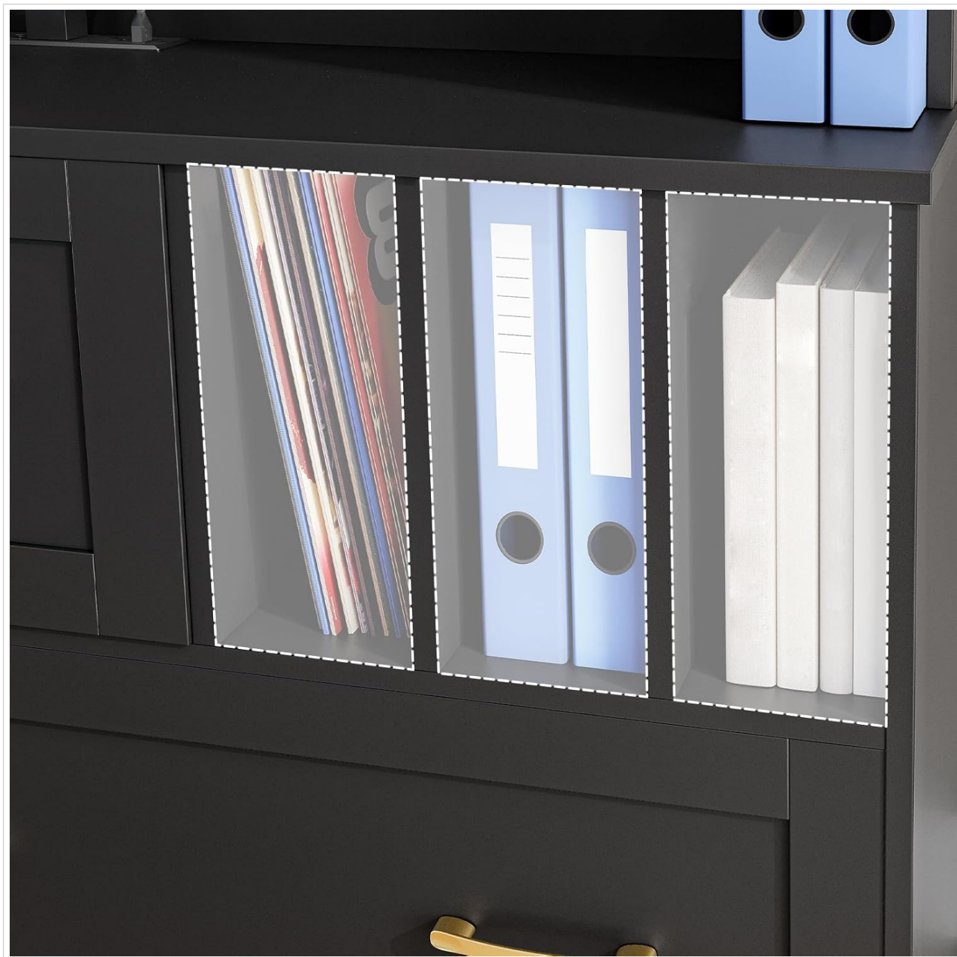
Figure 7: The open storage shelves, suitable for organizing books, binders, or other office essentials.