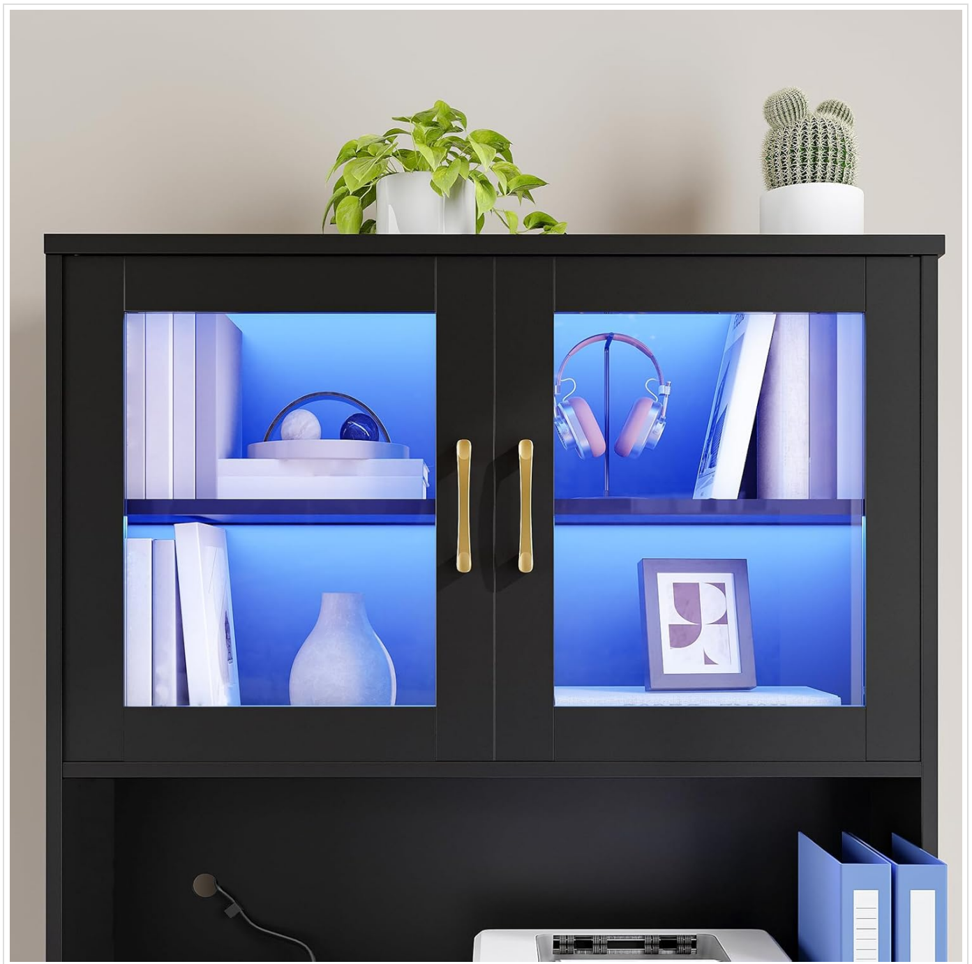
Figure 5: Detailed view of the glass doors with internal LED illumination, highlighting displayed items.