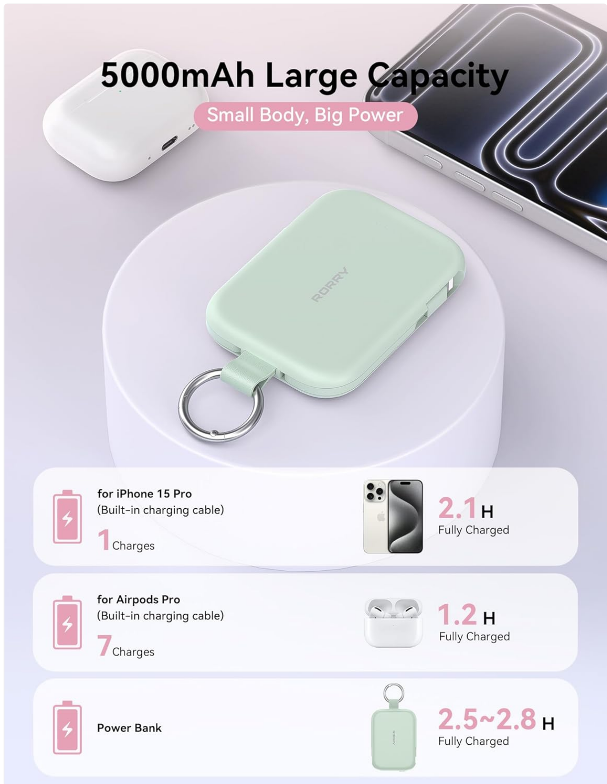
Image 4.2: The RORRY T1-5000 with its LED battery indicator lights illuminated, showing remaining charge.