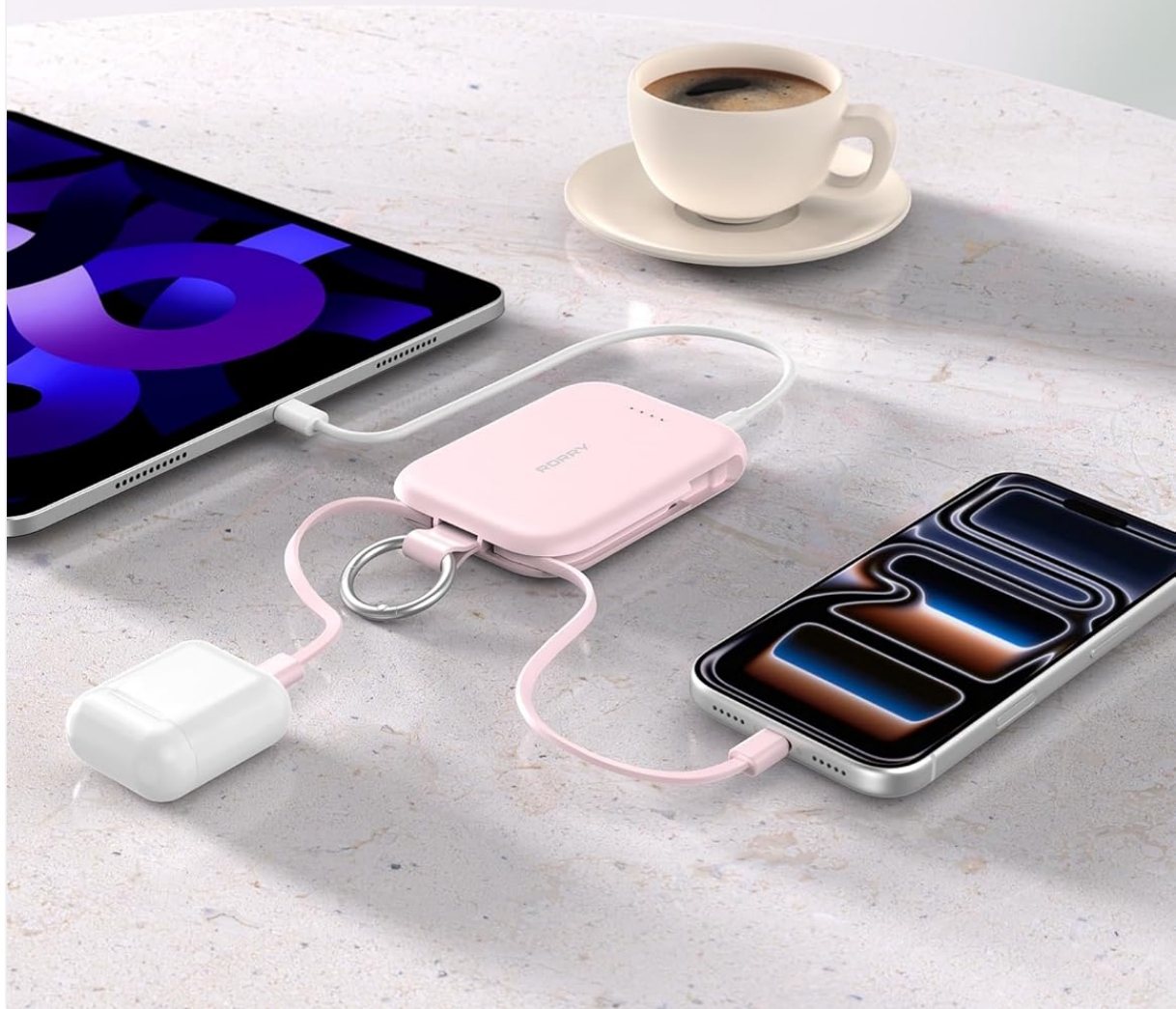
Image 6.1: The RORRY T1-5000 demonstrating its 3-in-1 charging capability, powering an iPhone, AirPods, and a tablet simultaneously.