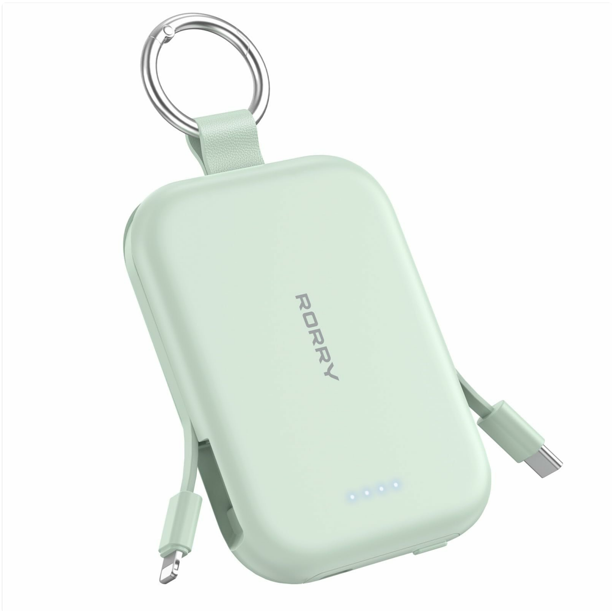
Image 1.1: The RORRY T1-5000 Portable Charger, showcasing its compact design and keychain attachment.