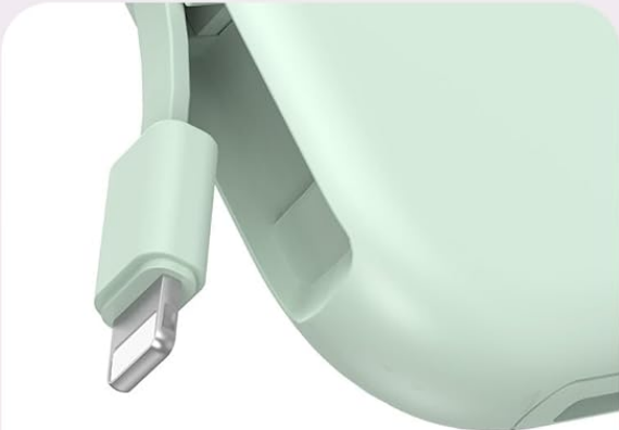
For iPhone Cable