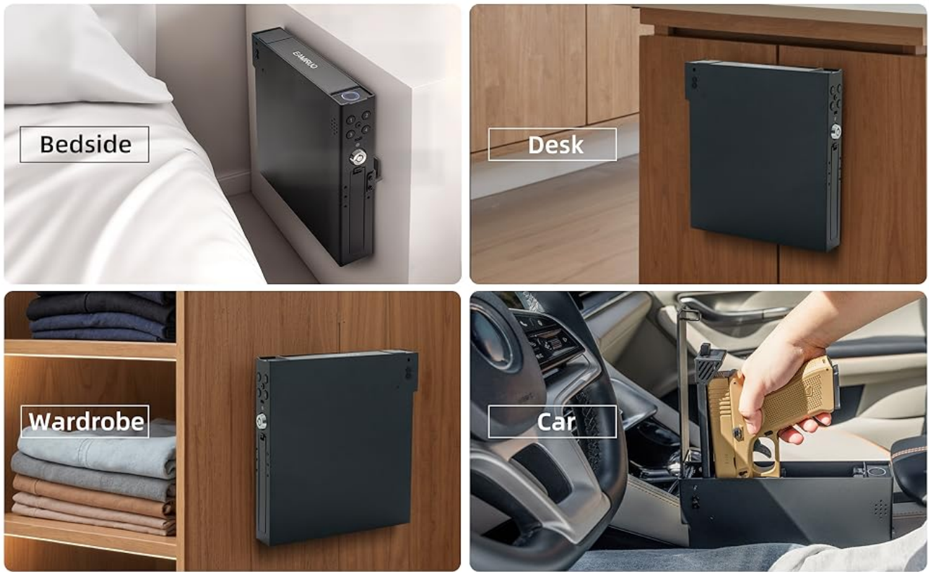
Figure 5: EAMIRUO EA-70 installed next to a bedside table.

Your browser does not support the video tag.