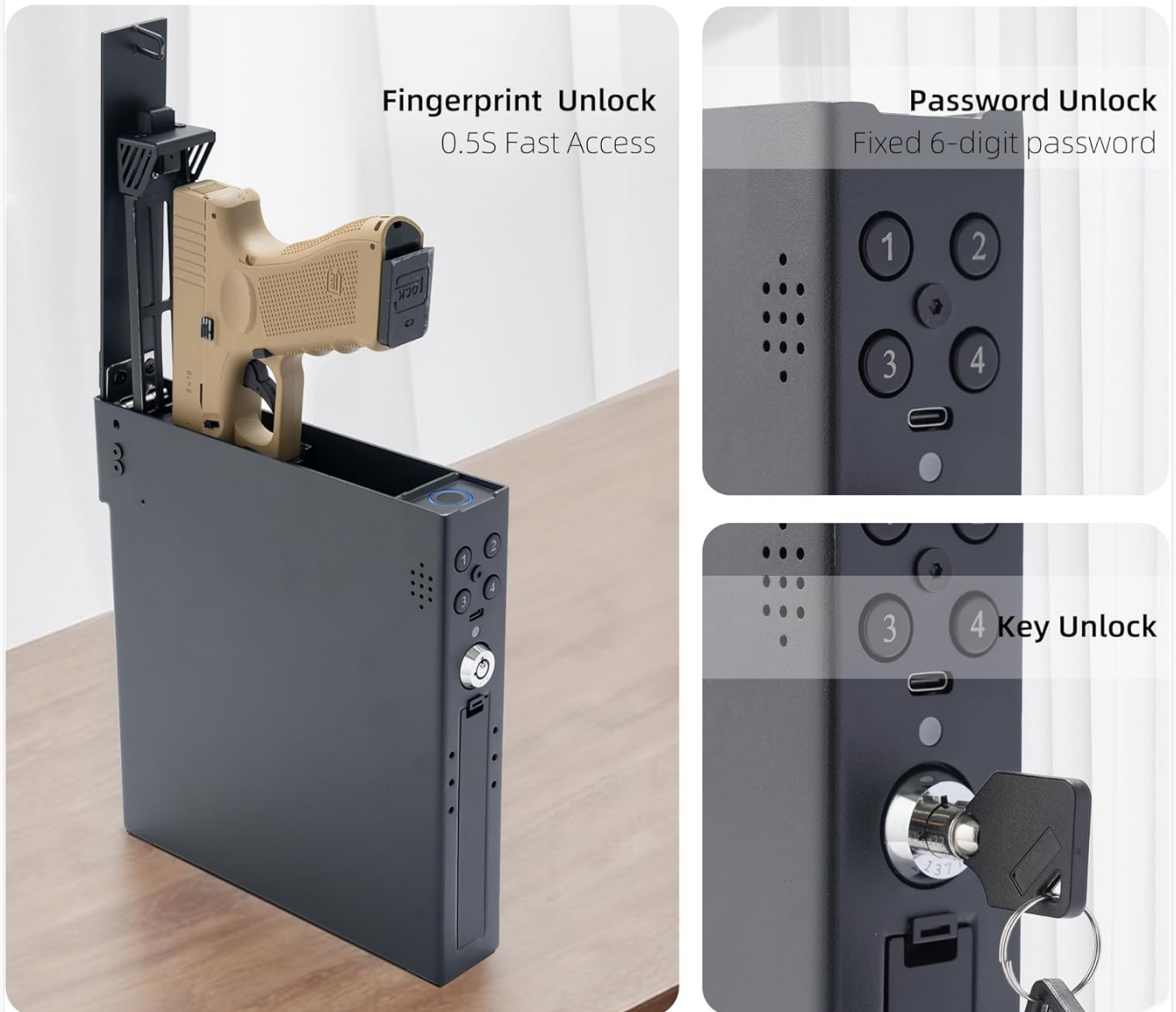
Figure 6: Three ways to quickly access the gun safe.