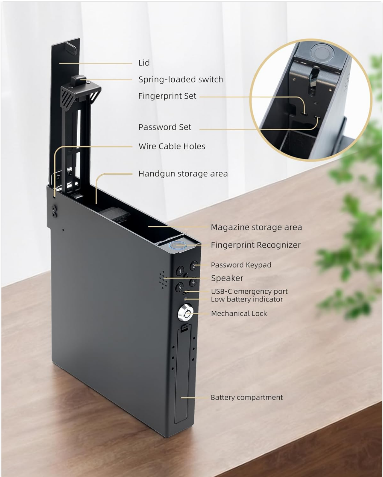
Figure 1: Labeled components of the EAMIRUO EA-70 Quick Access Car Gun Safe.