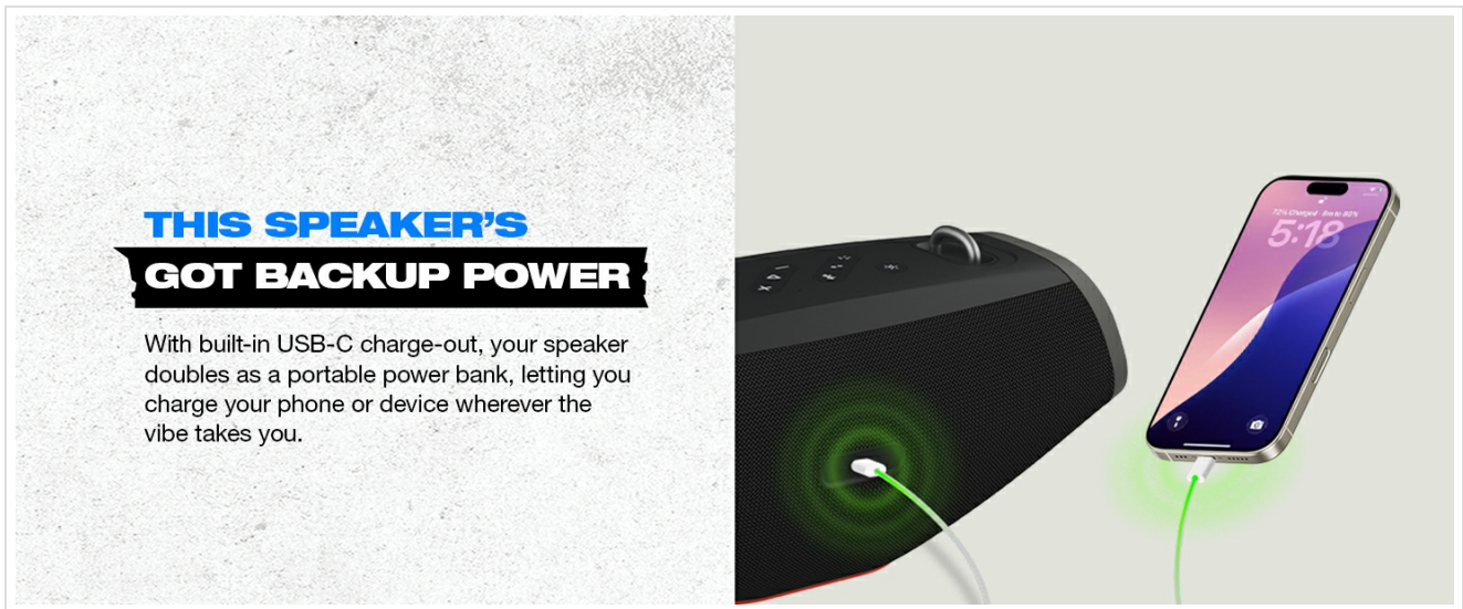
Image: The Skullcandy Barrel Mini speaker providing power to a smartphone through its USB-C charge-out port.