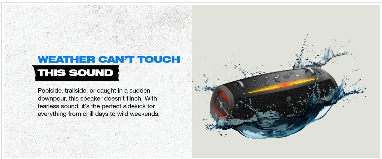
Image: The Skullcandy Barrel Mini speaker being splashed with water, illustrating its IPX7 waterproof capability.

The Barrel Mini is IPX7 waterproof, meaning it can be submerged in water up to 1 meter for 30 minutes. Ensure all port covers are securely closed before exposing the speaker to water.