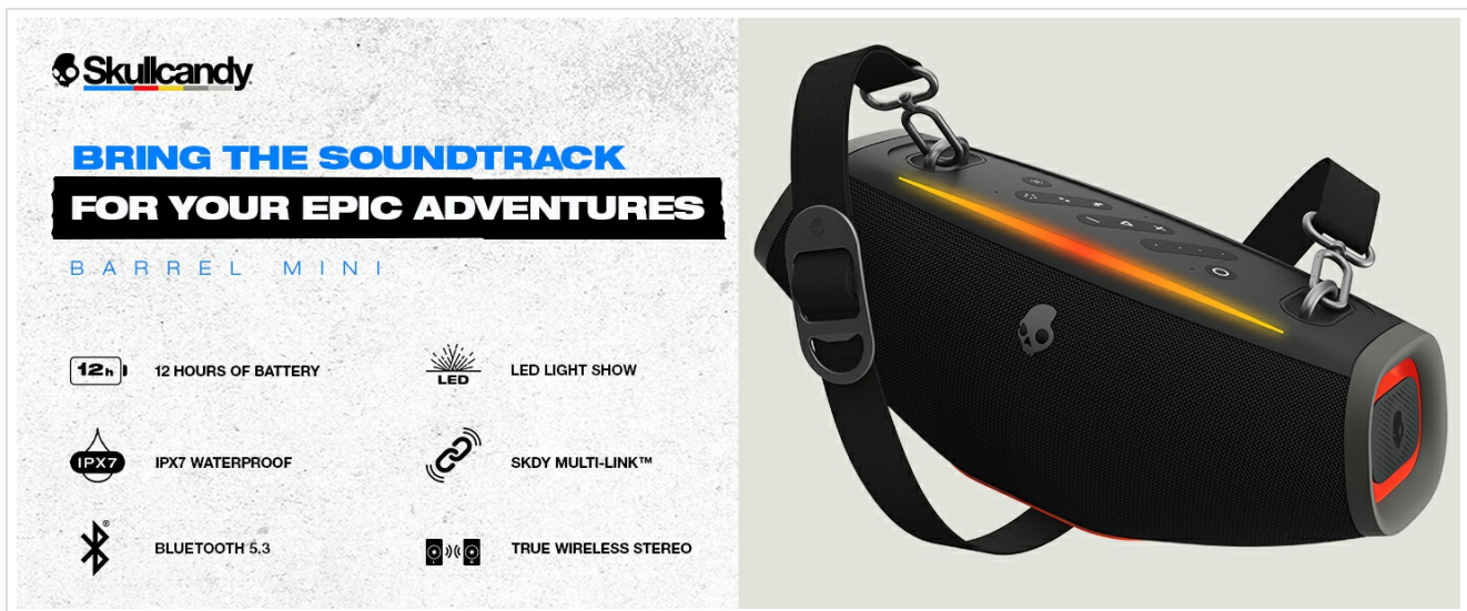
Image: An overview diagram highlighting the main features of the Barrel Mini speaker, including battery life, Bluetooth version, waterproofing, and LED lights.