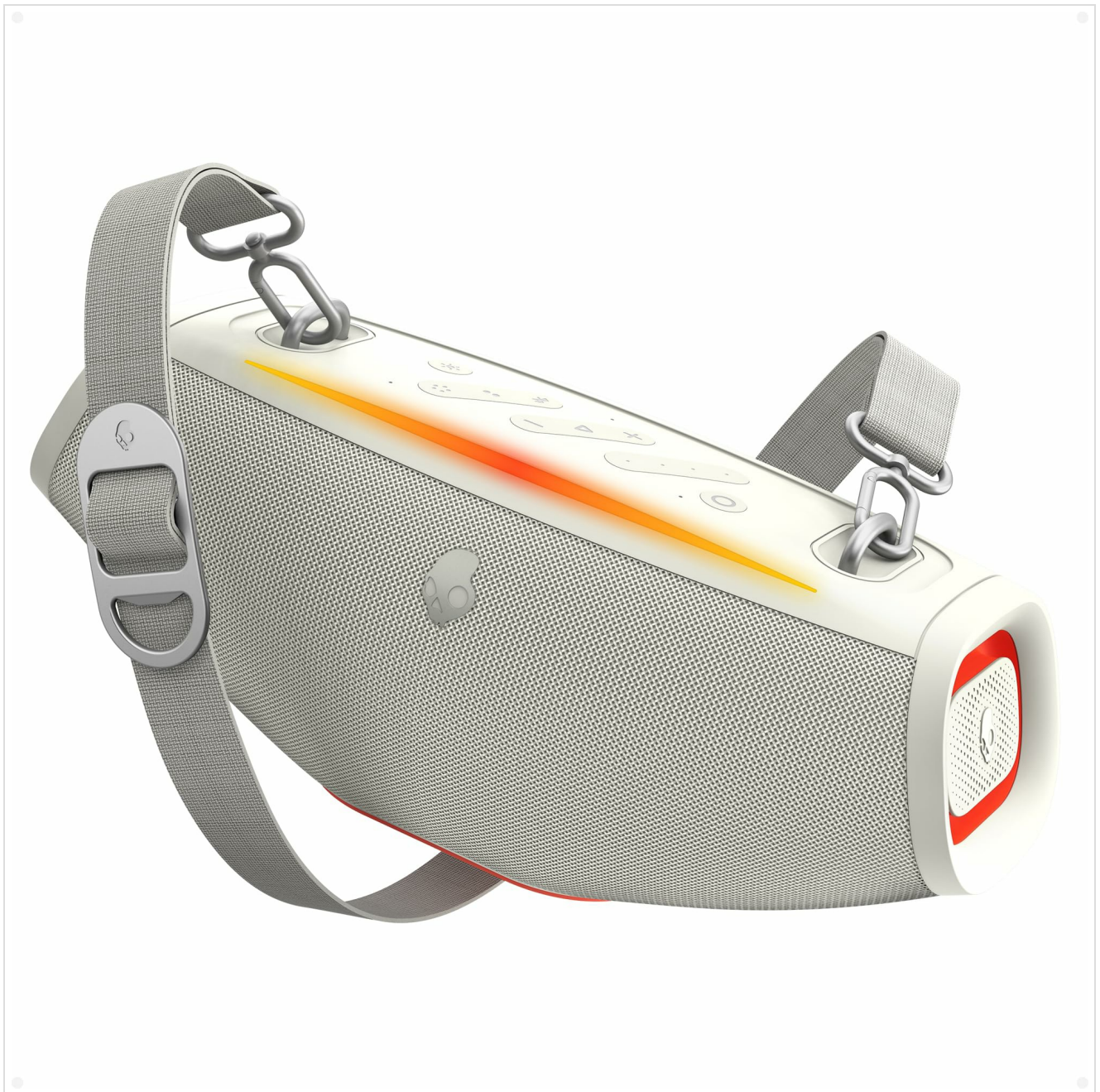
Image: The Skullcandy Barrel Mini Wireless Boombox Speaker, showcasing its compact design and control panel.