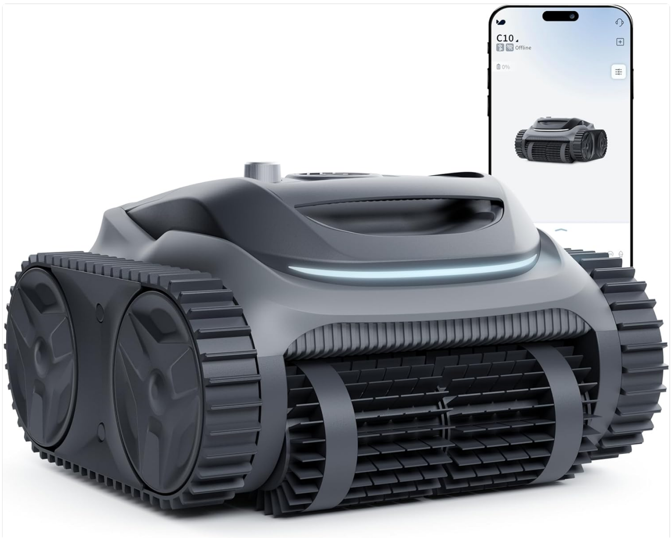
Figure 1: Bubot 700 Cordless Robotic Pool Cleaner and its accompanying mobile application interface.