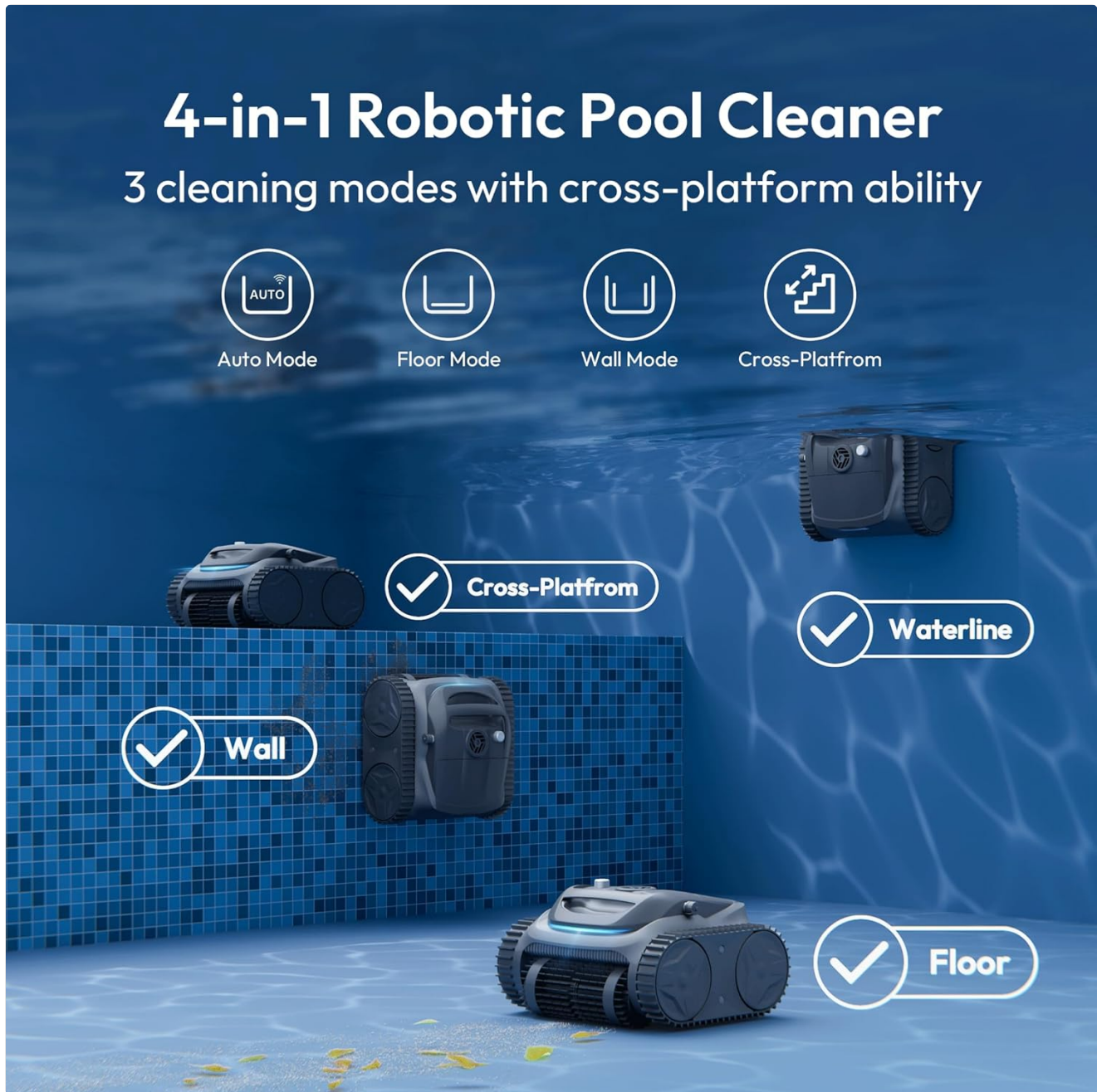
Figure 5: The Bubot 700 offers 4-in-1 cleaning capabilities, including Auto, Floor, Wall, and Waterline modes, ensuring comprehensive pool coverage.

The Bubot 700 offers multiple cleaning modes to suit your pool's needs. These can be selected via the BUBLUE App.