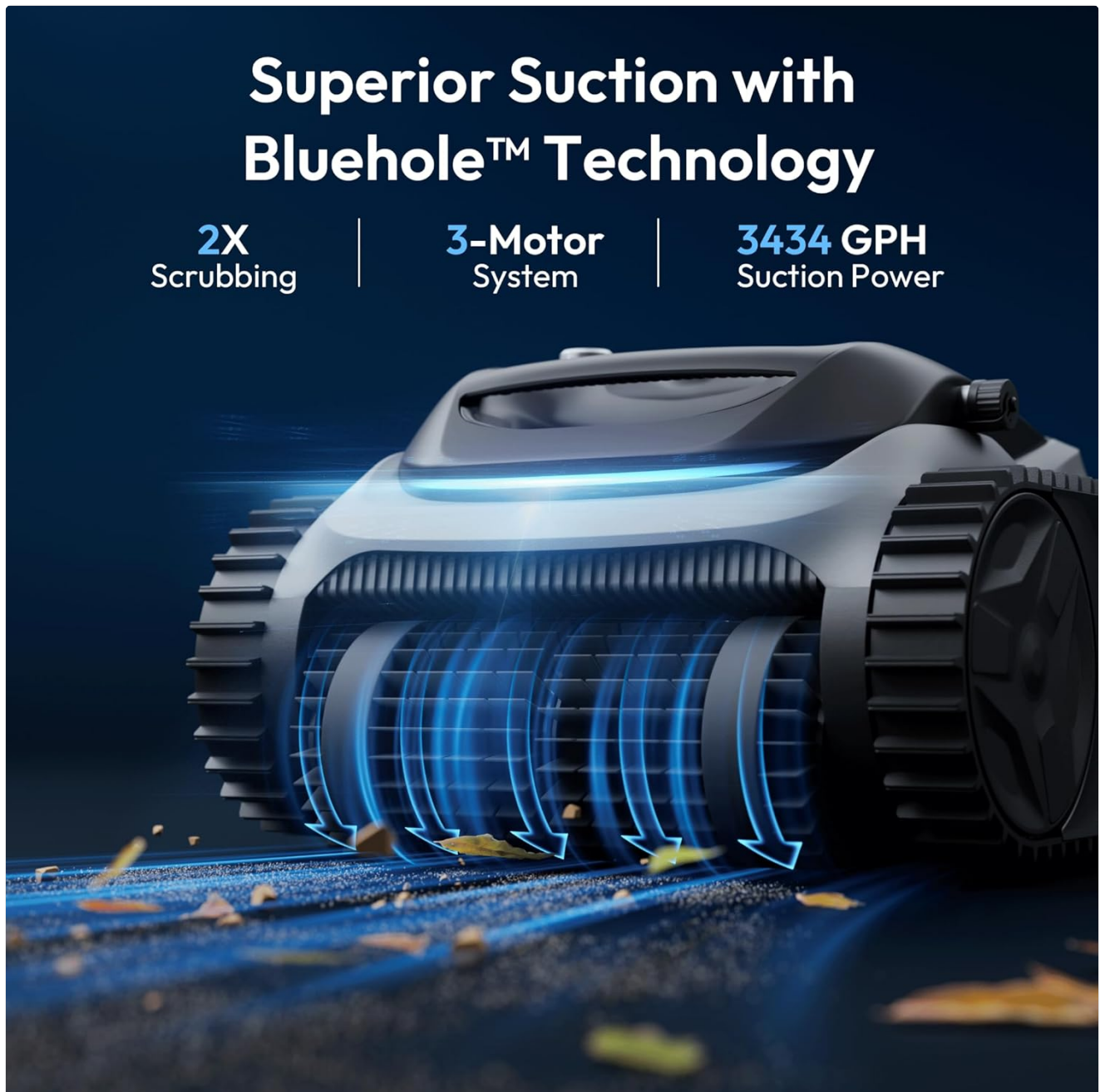
Figure 2: The Bubot 700 features a triple-motor system and Bluehole Technology for superior suction power, effectively removing debris from the pool floor.

Familiarize yourself with the main components of your Bubot 700 cleaner.