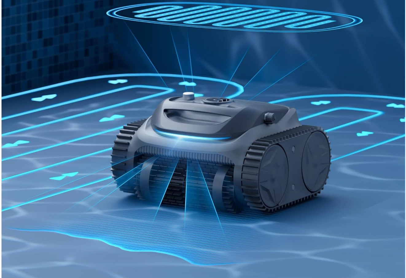
Figure 6: Bluesonic Path Technology enables the Bubot 700 to use advanced algorithms for efficient cleaning paths, including S-Shape, N-Shaped, and smart path width adjustment.

When the battery level is low, the cleaner will automatically navigate to the edge of the pool for easy retrieval.