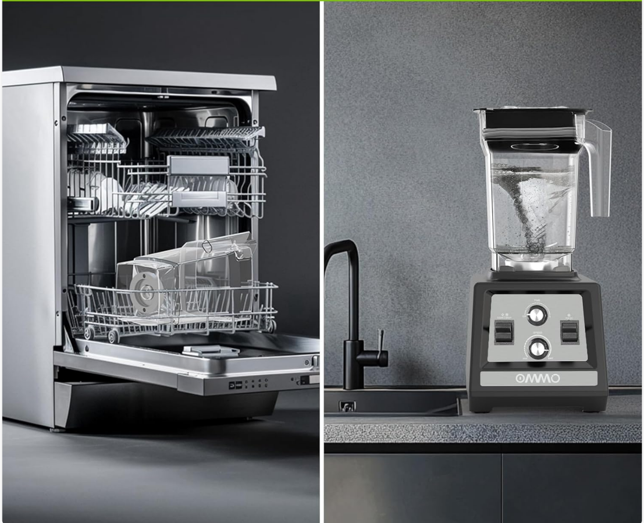
Image 7.1: The OMMO Blender pitcher shown inside a dishwasher on the left, and performing a self-cleaning cycle with water on the motor base on the right.