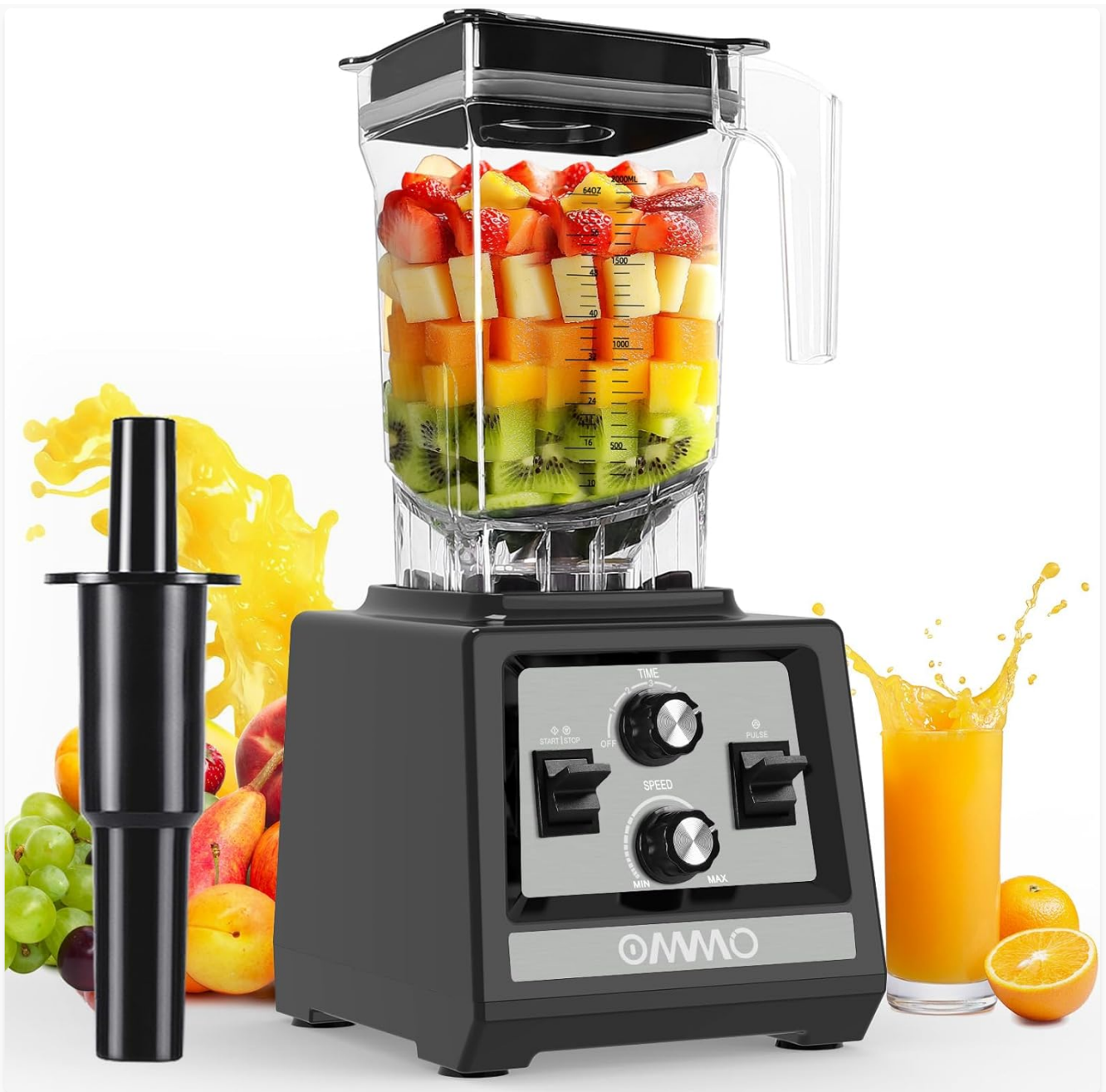
Image 1.1: The OMMO OM-200 High-Speed Blender with its pitcher filled with colorful fruits, alongside a glass of orange juice and a tamper.