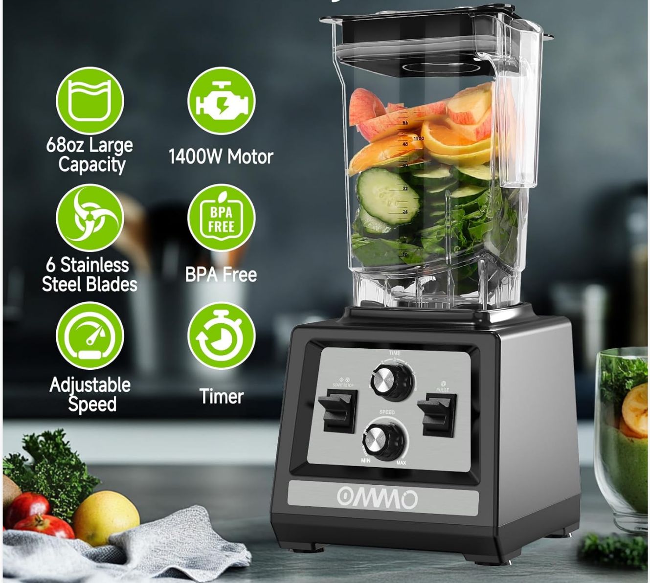
Image 4.1: An overview highlighting the key features of the OMMO Blender, including 68oz large capacity, 1400W motor, 6 stainless steel blades, BPA-free pitcher, adjustable speed, and timer function.