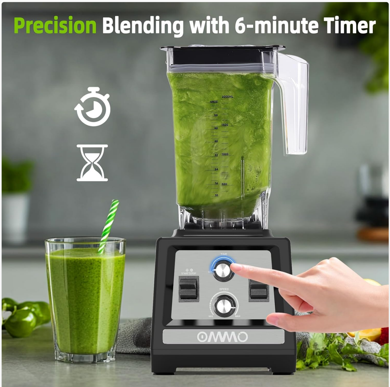
Image 6.1: A hand adjusting the timer knob on the OMMO Blender's control panel, with a green smoothie in the pitcher and a glass next to it.