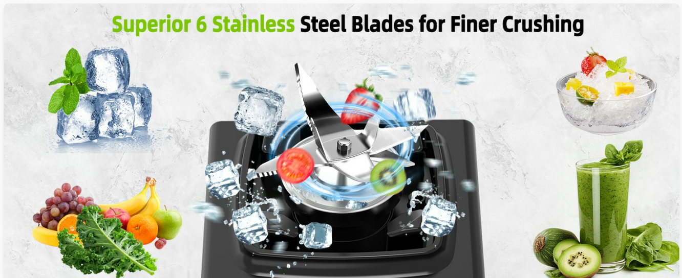
Image 6.2: A close-up view of the OMMO Blender's six stainless steel blades efficiently crushing ice, strawberries, and kiwi, demonstrating its powerful blending capability.