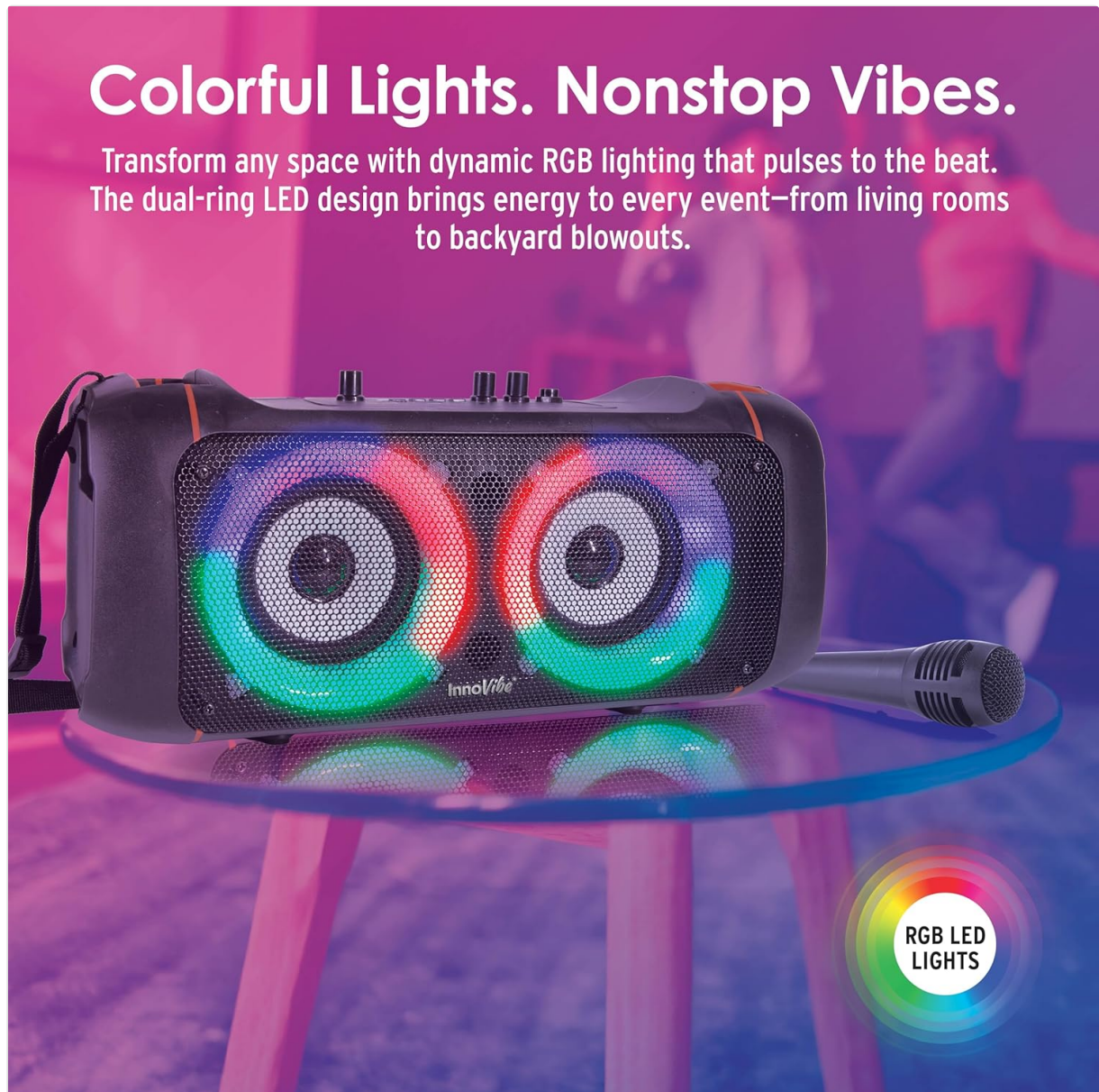
Image: The InnoVibe Party Speaker displaying its colorful RGB LED lights, positioned on a reflective surface to highlight the light effects.

The speaker features dynamic RGB LED lights. Specific controls for changing light modes or turning them off may vary. Refer to the control panel for a dedicated light button or a combination of buttons that might cycle through light patterns or disable them.