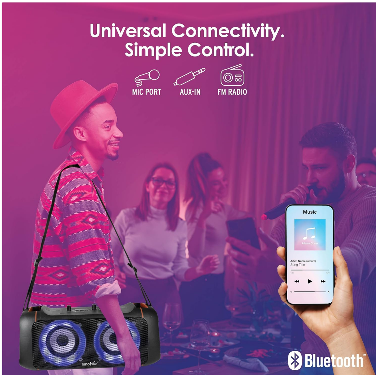
Image: A person holding a smartphone displaying a music player interface, with the InnoVibe Party Speaker visible in the foreground, illustrating Bluetooth connectivity.