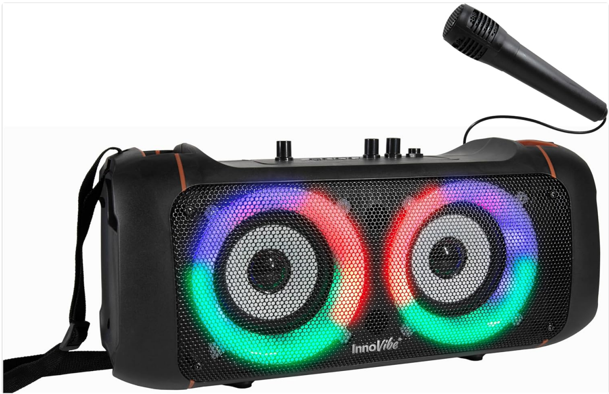
Image: A front view of the InnoVibe Party Speaker, showcasing its dual speaker grilles with active colorful LED lights and the connected wired microphone.