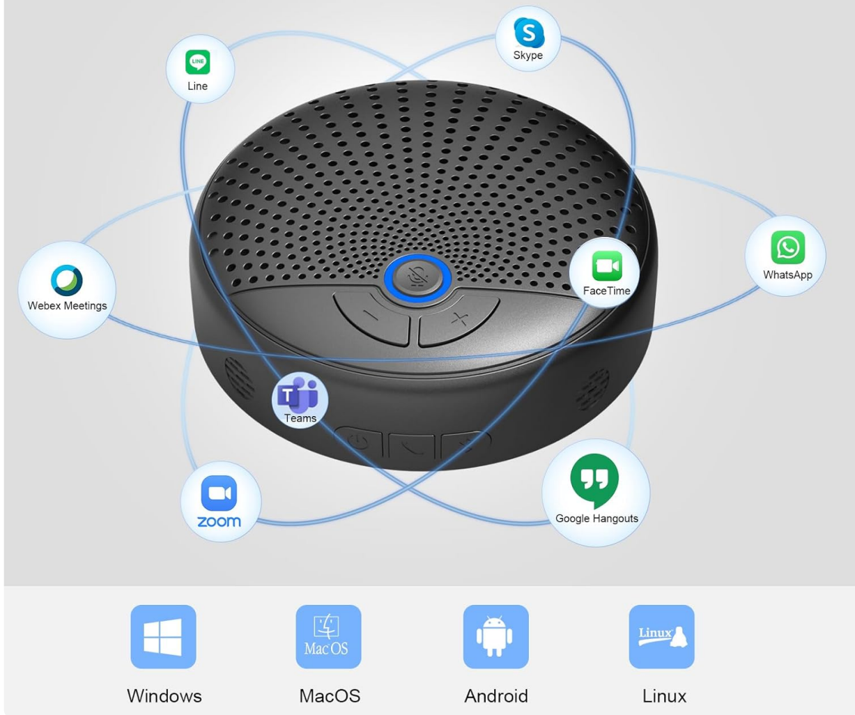
Figure 5: Illustrates the universal compatibility of the BALILA CM900 with various operating systems and conferencing applications.