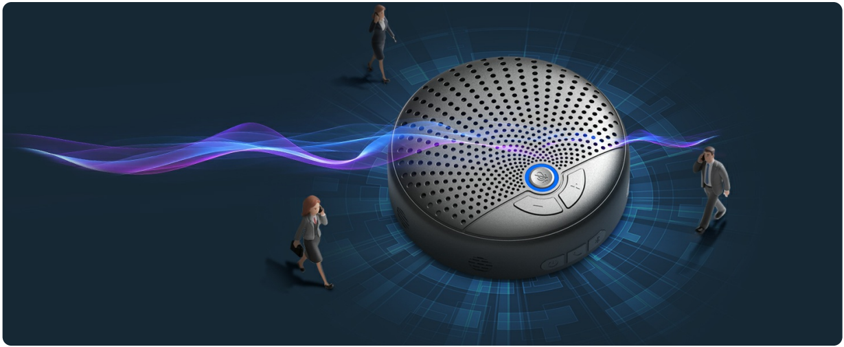
Figure 6: Depicts the 360-degree voice pickup capability of the BALILA CM900 speakerphone in a meeting environment.