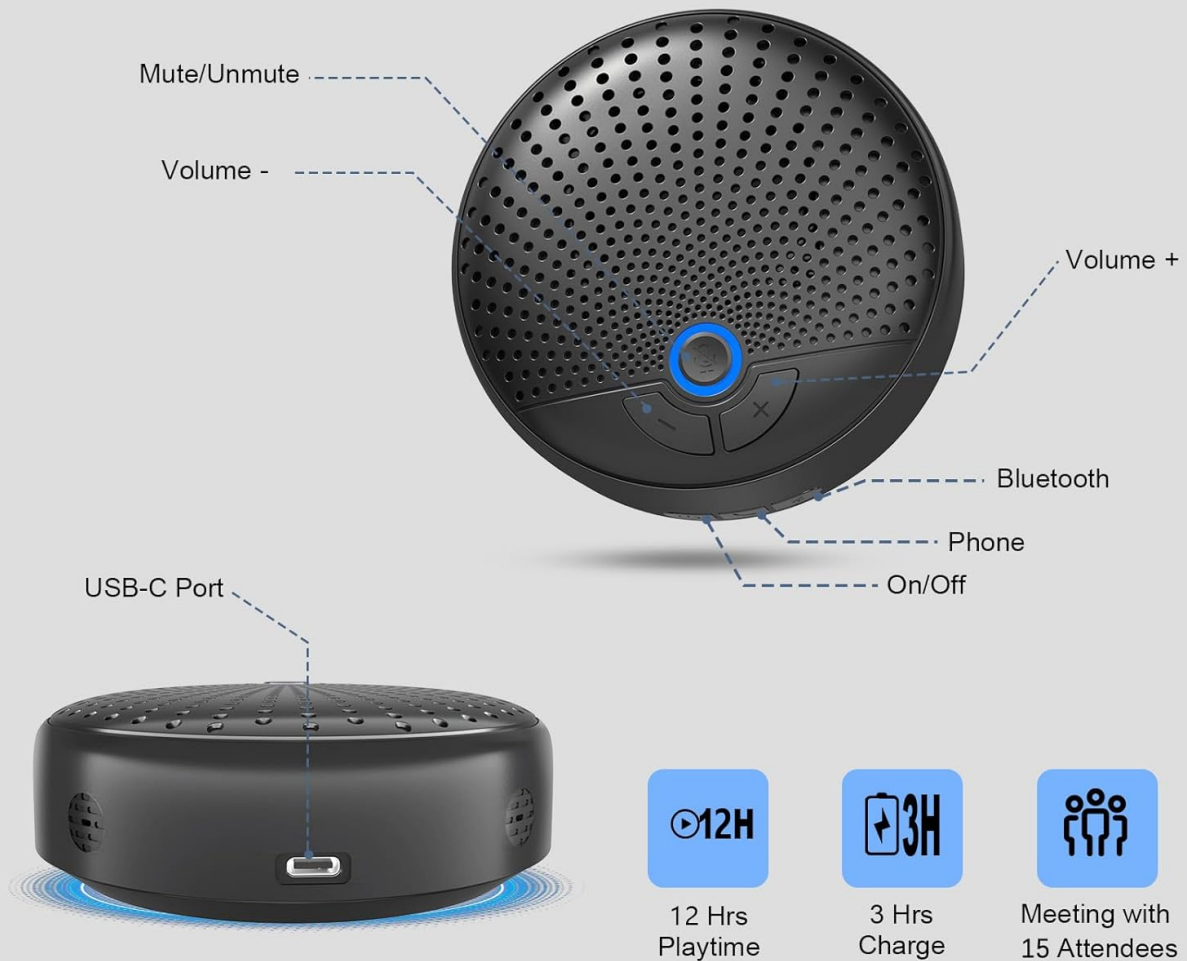
Figure 2: Diagram illustrating the user-friendly controls and ports of the BALILA CM900 speakerphone.