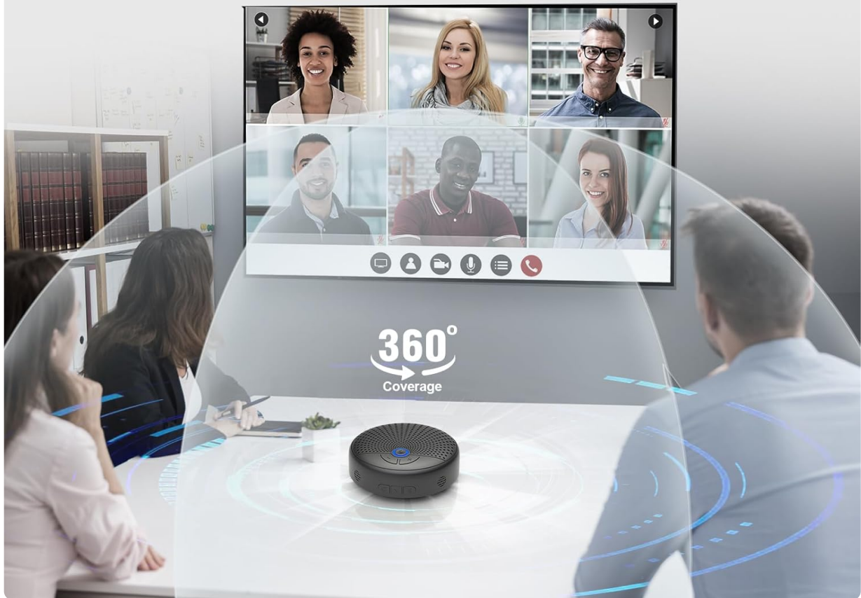
Figure 1: BALILA CM900 Conference Speakerphone

Pick up Voice up to 20ft with our advanced audio tech