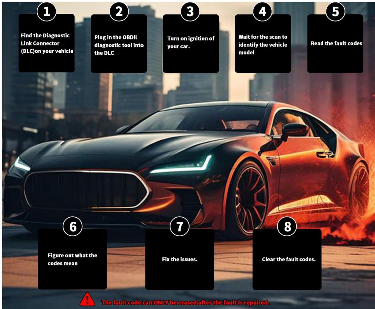
Image: An 8-step visual guide demonstrating the process of using the V350 scanner, from finding the DLC to clearing fault codes.