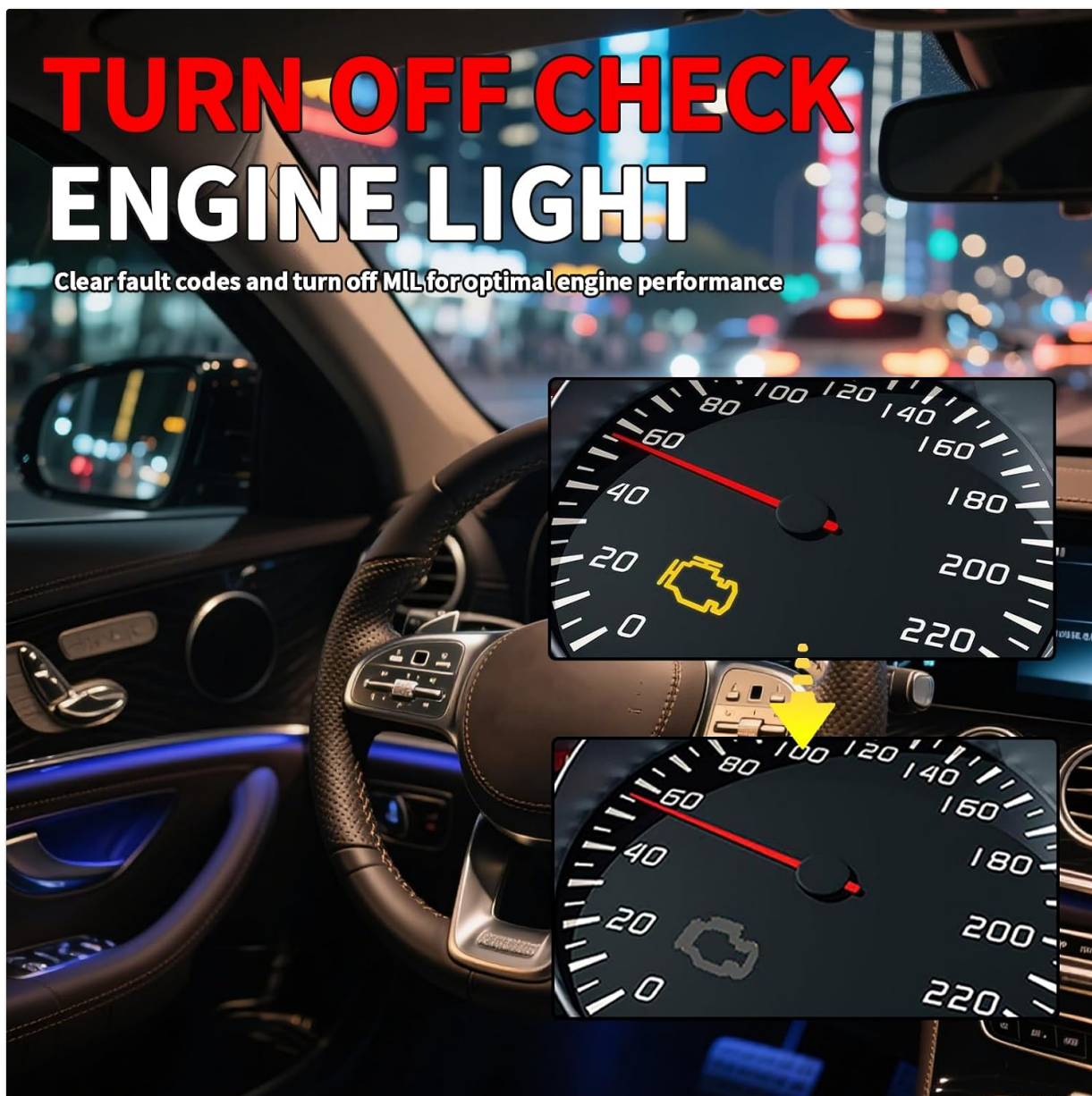
Image: A vehicle dashboard illustrating the Check Engine Light (MIL) illuminated before clearing codes, and then off after successful code erasure.

Clearing DTCs will turn off the Check Engine Light (MIL) and erase all diagnostic data. Ensure the underlying issue is resolved before clearing codes.