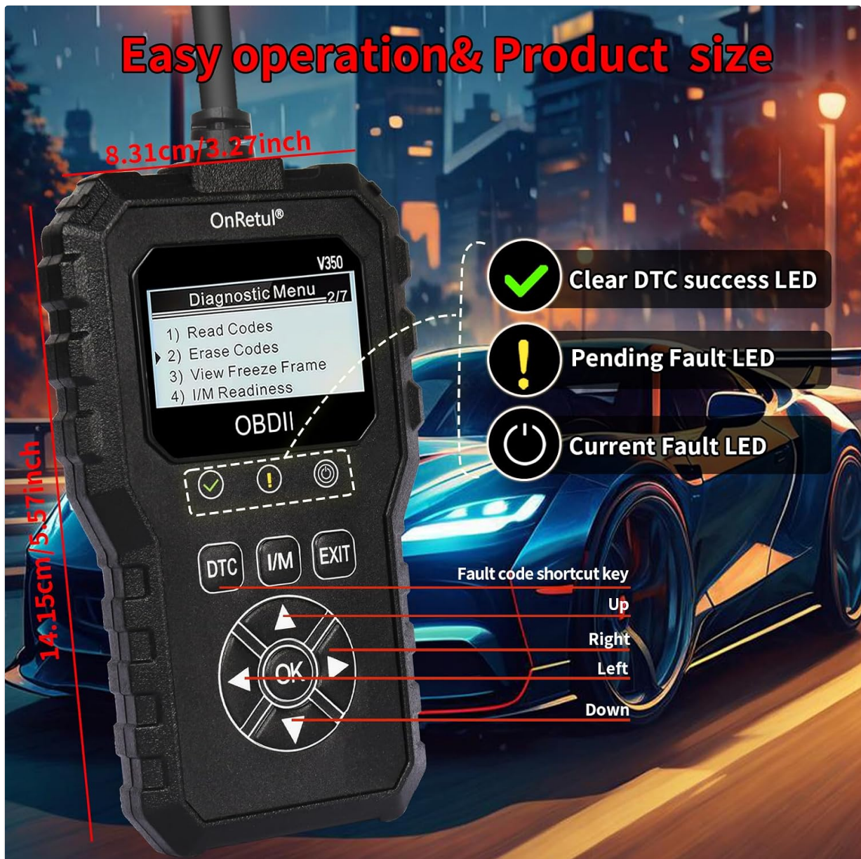
Image: The OnRetul V350 device highlighting its display, navigation buttons (OK, Up, Down, Left, Right), function buttons (DTC, I/M, EXIT), and LED indicators for Clear DTC success, Pending Fault, and Current Fault.