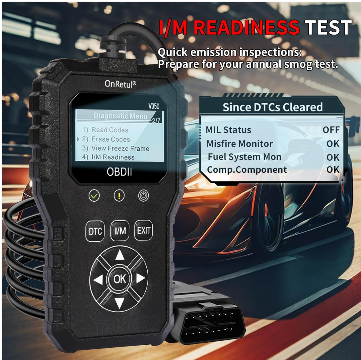
Image: The V350 scanner displaying the I/M Readiness Test results, showing the status of various monitors like MIL, Misfire Monitor, Fuel System Monitor, and Component Monitor.

This function checks the status of the emission-related monitoring systems to determine if they are ready for an emissions test.