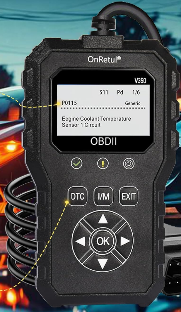
Image: The V350 scanner displaying the definition for DTC P0115, which indicates an 'Engine Coolant Temperature Sensor 1 Circuit' issue, along with a list of code categories.