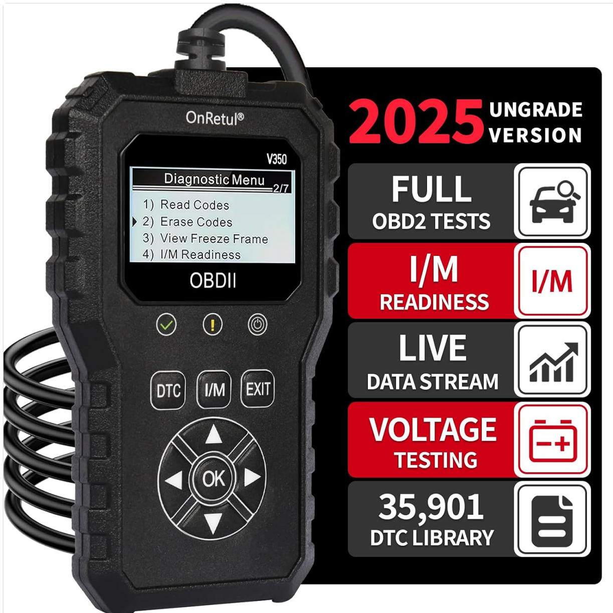
Image: The OnRetul V350 diagnostic tool displaying its main menu and key features like full OBD2 tests, I/M readiness, live data stream, voltage testing, and a large DTC library.