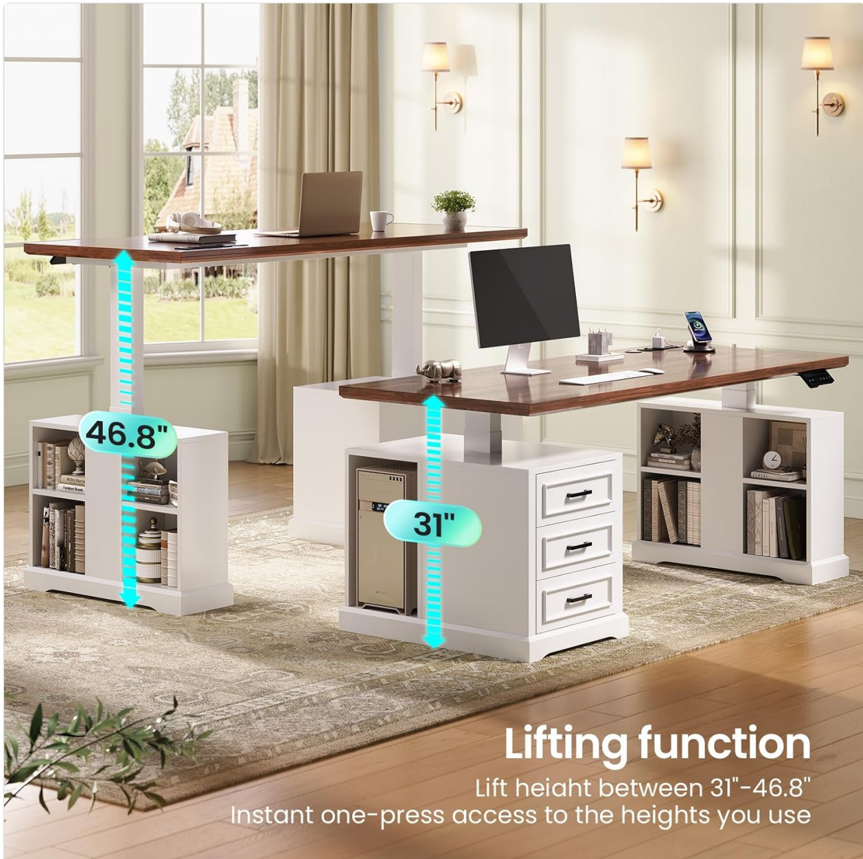
Figure 3.1: Visual representation of the desk's adjustable height range, illustrating the smooth transition between sitting and standing positions.