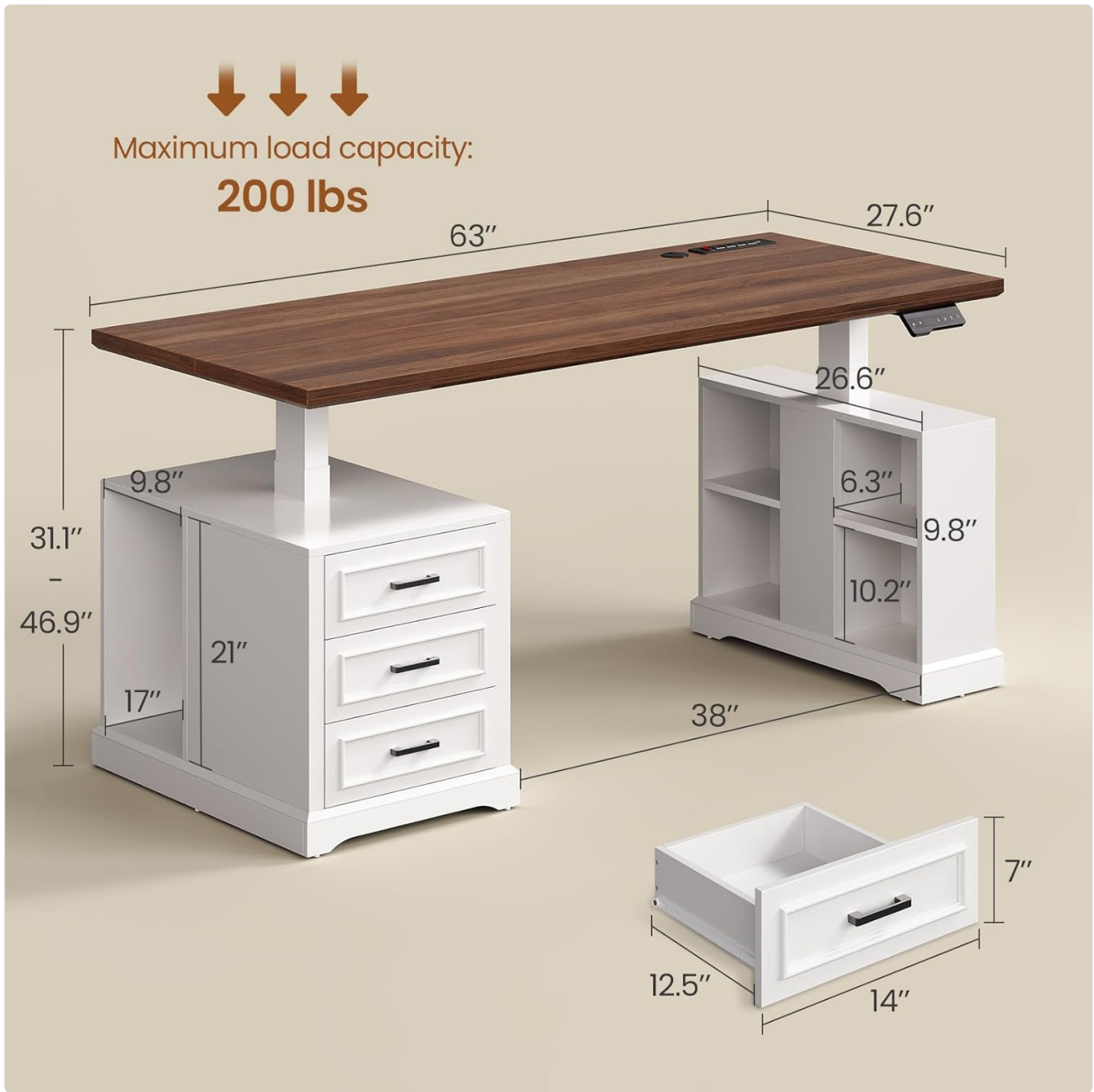
Figure 2.1: Desk dimensions and maximum load capacity (200 lbs). This image helps in understanding the scale and structural integrity.