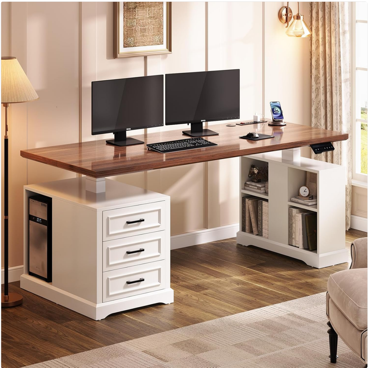
Figure 1.1: Overview of the SEDETA Farmhouse Electric Standing Desk, showcasing its spacious design and integrated storage solutions.