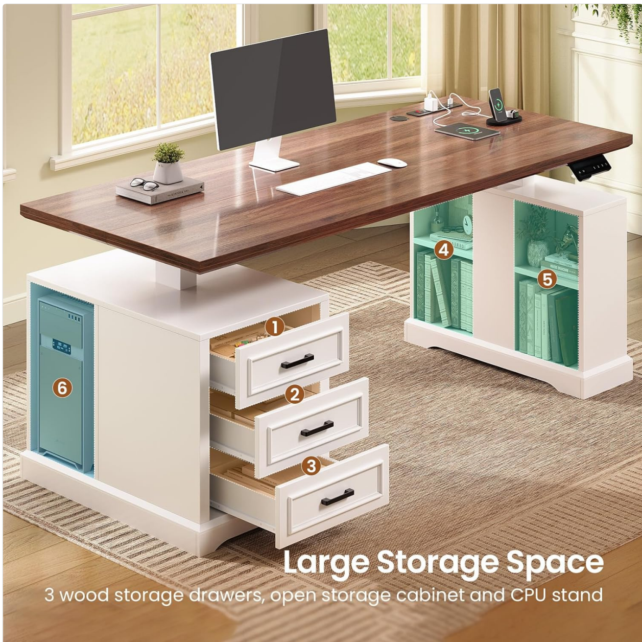
Figure 2.2: Breakdown of the large storage space, highlighting the three wood drawers, open storage cabinet, and dedicated CPU stand.