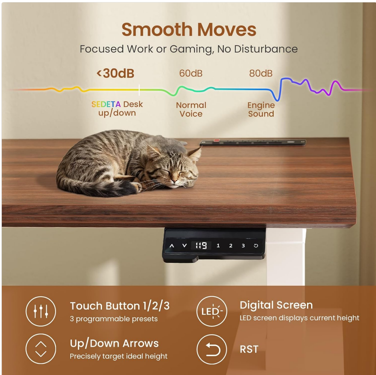
Figure 3.2: The control panel for height adjustment, featuring programmable presets and an LED display. The graphic also indicates the quiet operation of the lifting mechanism (below 30dB).