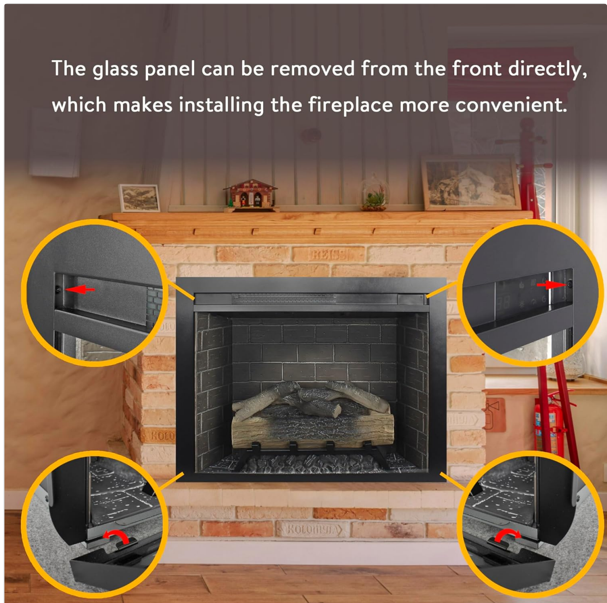
Figure 4.1: Illustration of the removable glass panel for simplified installation.

For easier installation, the glass panel can be removed directly from the front of the unit. This simplifies the process and reduces potential obstacles.