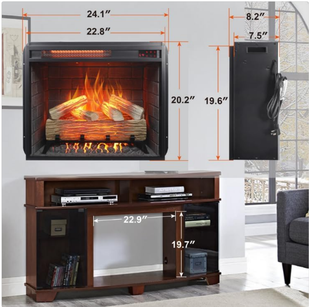
Figure 4.2: Product dimensions and suggested installation clearances.