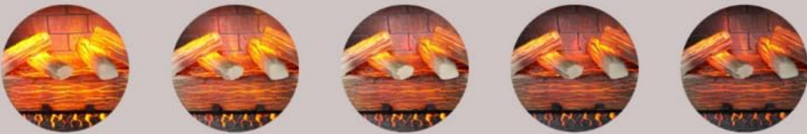
Figure 5.2: Examples of adjustable flame colors and brightness.