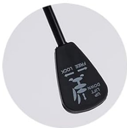
Seat Height Adjustment Handle