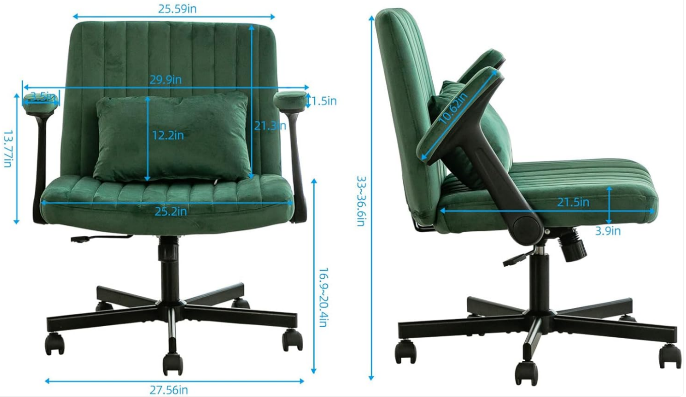
Figure 6: Chair Dimensions and Weight Capacity