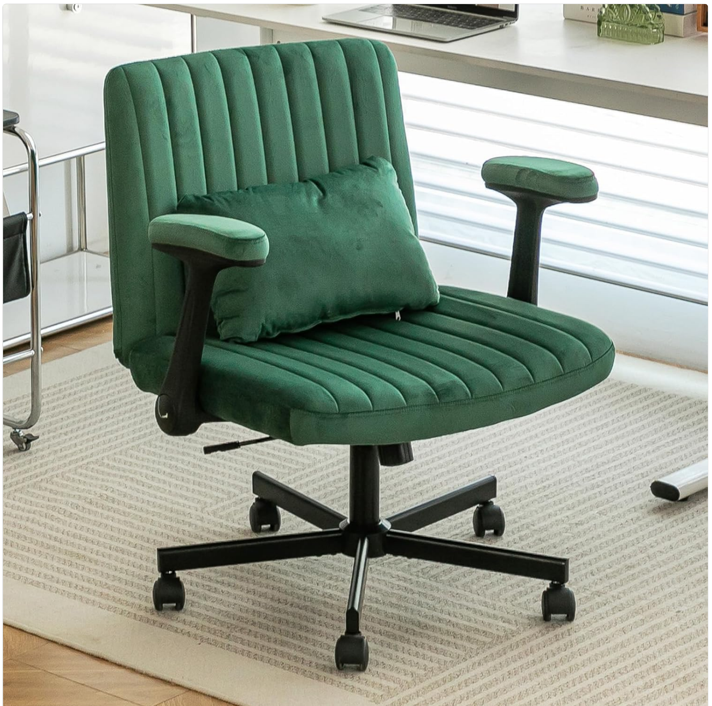
Figure 1: anwickjeff Criss Cross Legged Office Chair (Green)