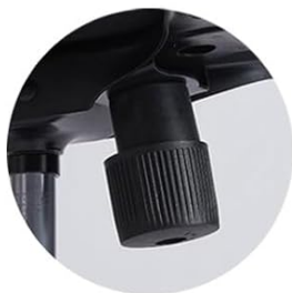
Chair Back Angle Adjustment Button