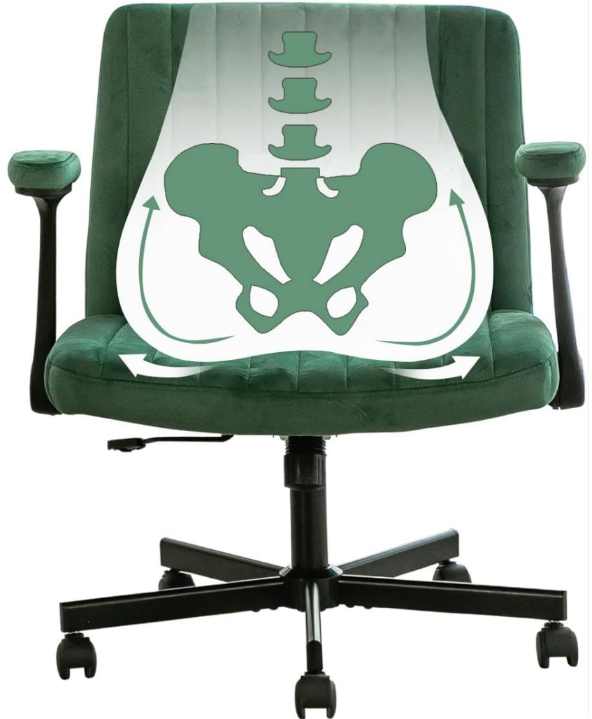
Figure 5: Ergonomic Design and Adjustable Handrail