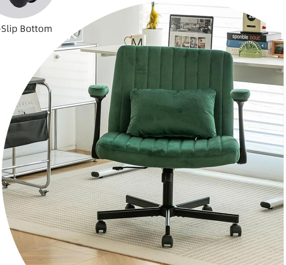
Figure 2: Key Components of the Chair