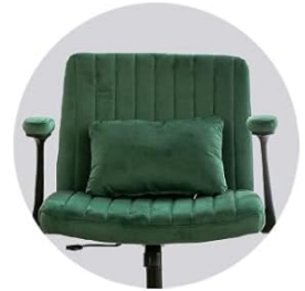
Eco-friendly doll cotton is fuller and fluffier