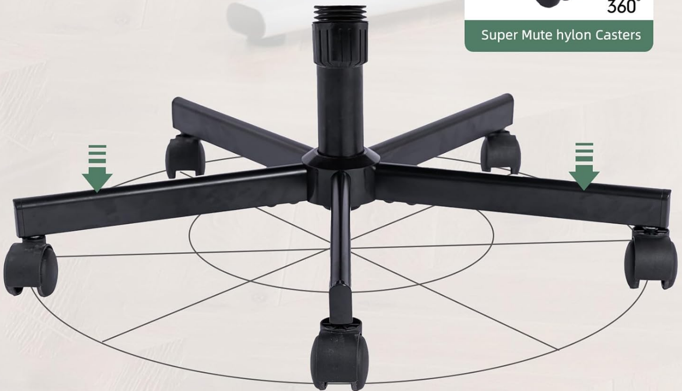
Figure 3: Chair Base and Casters