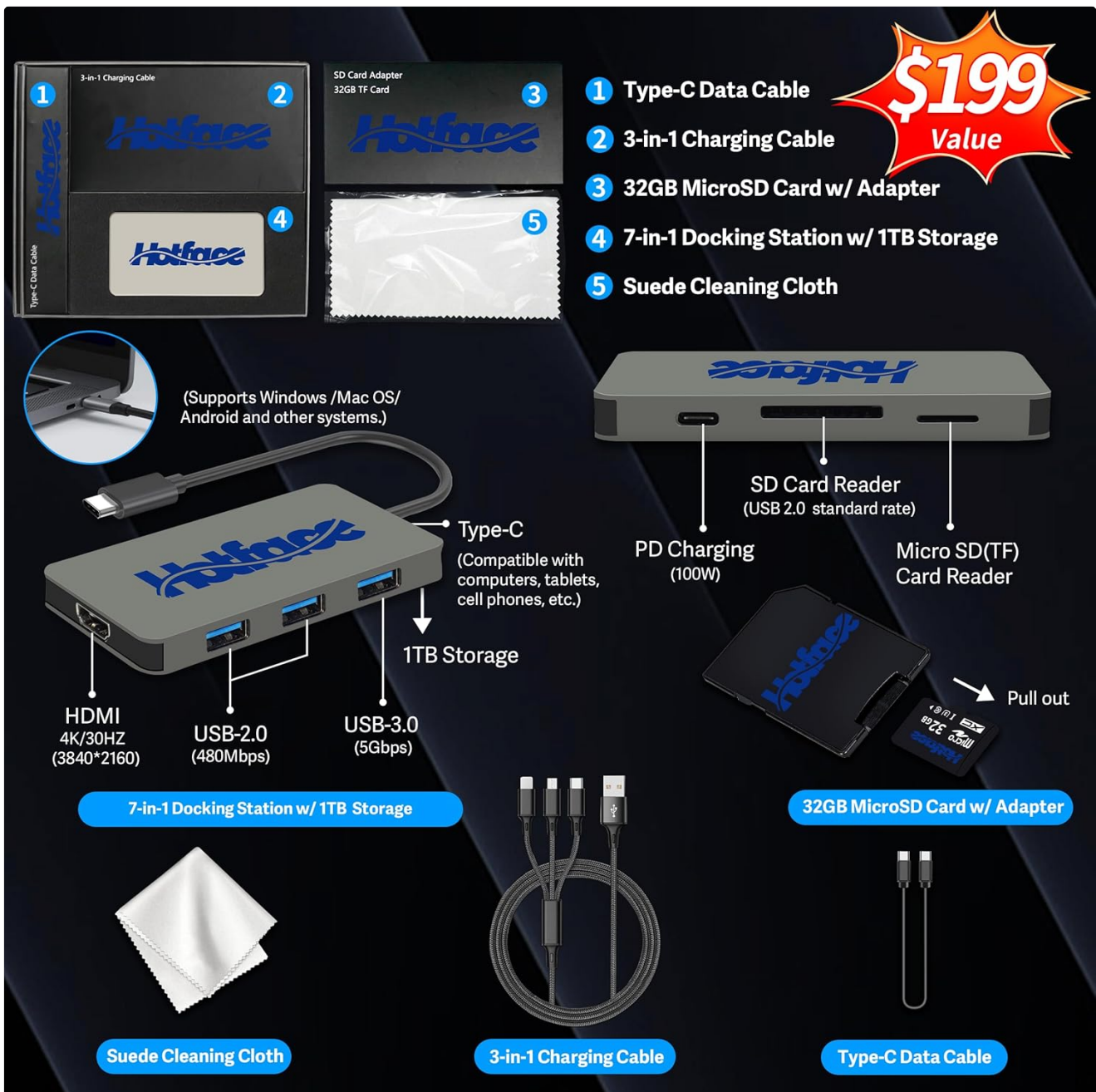
Figure 1.1: Included Accessories. This image displays the 7-in-1 Docking Station with 1TB Storage, a 32GB MicroSD Card with adapter, a Type-C Data Cable, a 3-in-1 Charging Cable, and a Suede Cleaning Cloth. These items are designed to enhance the laptop's functionality and connectivity.