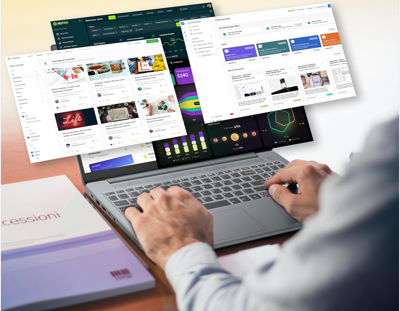
Figure 2.6: Effortless Multitasking. This image depicts the laptop being used with multiple applications open simultaneously, illustrating its capability for efficient multitasking.

Seamlessly navigate through multiple tabs and applications with ease. best companion for your efficient lifestyle.