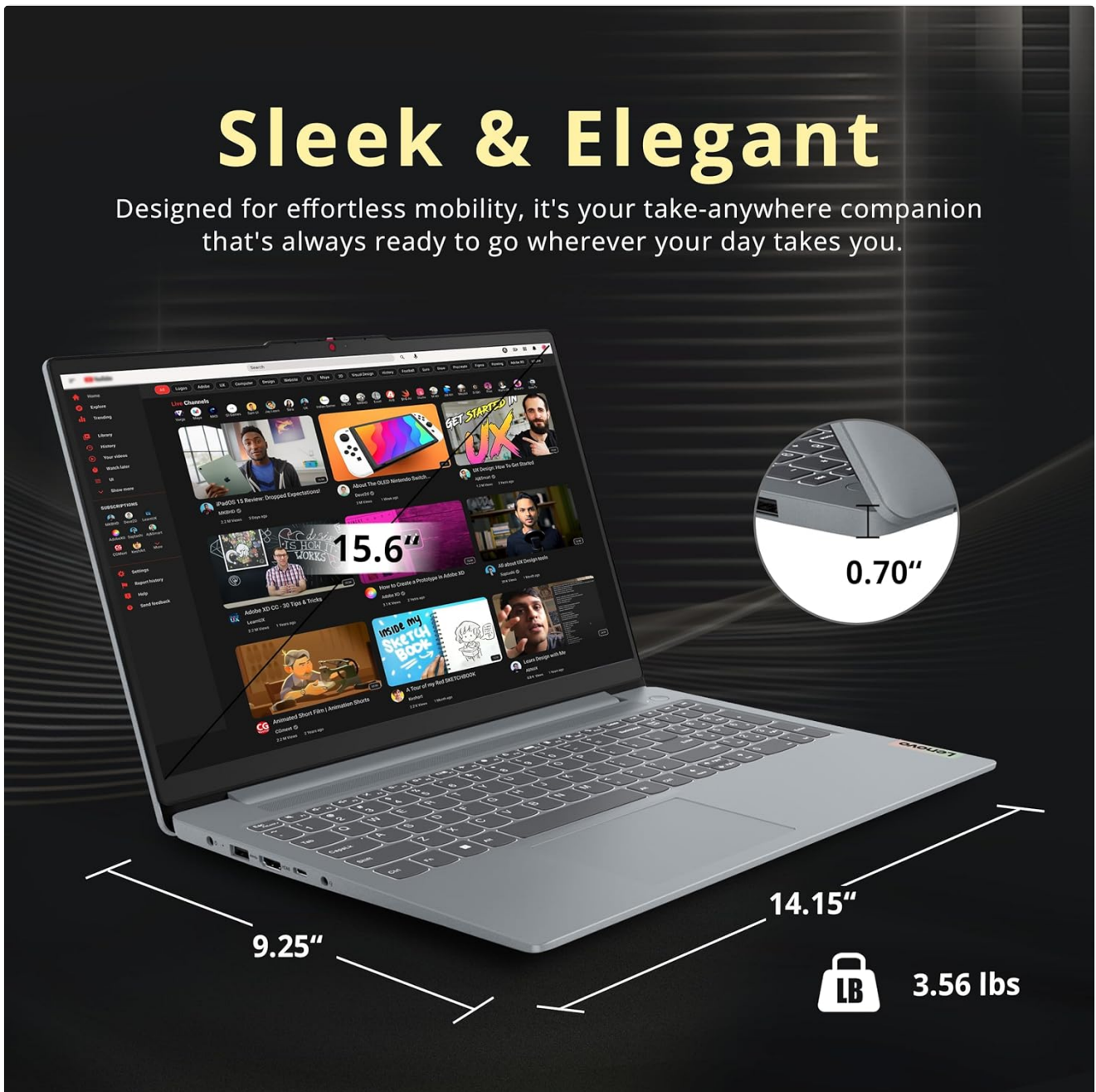
Figure 5.1: Dimensions and Weight. This image provides a visual representation of the laptop's physical dimensions and its weight, highlighting its sleek and portable design.

Designed for effortless mobility, it's your take-anywhere companion that's always ready to go wherever your day takes you.