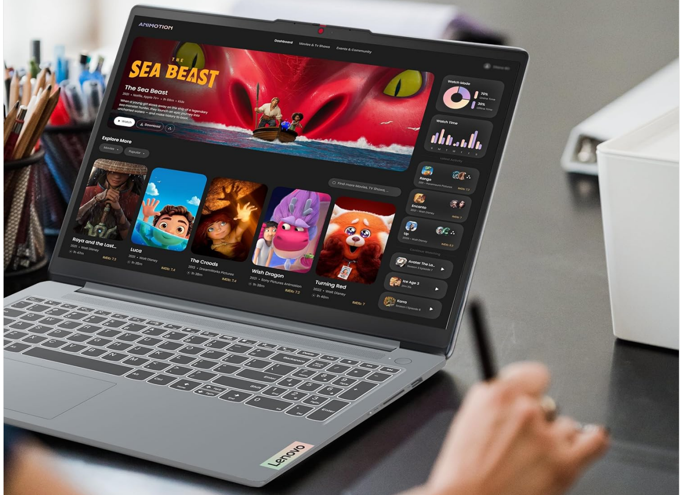
Figure 2.7: Comfortable Entertainment. This image shows the laptop being used for media consumption, highlighting its suitability for entertainment purposes.

Enjoy your favorite shows from your favorite spot.