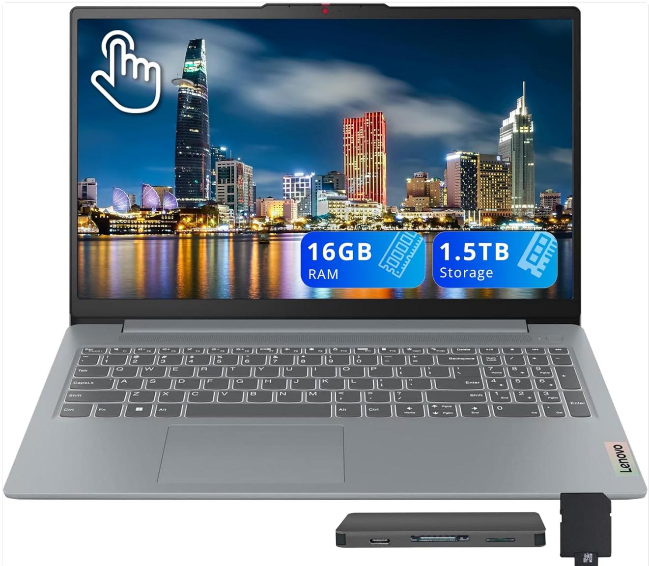
Figure 2.2: Performance Overview. This image shows the laptop with visual cues indicating 16GB RAM and 1.5TB storage, highlighting its capacity for demanding tasks and data storage.

Powered by an AMD Ryzen 7 5825U processor, the laptop is designed for efficient multitasking and productivity. It includes 16GB of DDR4 RAM for smooth application performance.