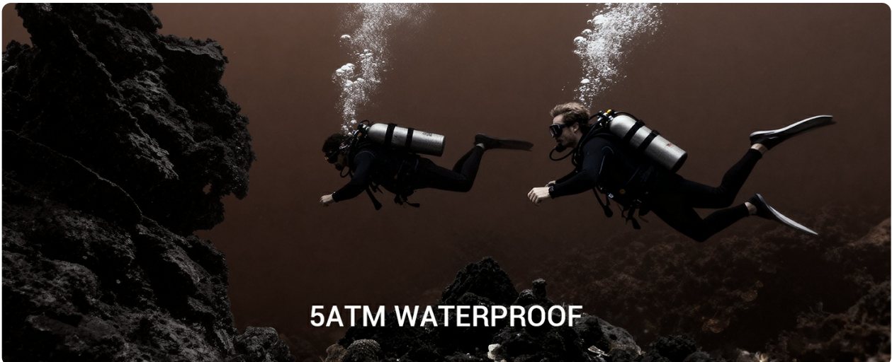
Image Description: The SOUYIE KW350C Smart Watch being worn by divers underwater, demonstrating its 5ATM waterproof capability.

The KW350C is 5ATM certified (water resistant up to 50 meters), making it suitable for swimming and other water activities. It includes a sonic drainage function to ensure a dry interior after exposure to water.