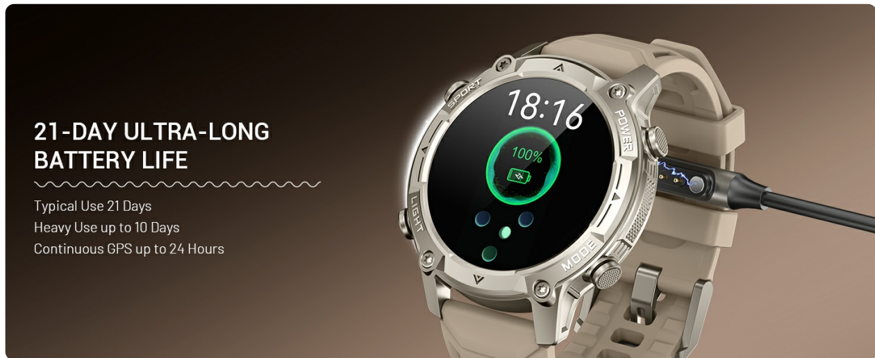
Image Description: The SOUYIE KW350C Smart Watch connected to its magnetic charging cable, illustrating its long battery life and charging capability.

Before initial use, fully charge your SOUYIE KW350C Smart Watch. Connect the magnetic charging cable to the charging contacts on the back of the watch and to a USB power source. A full charge typically takes 2 hours. 30 minutes of charging can provide up to 60 hours of battery life.