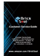
Instructions for Use