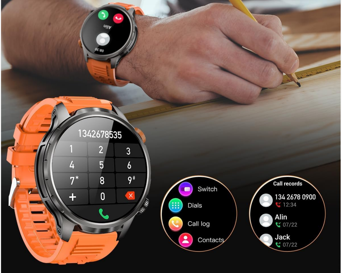
Image: The BANLVS AK90 Smart Watch screen showing a dial pad and call records, illustrating its Bluetooth calling capability.