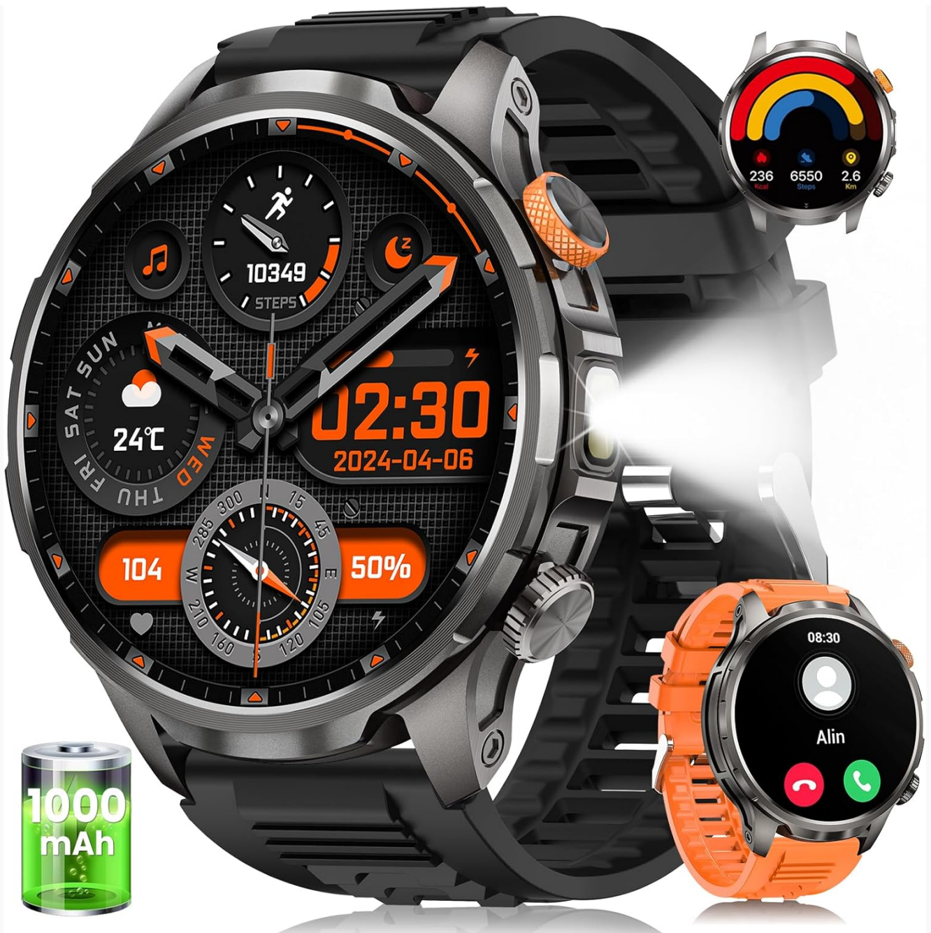
Image: The BANLVS AK90 Smart Watch, showing the main watch unit, charging cable, user manual, and an additional orange watch band.