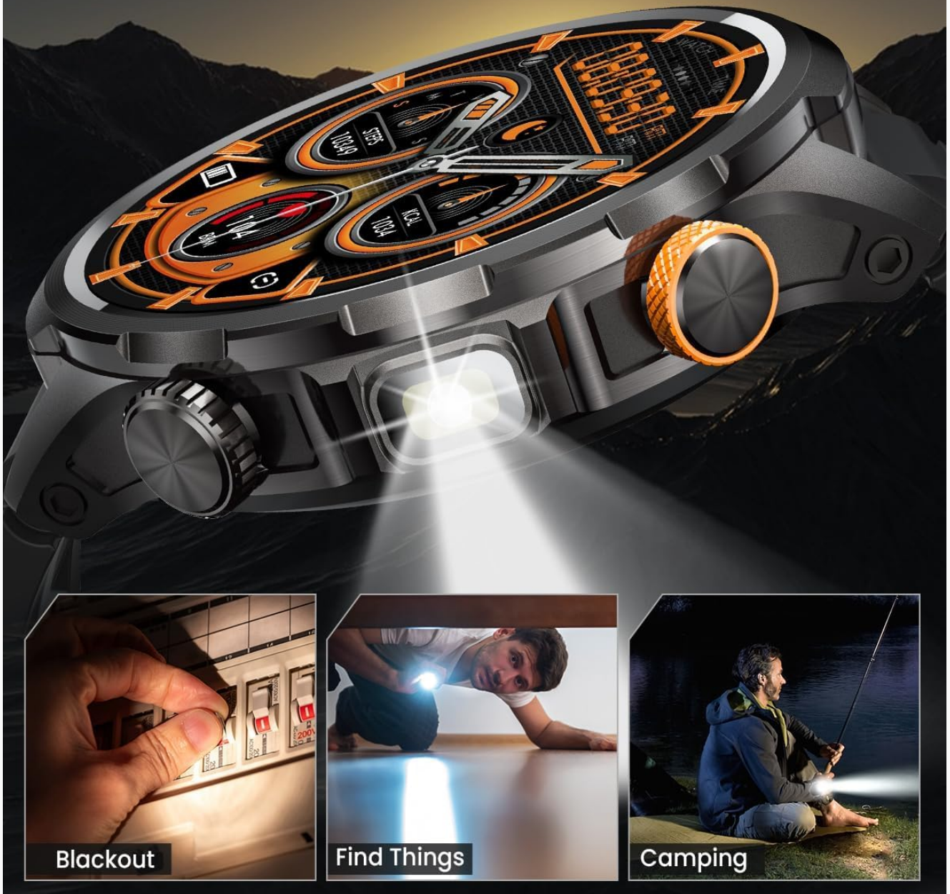
Image: The BANLVS AK90 Smart Watch with its powerful LED flashlight illuminated, demonstrating its utility in various low-light scenarios.

Whether outdoor camping or indoor blackout, it can help you illuminate every corner.