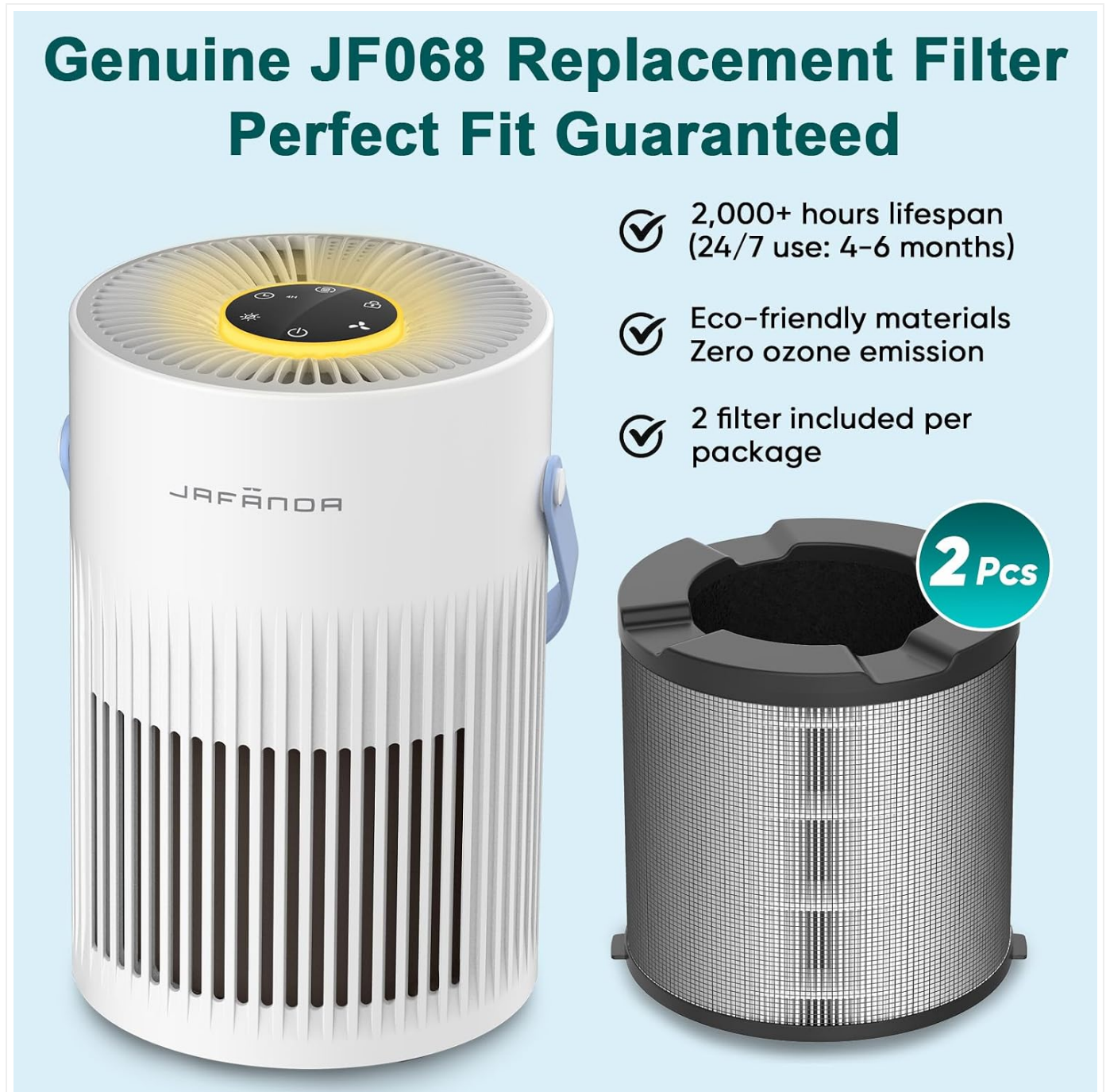
Figure 3: Jafānda JF068 Air Purifier with Replacement Filter.