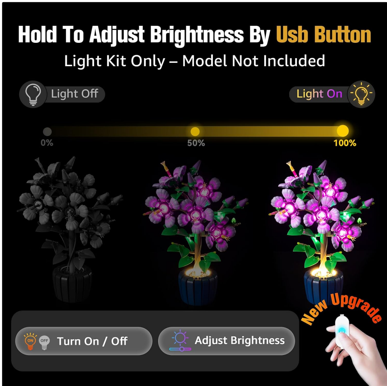
Image 5.1: Illustration of the one-touch dimming switch for brightness control.