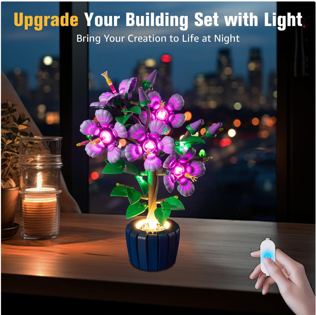
Image 5.2: The Lego Hibiscus Flower Décor Building Set illuminated by the BrickSoul light kit.