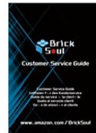
Instructions for Use