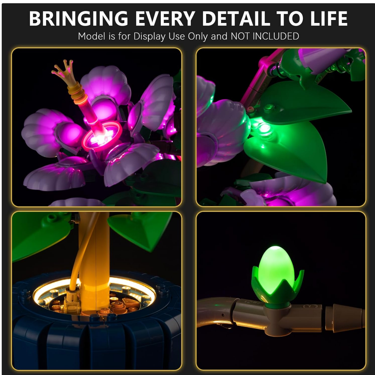
Image 4.1: Detailed view of integrated lighting on the Lego Hibiscus flower.