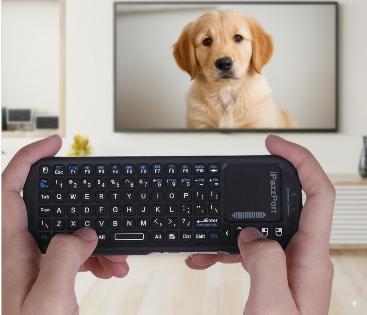
Image: Demonstrating the highly responsive touchpad and mouse buttons.