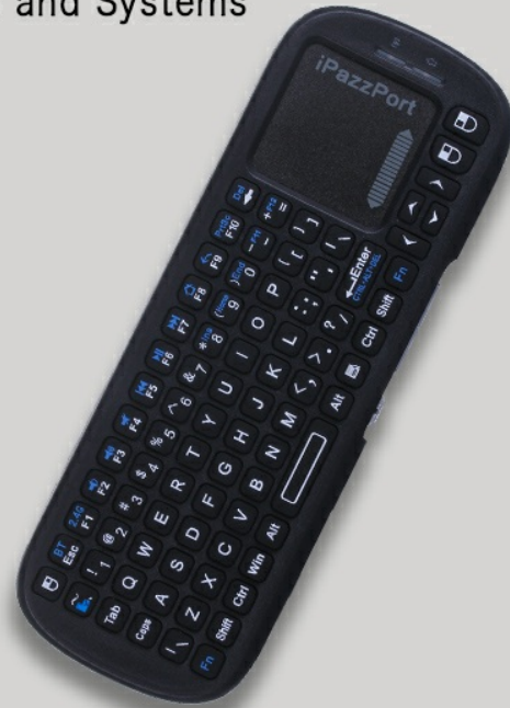
Image: Visual representation of the keyboard's wide compatibility with different device types.