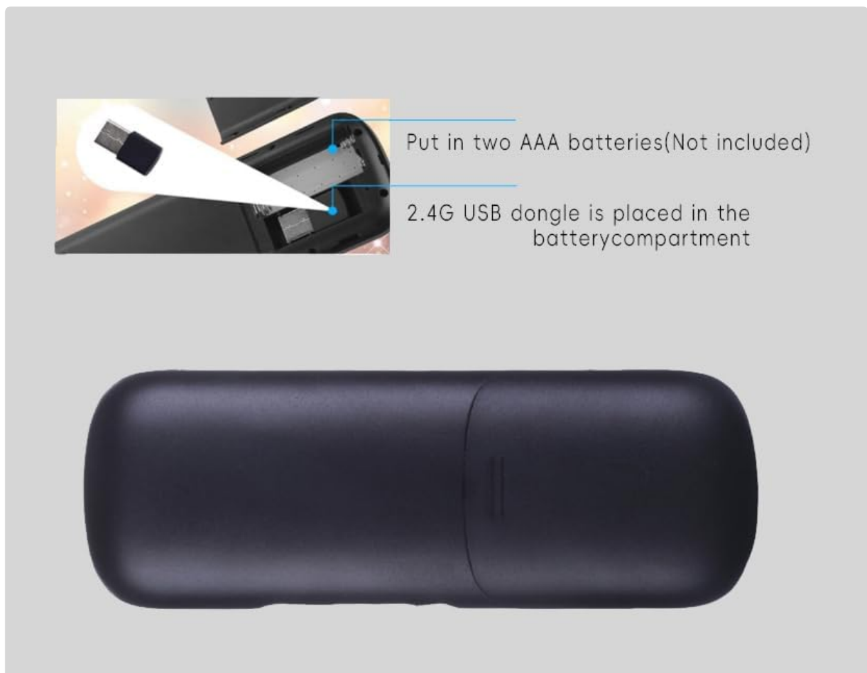
Image: Battery compartment with AAA batteries and USB receiver storage.