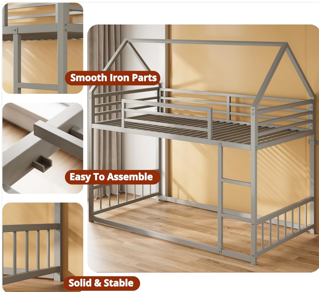
Image: A collage of images highlighting the smooth finish of the iron parts, the ease of assembly with clear connection points, and the overall solid and stable construction of the bunk bed frame.