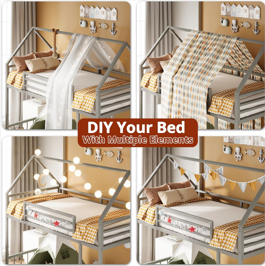
Image: A visual guide demonstrating how to 'DIY Your Bed' with multiple decorative elements, including drapes, string lights, and banners, utilizing the house-shaped frame.