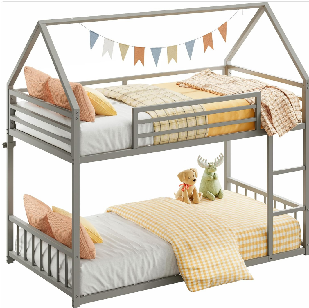
Image: The LIKIMIO Twin Over Twin House Bunk Bed in grey, featuring a house-shaped frame and two sleeping levels.