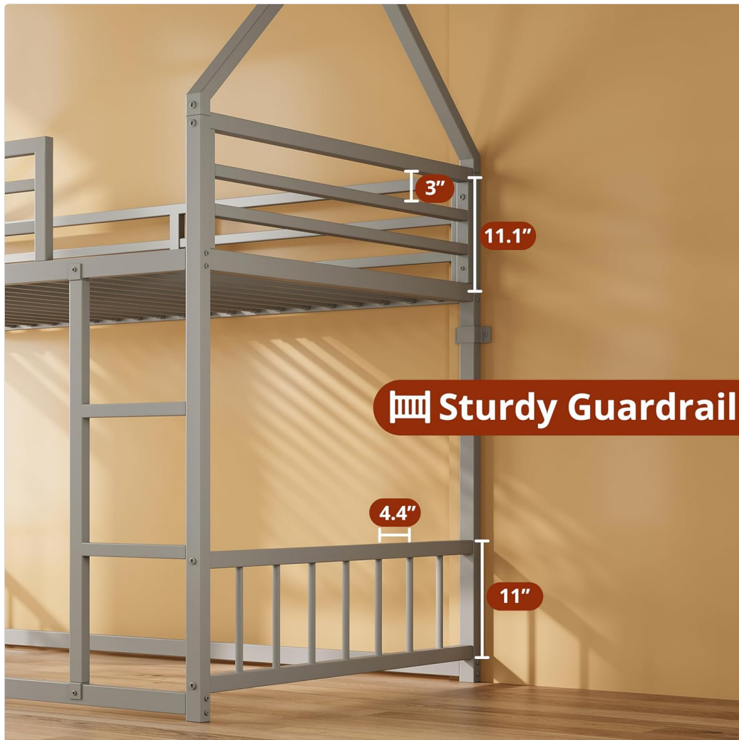
Image: A close-up view of the bunk bed's sturdy guardrails, showing the 11.1-inch height of the upper guardrail and the 11-inch height of the lower rail-style headboard/footboard.