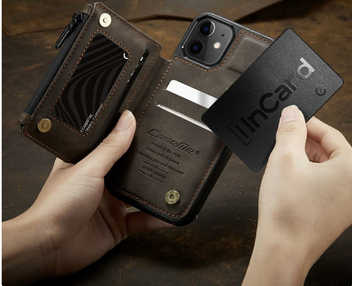
Image: A hand demonstrating how the ultra-slim InCard Finder fits discreetly into a wallet slot, highlighting its credit card-like dimensions.

Slim as a credit card fits right into your wallet without adding bulk