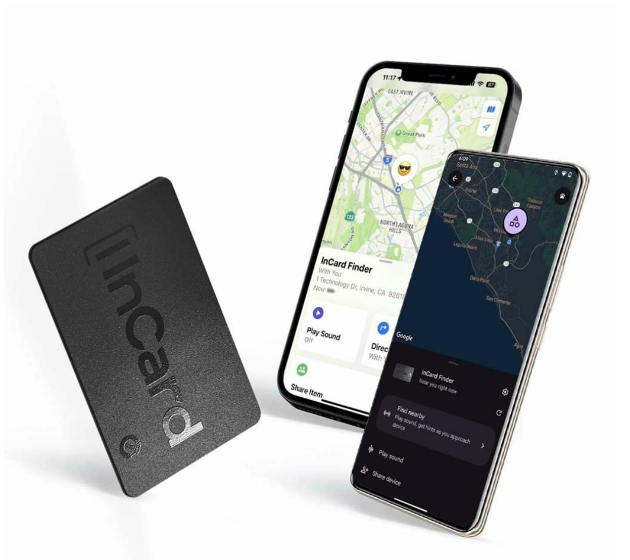
Image: The InCard Finder smart tracker shown alongside two smartphones, one displaying Apple Find My and the other Google Find My Device, illustrating its dual network compatibility.