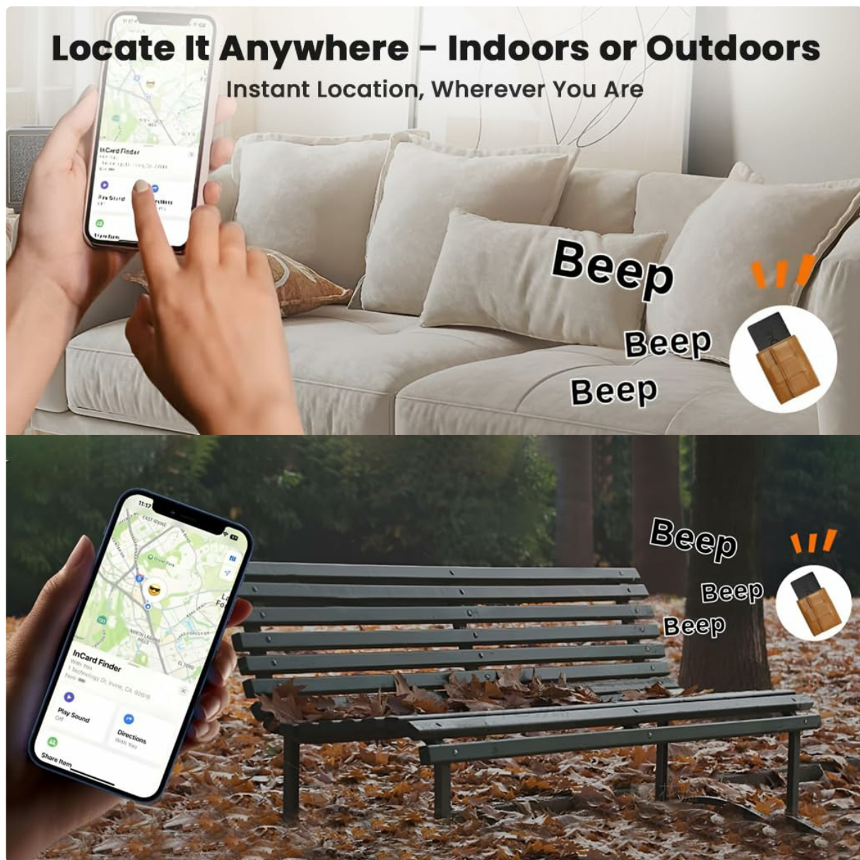
Image: A user interacting with their smartphone to locate the InCard Finder, with visual cues indicating sound alerts both indoors (on a sofa) and outdoors (on a park bench).