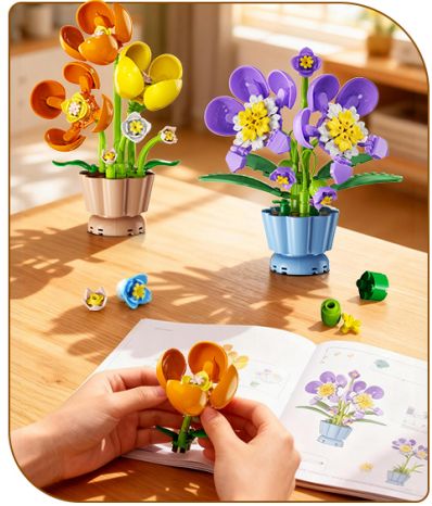
Each flower set is individually packaged with its own instruction booklet and numbered parts.