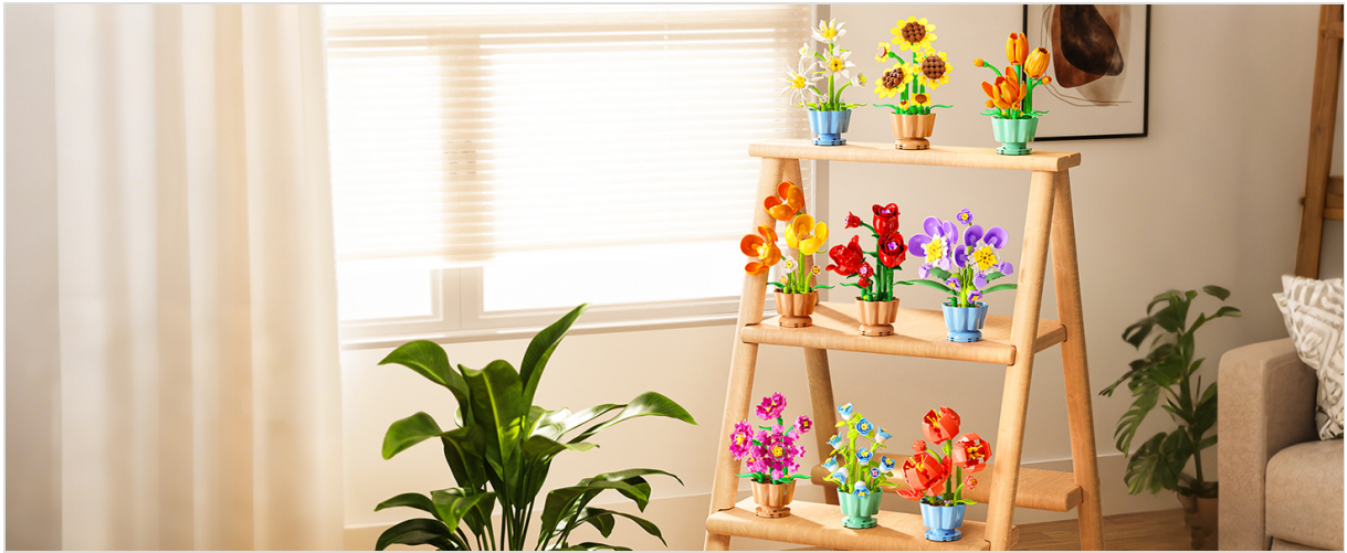
The complete collection of nine flowers displayed on a multi-tiered shelf.