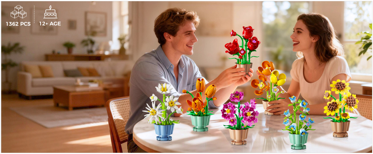
Examples of displaying the finished botanical flower sets in different home and office environments.