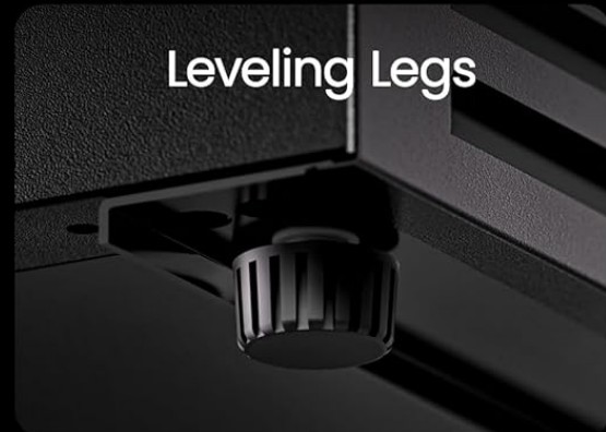
Image: Product Details including LED Light & Control Panel, Reversible Door, Safety Door Lock, Adjustable Shelves, and Leveling Legs.

Video: Demonstrates the features and quiet operation of the ICEVIVAL Beverage Refrigerator.