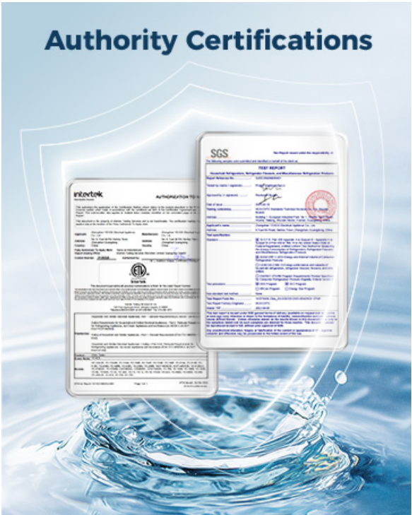
Image: Authority Certifications for product safety.