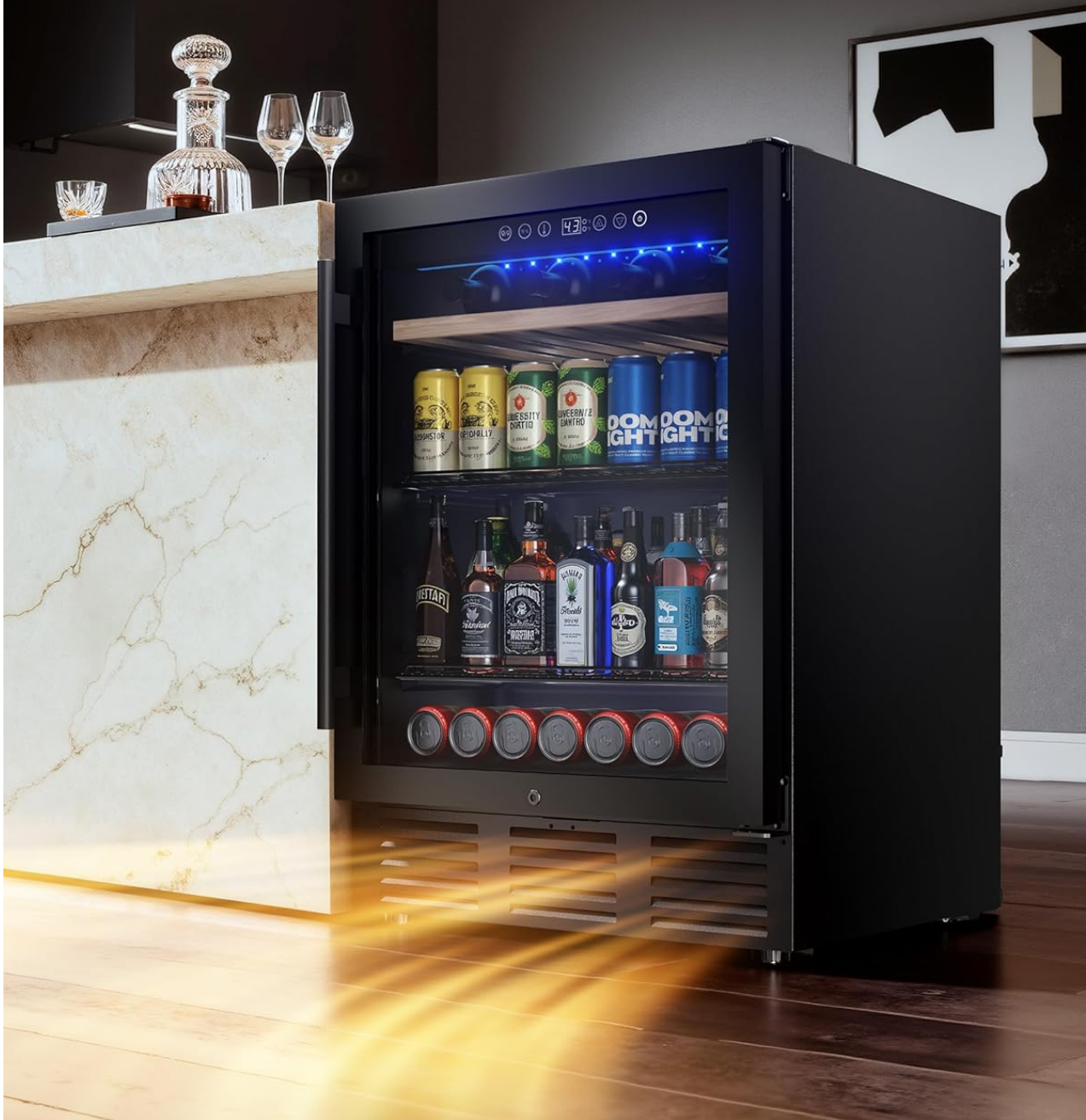
Image: Front Heat Dissipation Design for built-in use.

Front vent design allow for built-in placed