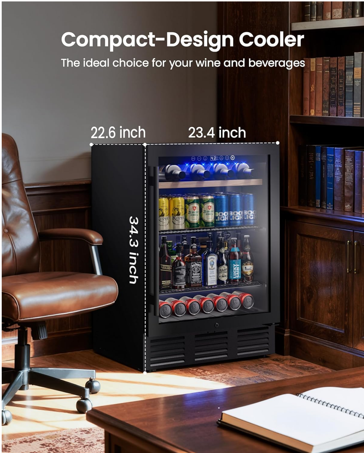
Image: Compact Design and Dimensions for placement.