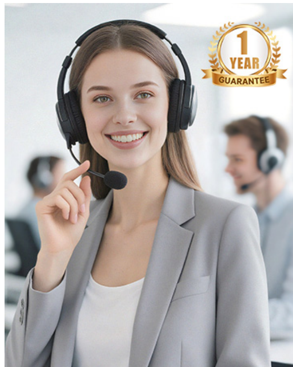
Image: Dedicated After-Sales Service.

We offer responsive after-sales service to ensure you have a worry-free ownership experience.