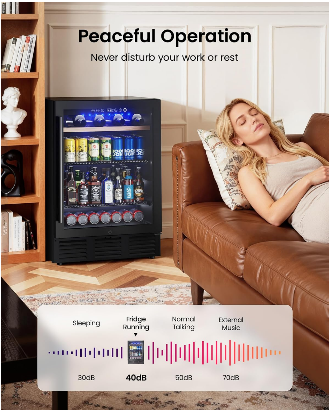
Image: Peaceful Operation with low noise levels.