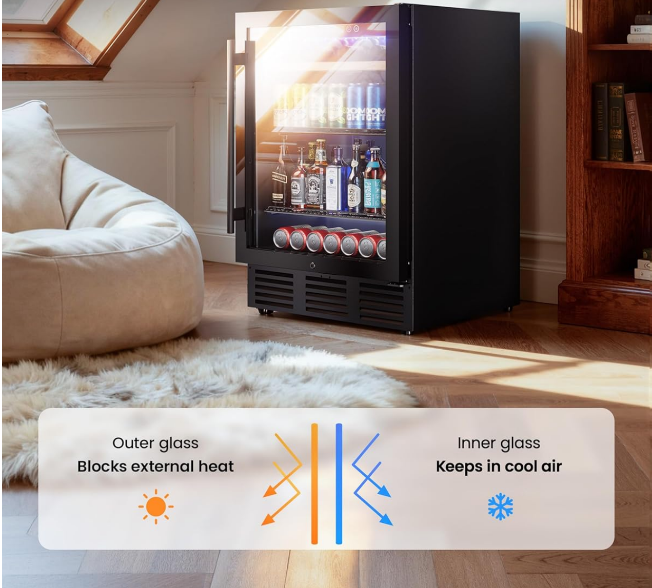
Image: Double-Layer Tempered Glass Door for insulation.

Blocks external heat to reduce energy consumption