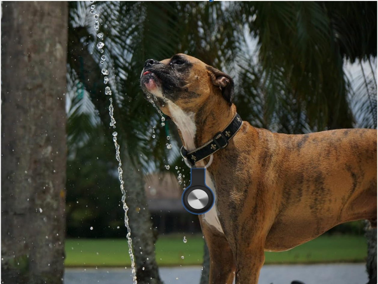
Figure 7: The morngree GPS Tracker features an upgraded waterproof rating, providing protection against rainy weather and splashes, as depicted by a dog wearing the tracker near splashing water.