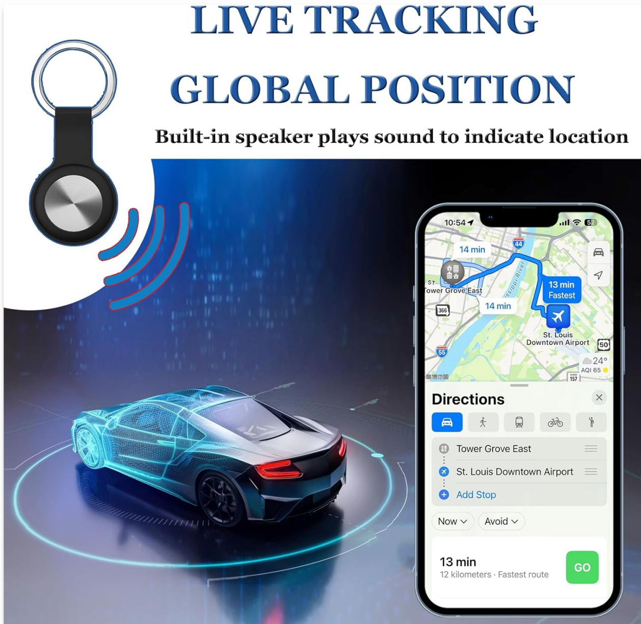
Figure 4: The morngree GPS Tracker offers live tracking and global positioning, with a built-in speaker to help locate items. The image shows a car being tracked on a map via a smartphone app.