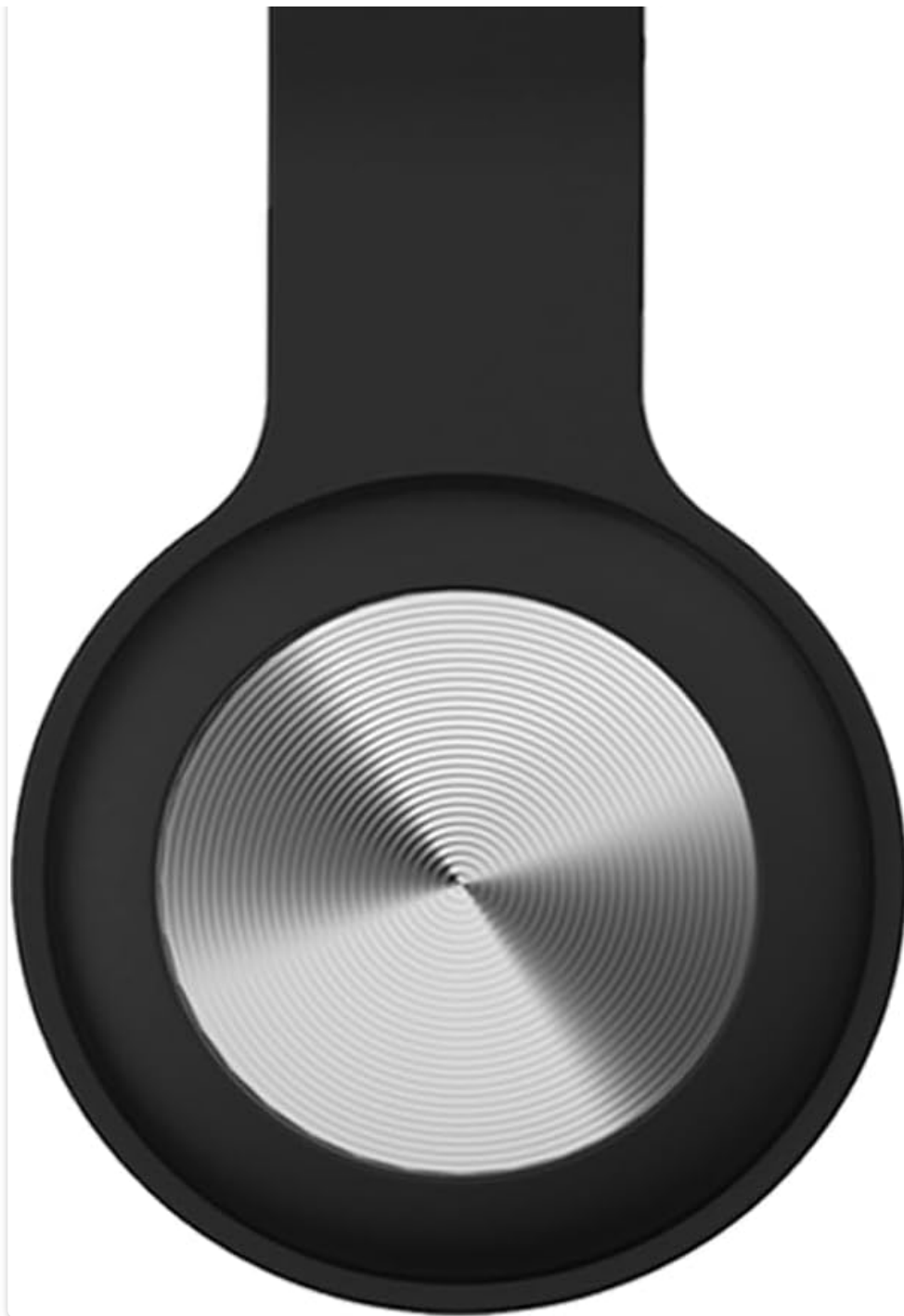
Figure 1: The morngree GPS Tracker Model GF11. This image displays the compact, black circular tracker with a metallic center, attached to a keychain ring, highlighting its portable design.