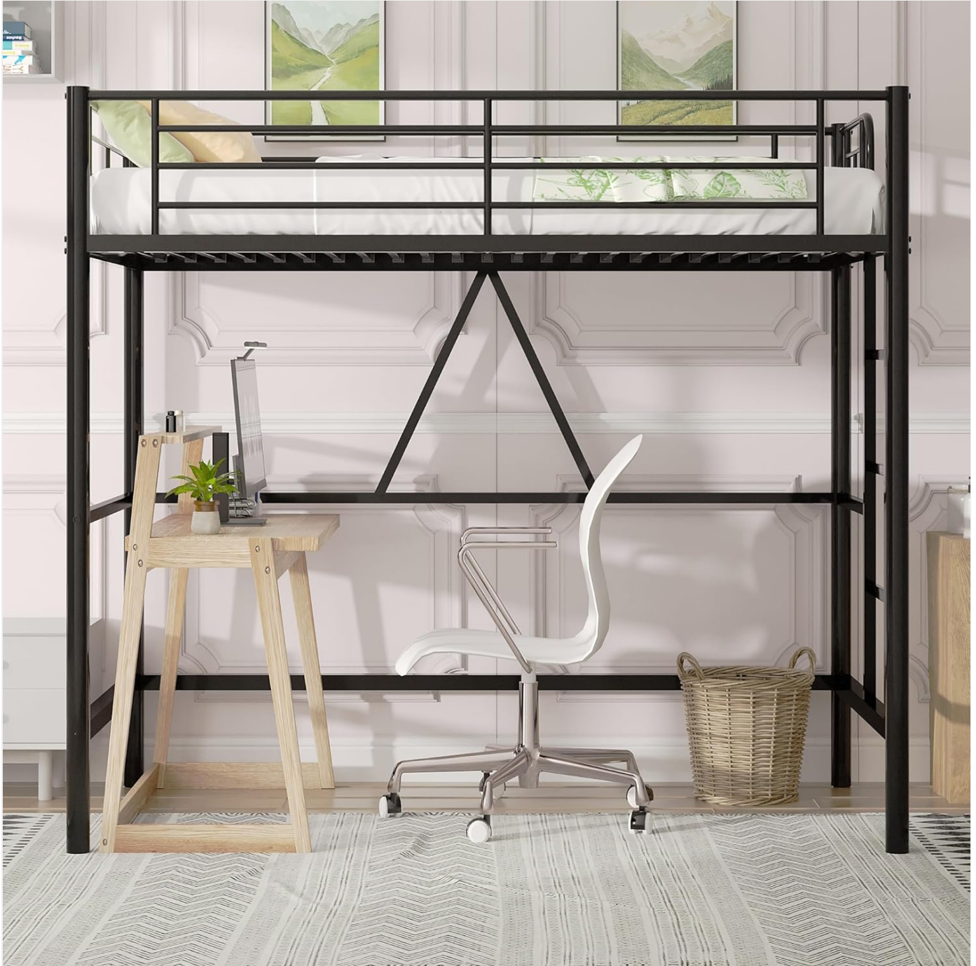
Image Description: A VECELO Metal Loft Bed in a room setting, demonstrating how the generous under-bed space can be utilized to place a desk and chair, creating a functional study or work area beneath the sleeping platform.