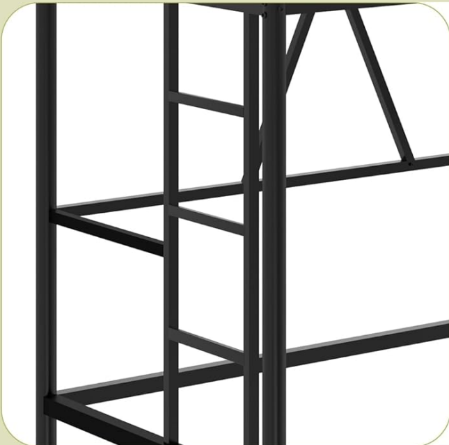
Image Description: An illustration of the VECELO Metal Loft Bed's safety features, including the 13-inch heightened full-length guardrail on the upper bunk and the flexible design of the ladder, which can be installed on either the left or right side of the bed for convenient access.

The ladder can be installed on either side of the bed to help you access the top bunk more easily.