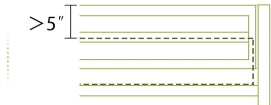
Image Description: A diagram illustrating the dimensions of the VECELO Metal Loft Bed, including its length (78"), width (41.5"), height (72"), guardrail height (13"), and under-bed clearance (59"). It also highlights the 400 lbs weight capacity and recommends a mattress thickness of less than 8", with the mattress surface at least 5" below the guardrail top edge for safety.

The mattress surface of the top bed must be at least 5" (127mm) below the top edge of the guardrail.