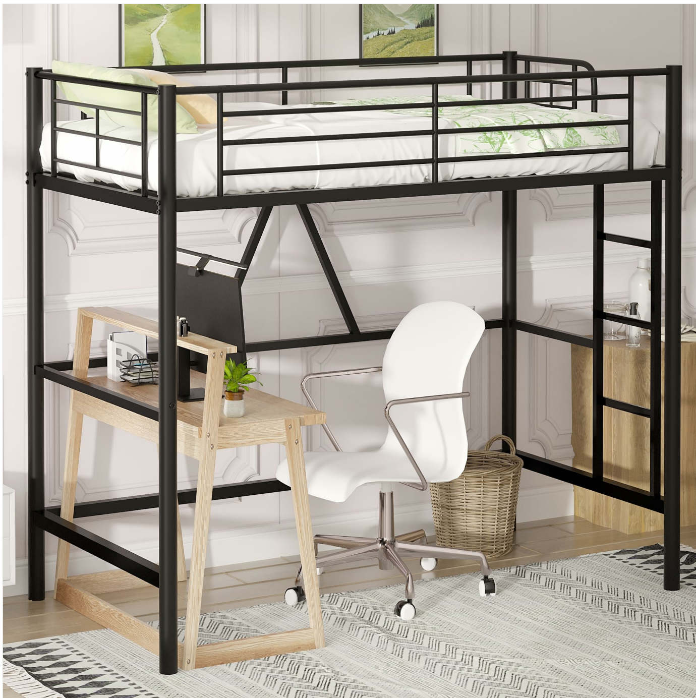
Image Description: A complete view of the VECELO Metal Loft Bed in Matte Black, showcasing its sturdy metal frame, integrated ladder, and safety guardrails. This image provides an overview of the assembled product.