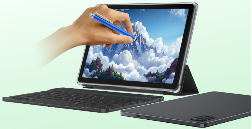
Image: The BESTTAB T20 Tablet showcasing key features of Android 15, such as split-screen multitasking, customizable widgets, and enhanced notification management.