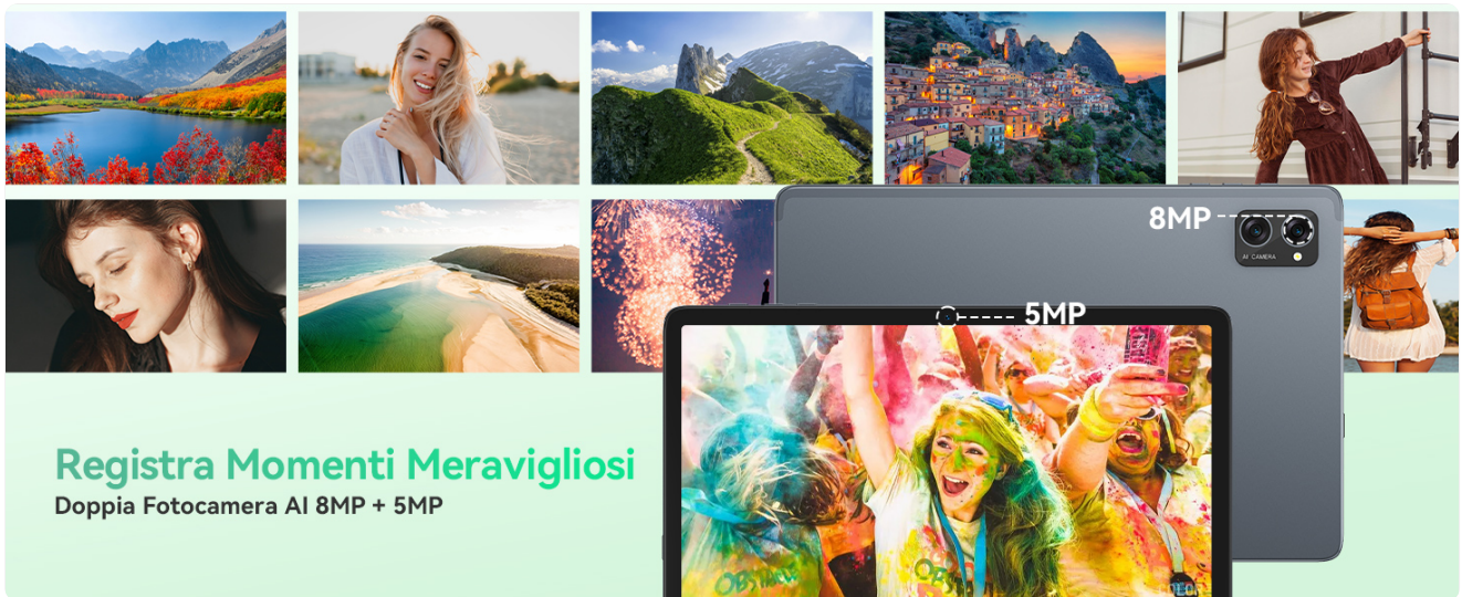
Image: Visual representation of the BESTTAB T20 Tablet's dual AI cameras (8MP rear, 5MP front) and its facial unlock security feature.