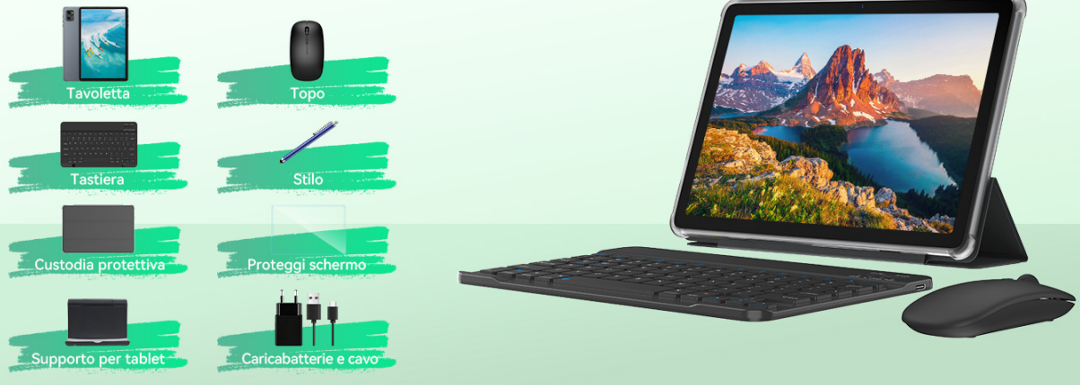
Image: BESTTAB T20 Tablet and its complete set of accessories, including a keyboard, mouse, stylus, protective case, tablet stand, screen protector, charger, and USB cable.