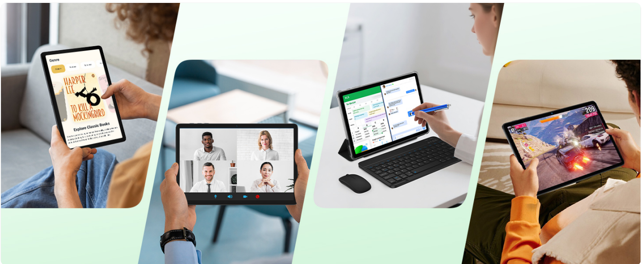
Image: The BESTTAB T20 Tablet being used in various scenarios, including reading, video conferencing, productivity tasks with a keyboard, and gaming, highlighting its versatile applications.