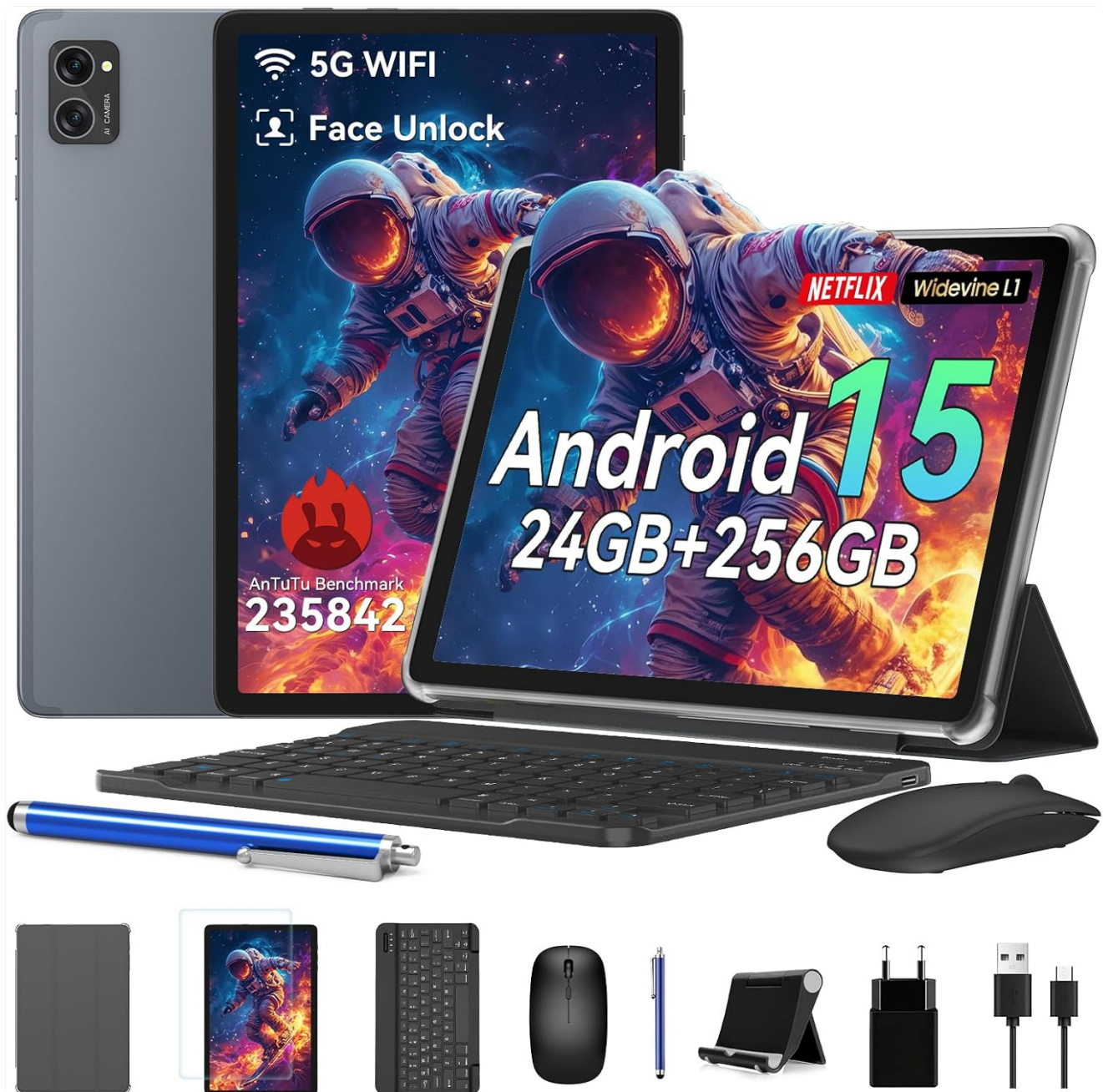
Image: Front and back view of the BESTTAB T20 Tablet, showcasing its sleek design and camera placement.