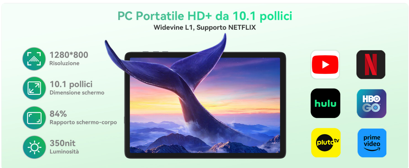
Image: The BESTTAB T20 Tablet displaying its support for Widevine L1, enabling high-definition streaming on popular platforms such as Netflix, Hulu, HBO Go, and Prime Video.