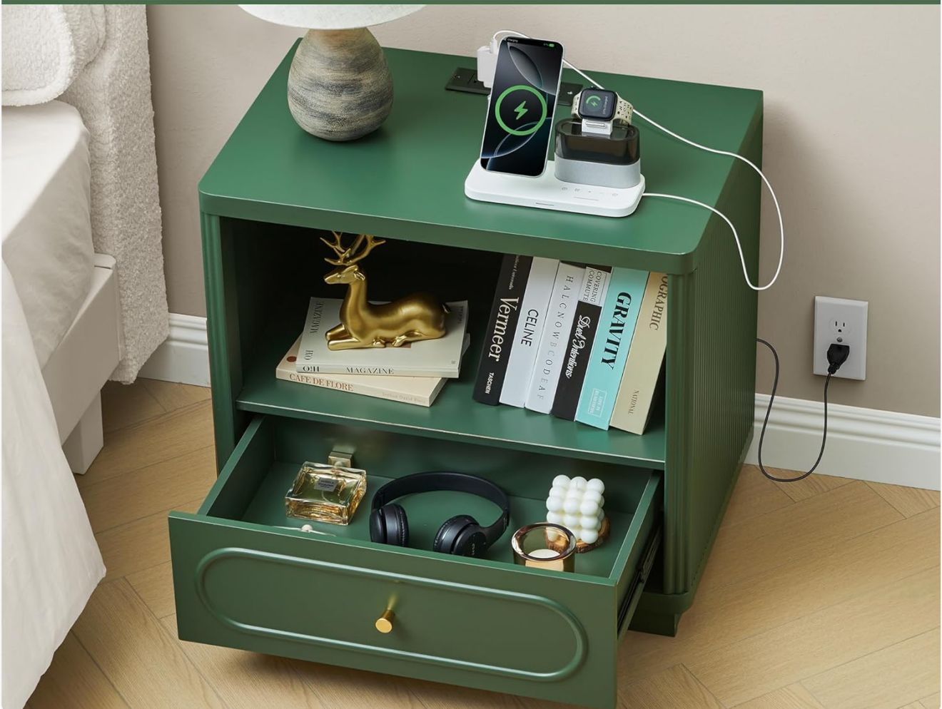
Image: The nightstand with its drawer open, showcasing items like headphones and perfume bottles stored inside.