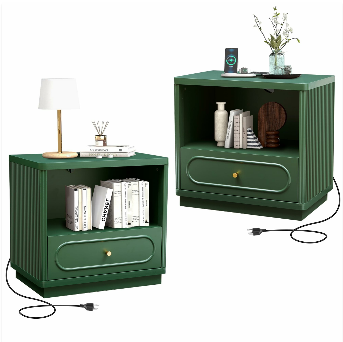
Image: The ORRD Fluted Nightstand in green, featuring a lamp, books, and a charging phone on its surface, next to a bed.