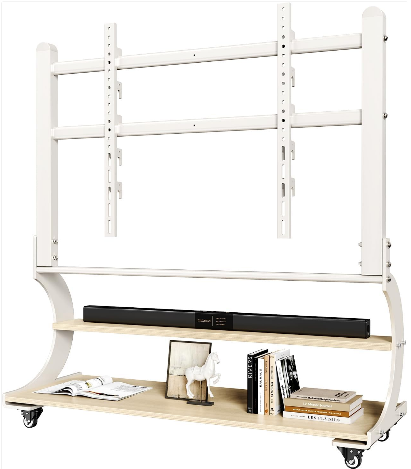
Image: The TV stand with a soundbar and other items on its two wooden shelves, demonstrating storage capacity.