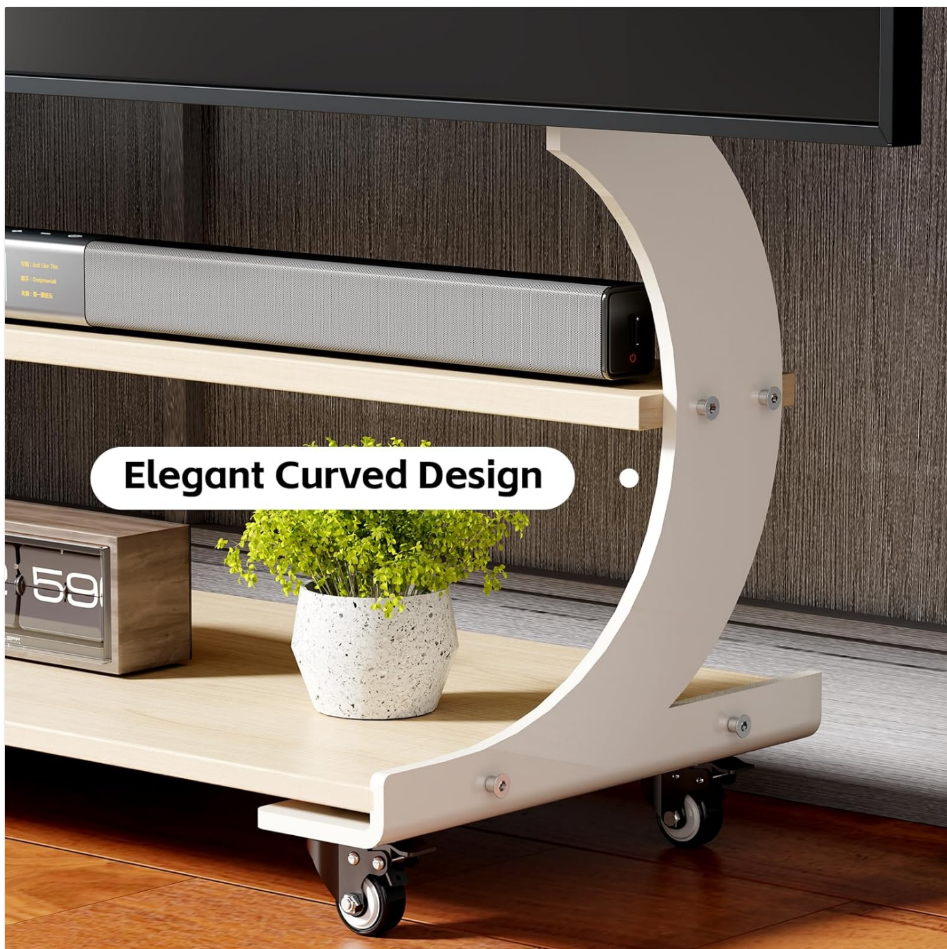
Image: The unique curved design of the stand's frame and shelves.