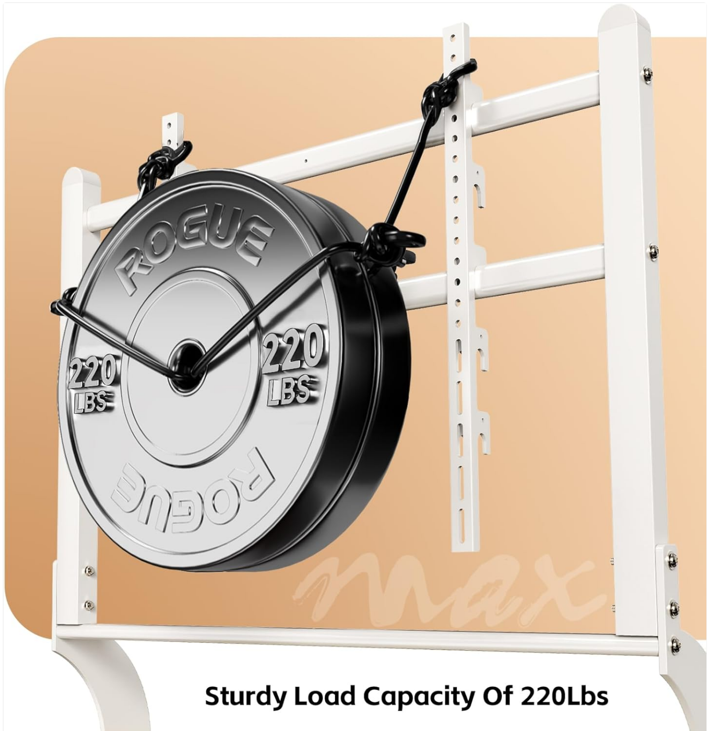
Image: Visual representation of the stand's 220 lbs load capacity, emphasizing its robustness.

With assistance, carefully lift the television and hook the attached mounting brackets onto the horizontal bars of the TV stand. Secure the TV in place using the safety screws or locking mechanisms on the brackets. Ensure the TV is centered and level.