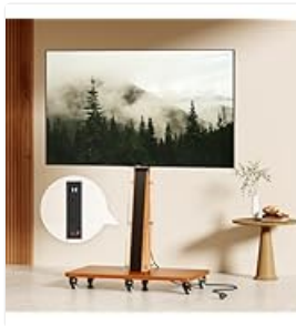
Image: Detail of the locking caster wheels on the stand's base.

Secure the four caster wheels to the bottom of the arc-shaped base frames using the provided bolts and wrench. Ensure that the locking wheels are positioned at the front for easy access.