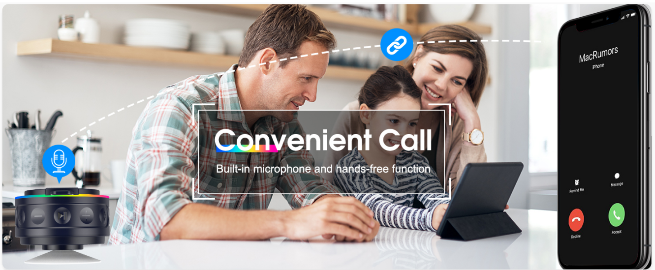
Figure 7: Convenient Call Function. This image illustrates the speaker's built-in microphone and hands-free calling feature, allowing users to stay connected while enjoying music.