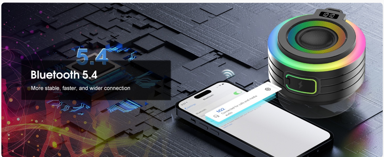
Figure 4: Bluetooth 5.4 Connection. This image shows the speaker wirelessly connected to a smartphone, illustrating the stable and fast Bluetooth 5.4 technology.