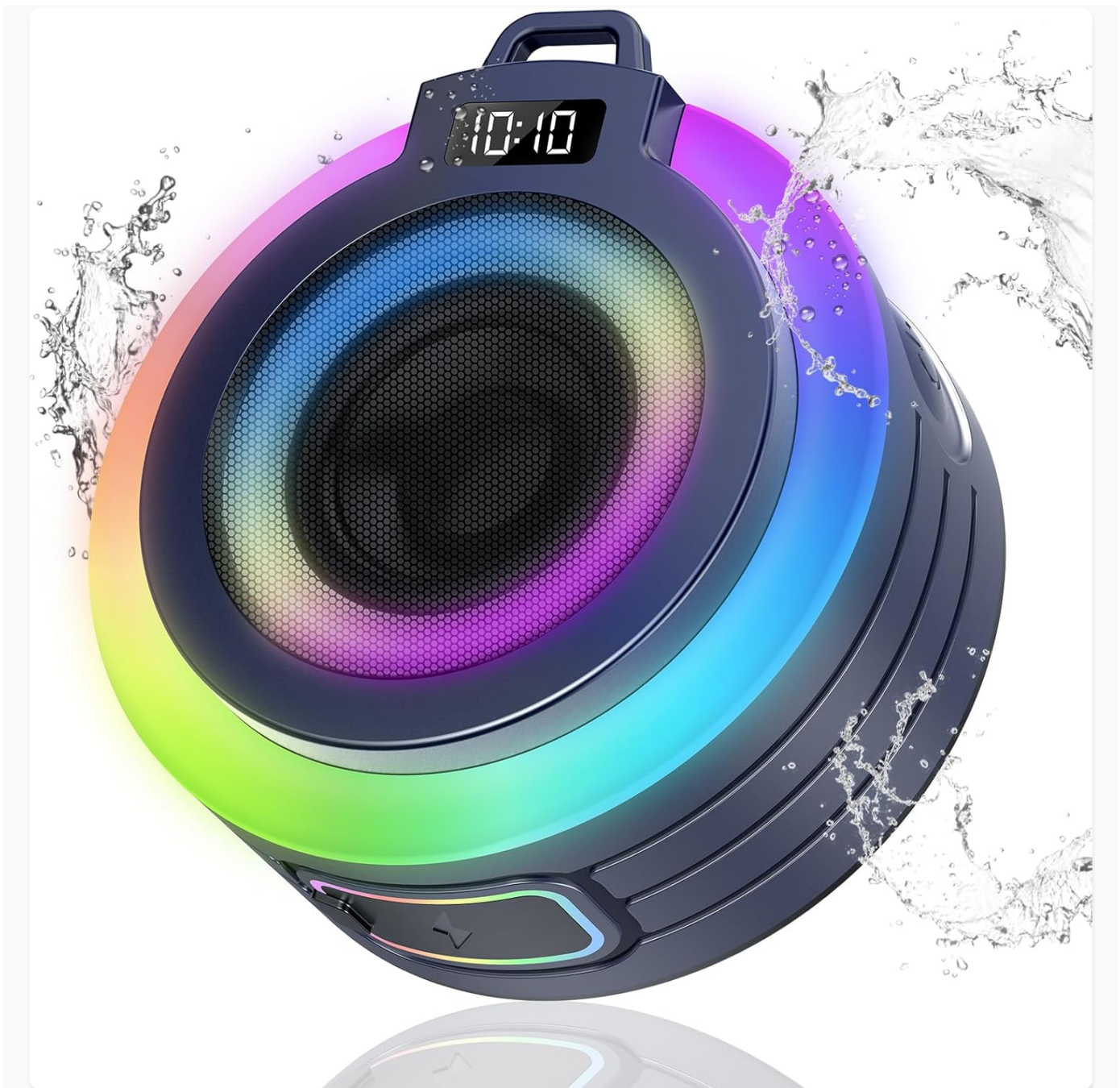
Figure 1: WXQZXO Bluetooth Shower Speaker M22. This image displays the speaker's front view, highlighting its colorful LED light ring and central speaker grille, with water splashes indicating its waterproof nature.