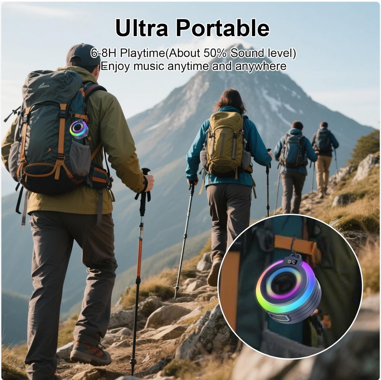
Figure 9: Ultra Portable Design. This image illustrates the speaker's portability, shown attached to a backpack during a hike, highlighting its suitability for outdoor activities.

6-8H Playtime(About 50% Sound level) Enjoy music anytime and anywhere