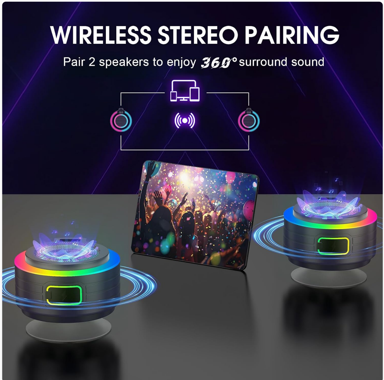
Figure 5: Wireless Stereo Pairing. This image demonstrates two speakers paired together, creating a 360-degree surround sound experience, ideal for enhancing audio for laptops or other devices.