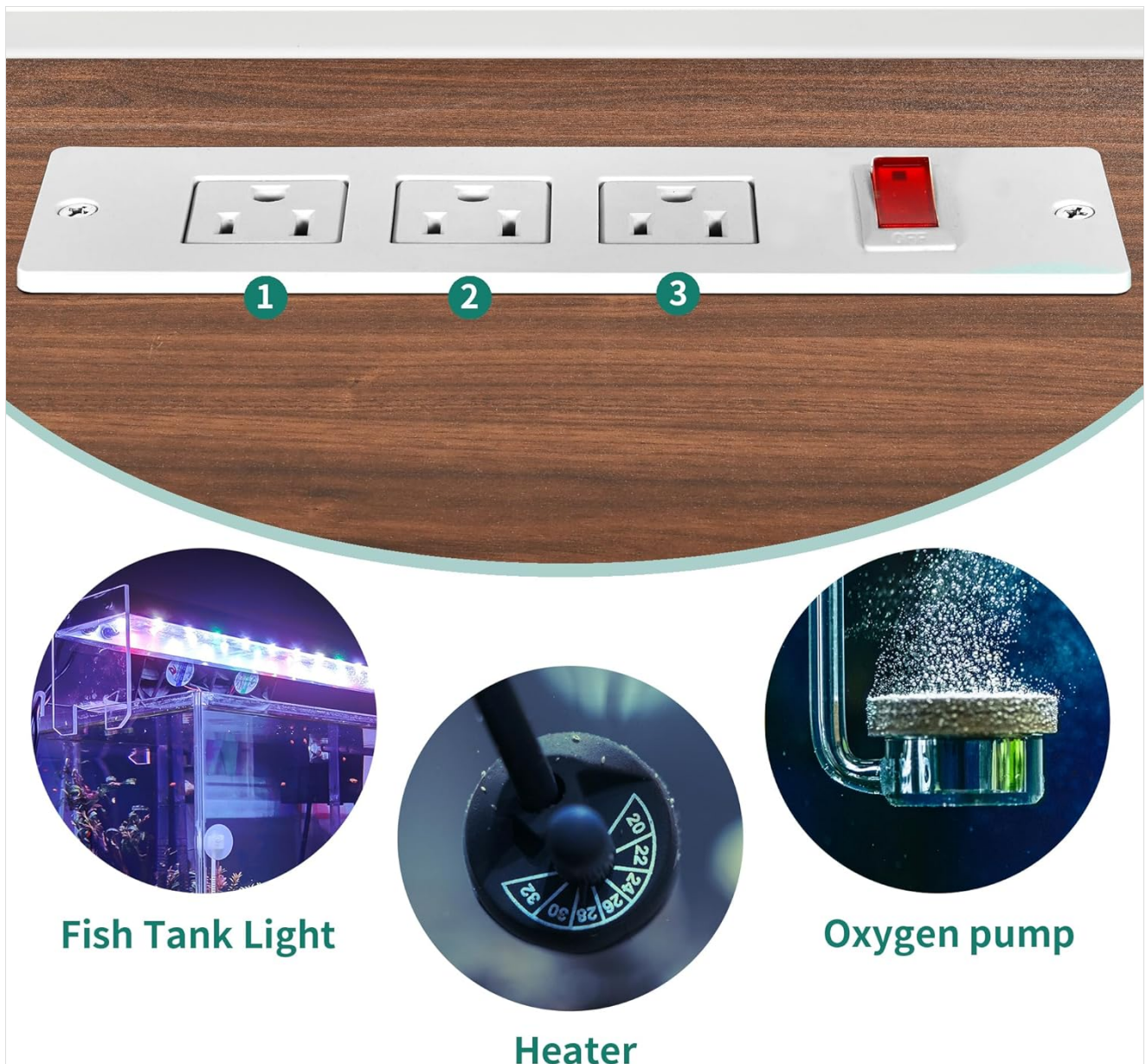
Figure 4.1: Integrated Power Outlet Functionality

This image details the power outlet feature of the stand, showing three electrical sockets and a master on/off switch. It illustrates how various aquarium accessories like lights, heaters, and oxygen pumps can be conveniently powered directly from the stand.