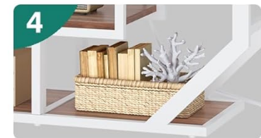
4 Bottom storage