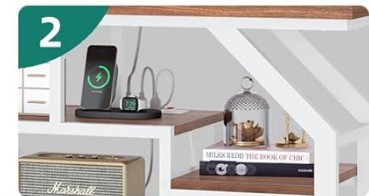
2 Two-tier storage