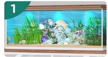
1 Large desktop storage