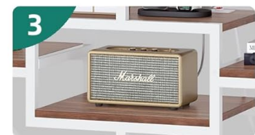
3 Middle layer storage