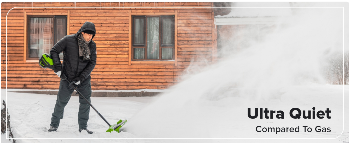
Figure 3: Illustration of the snow shovel's 12-inch clearing width and 8-inch clearing depth, demonstrating its capability to clear a path through snow.