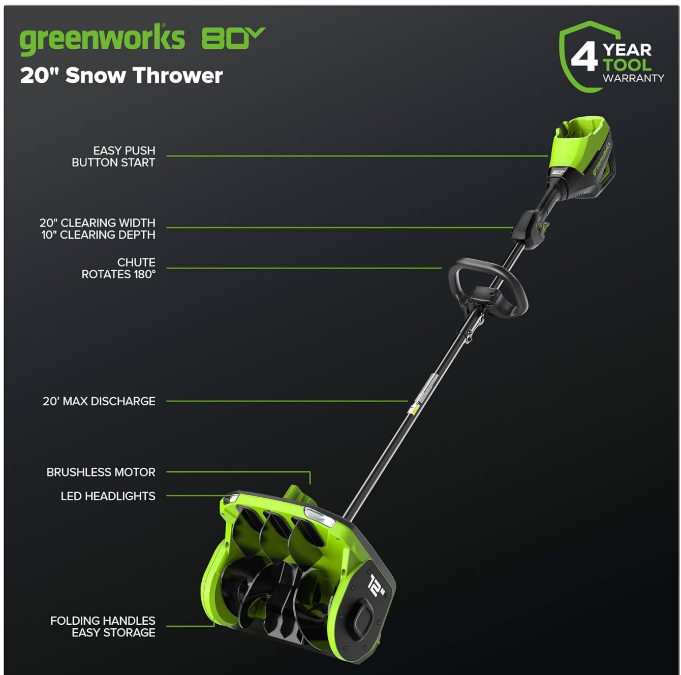
Figure 1: Front view of the assembled Greenworks 80V 12-inch Brushless Snow Shovel. The image shows the green and black main unit with the 12-inch clearing width, the long shaft, and the handle with the battery compartment at the top.