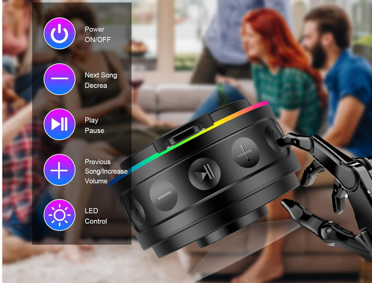
Detailed description of the speaker's control buttons.