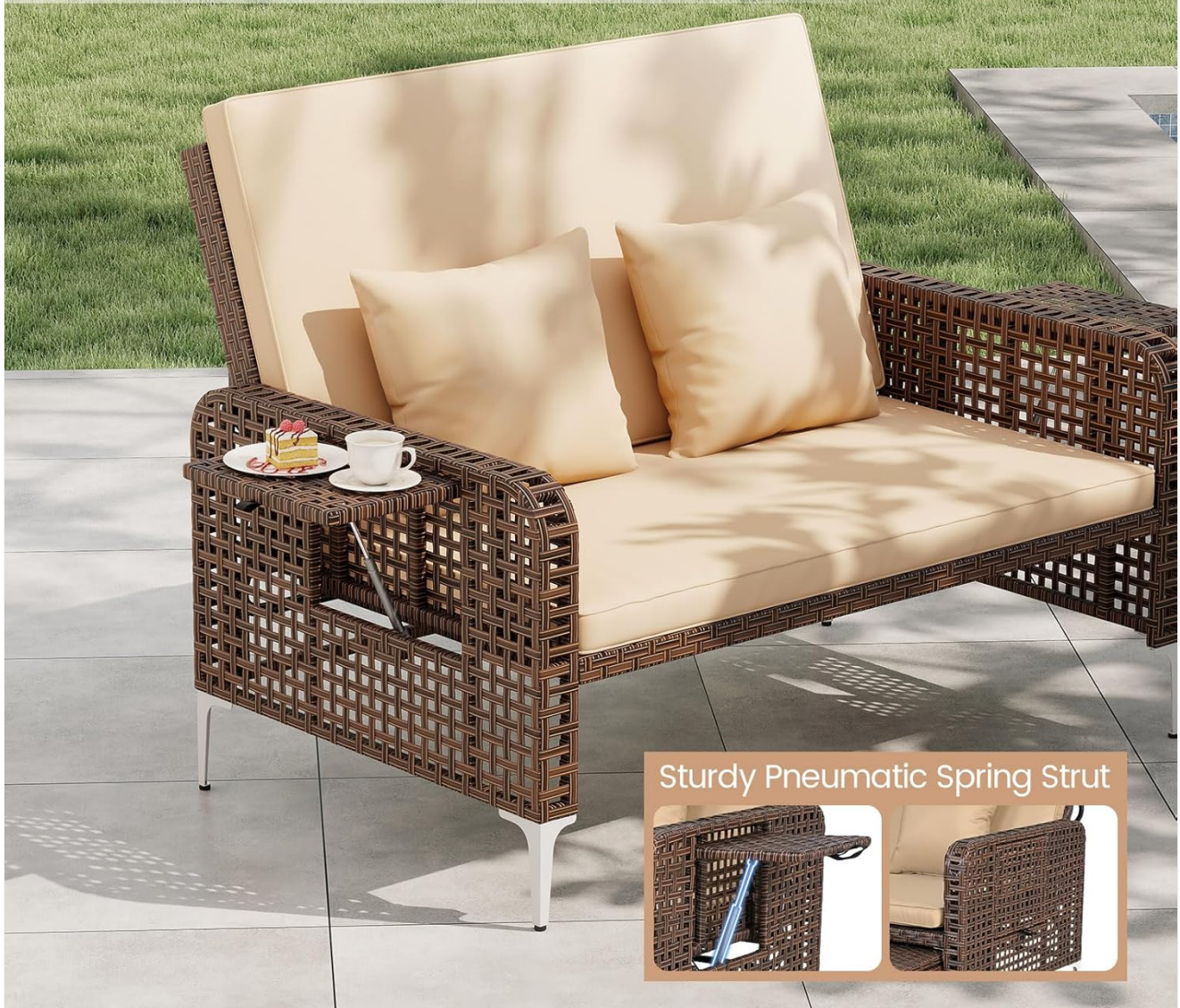
Image: The daybed showcasing its double folding side tables, extended for use with drinks and snacks.