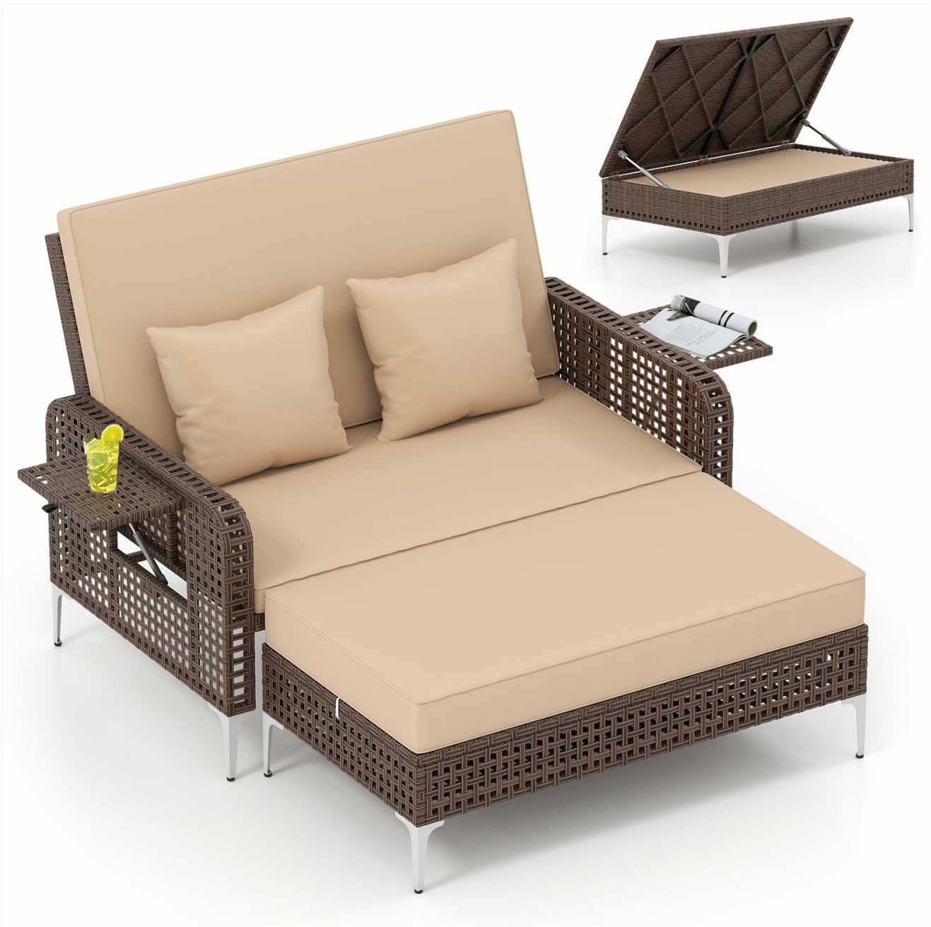
Image: The Tangkula Patio Rattan Daybed with cushions, set in an outdoor garden environment.