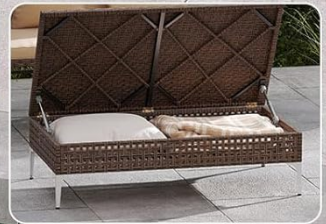
15 Gal Storage Box

Image: Visual representation of the ottoman's multiple uses: as a footrest, additional seating, a side table, and a 15-gallon storage box.