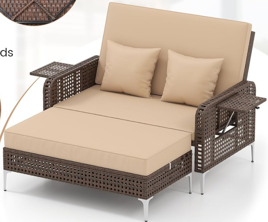
Image: Detailed views of the product's construction, showing the mix brown PE rattan weave, the reinforced metal frame, and the adjustable foot pads.