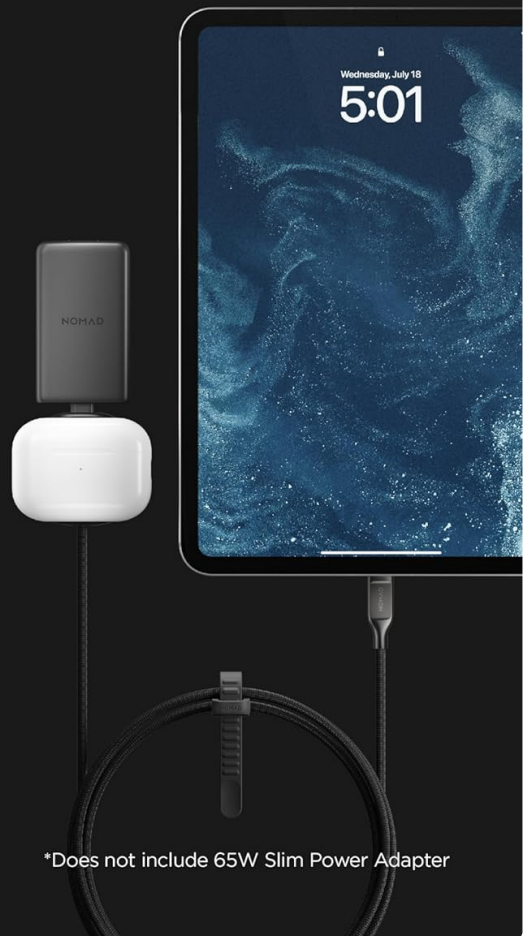
Image: NOMAD Universal Cable highlighting its key features and compatibility with Apple devices.

*Does not include 65W Slim Power Adapter