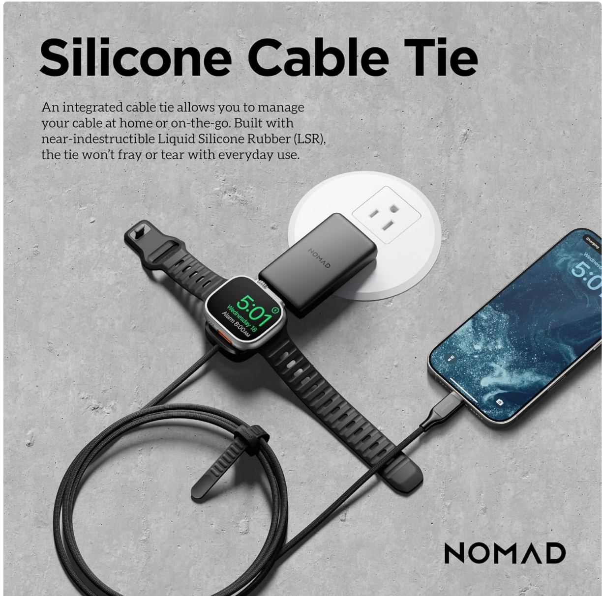
Image: A detailed view of the integrated silicone cable tie, designed for convenient cable management.

An integrated cable tie allows you to manage your cable at home or on-the-go. Built with near-indestructible Liquid Silicone Rubber (LSR), the tie won't fray or tear with everyday use.