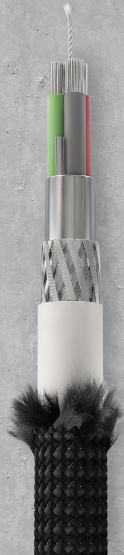
Image: Diagram illustrating the internal construction of the NOMAD cable, highlighting its durable and high-performance components.