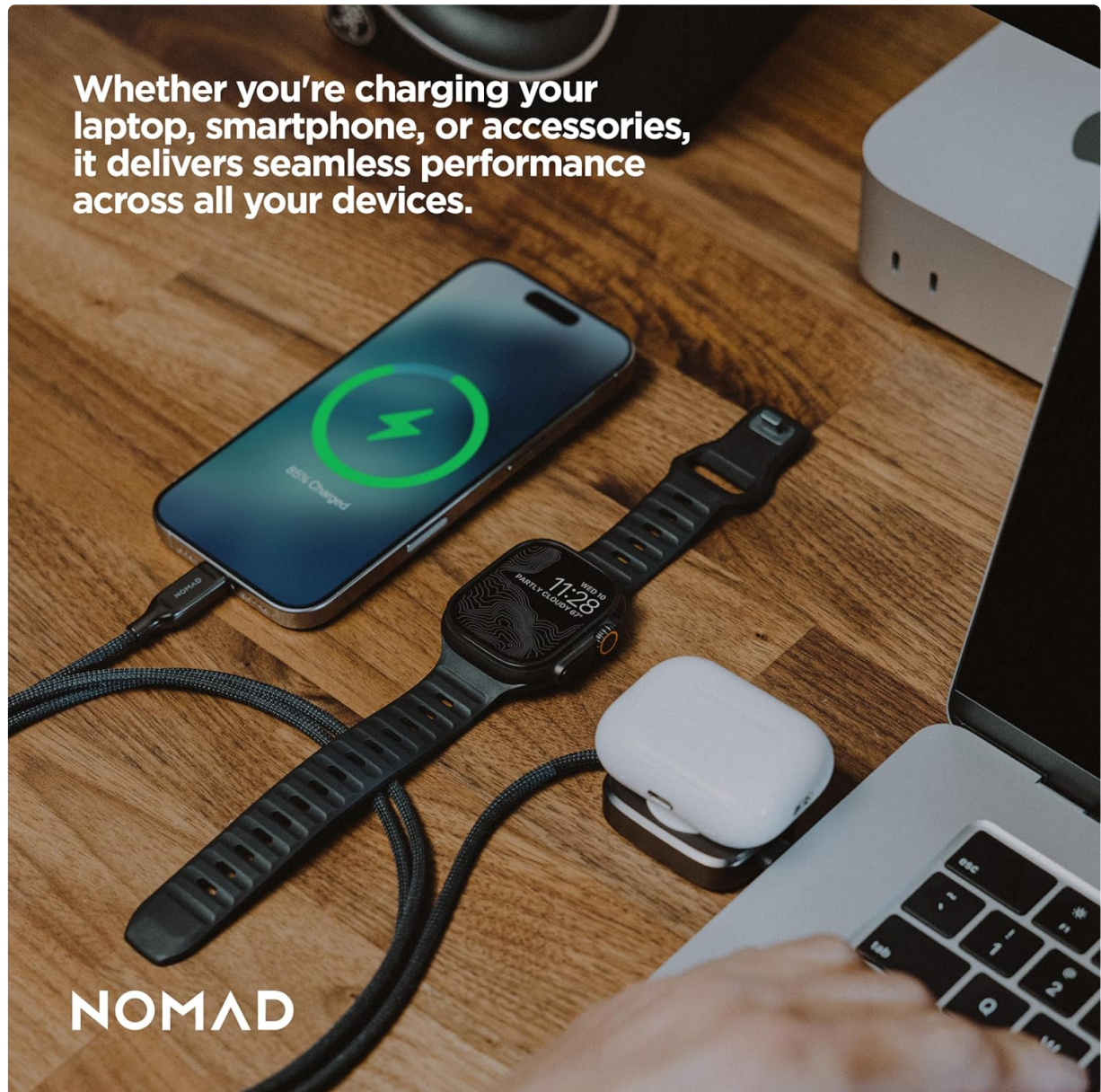
Image: The NOMAD Universal Cable demonstrating its ability to charge multiple devices, including an Apple Watch, AirPods, and an iPhone, from a single power source.

Your browser does not support the video tag.